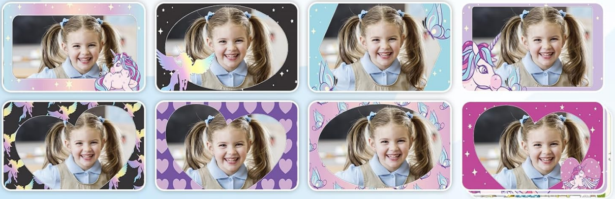
Figure 8: Creative filters, mirror effects, and frames.