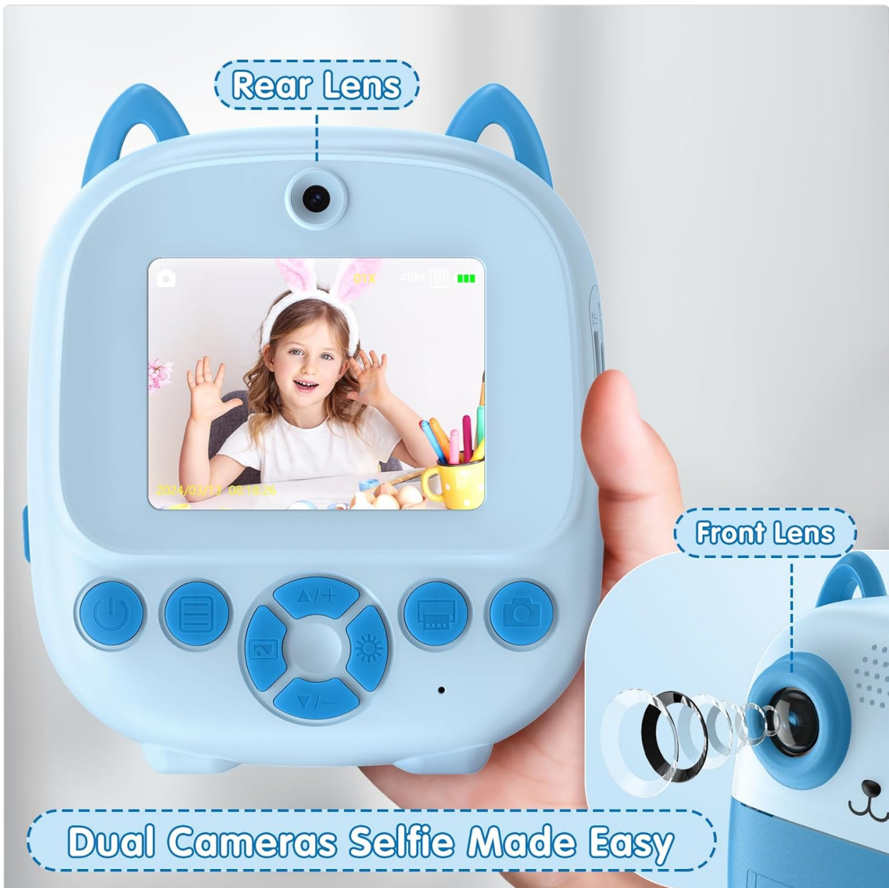
Figure 4: Dual camera lenses for versatile photography.

Navigate to photo mode using the menu buttons. Frame your shot using the 2.4-inch HD screen. Press the shutter button to capture a photo. The camera features dual lenses for front and rear photography.