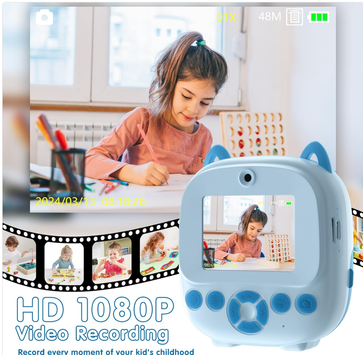
Figure 7: HD 1080P Video Recording feature.

Switch to video mode. Press the shutter button to start recording and press it again to stop. The camera supports 1080P video resolution.