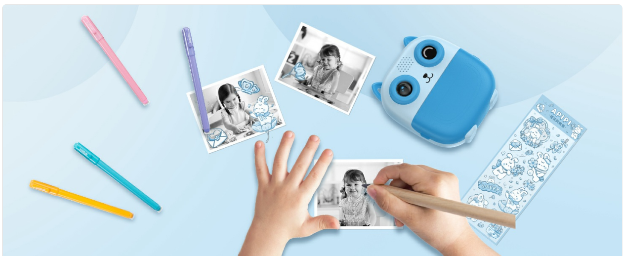
Figure 6: Personalizing instant prints with coloring.

Children can color or doodle on the printed photos to personalize them.