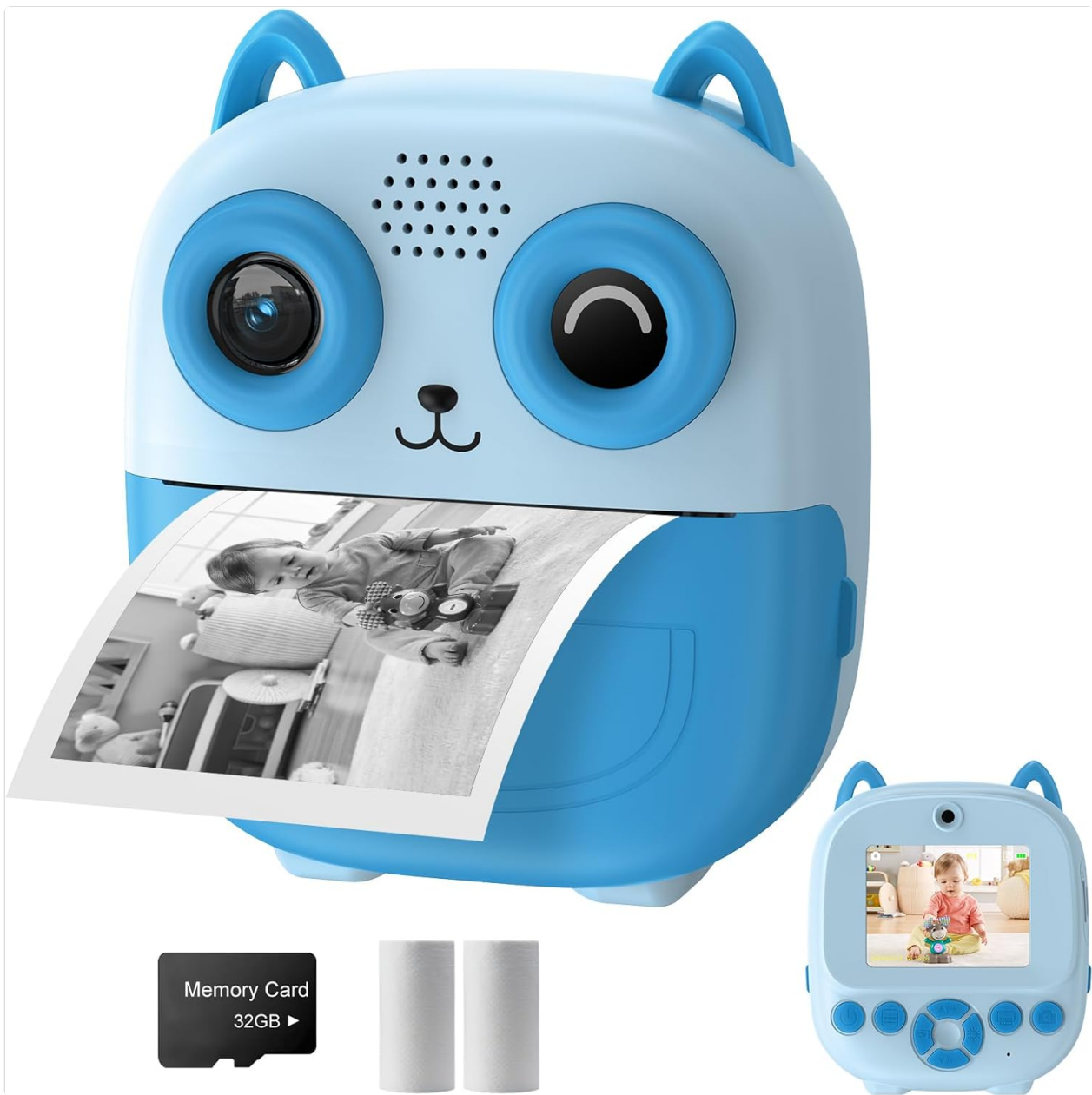
Figure 1: Tosisot S5 Kids Instant Print Camera (Blue)