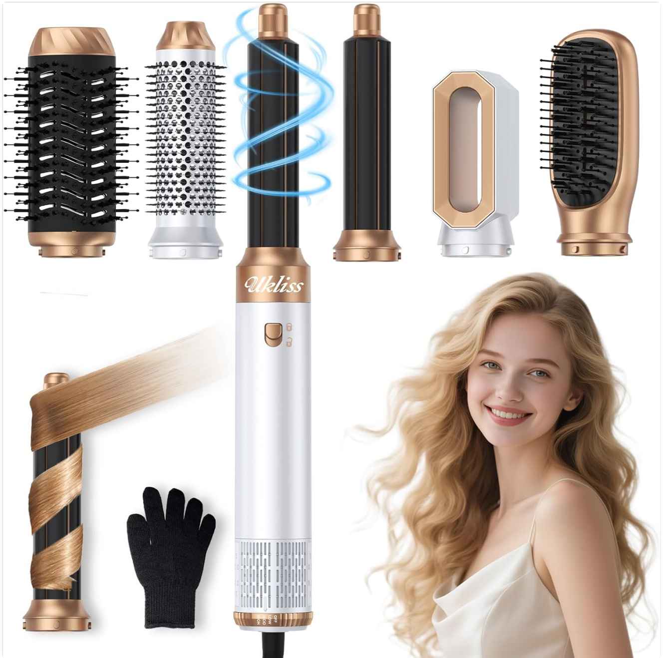
Figure 1: The UKLISS 6-in-1 Hair Dryer Brush and all its included attachments.