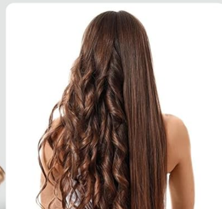
Left curly hair