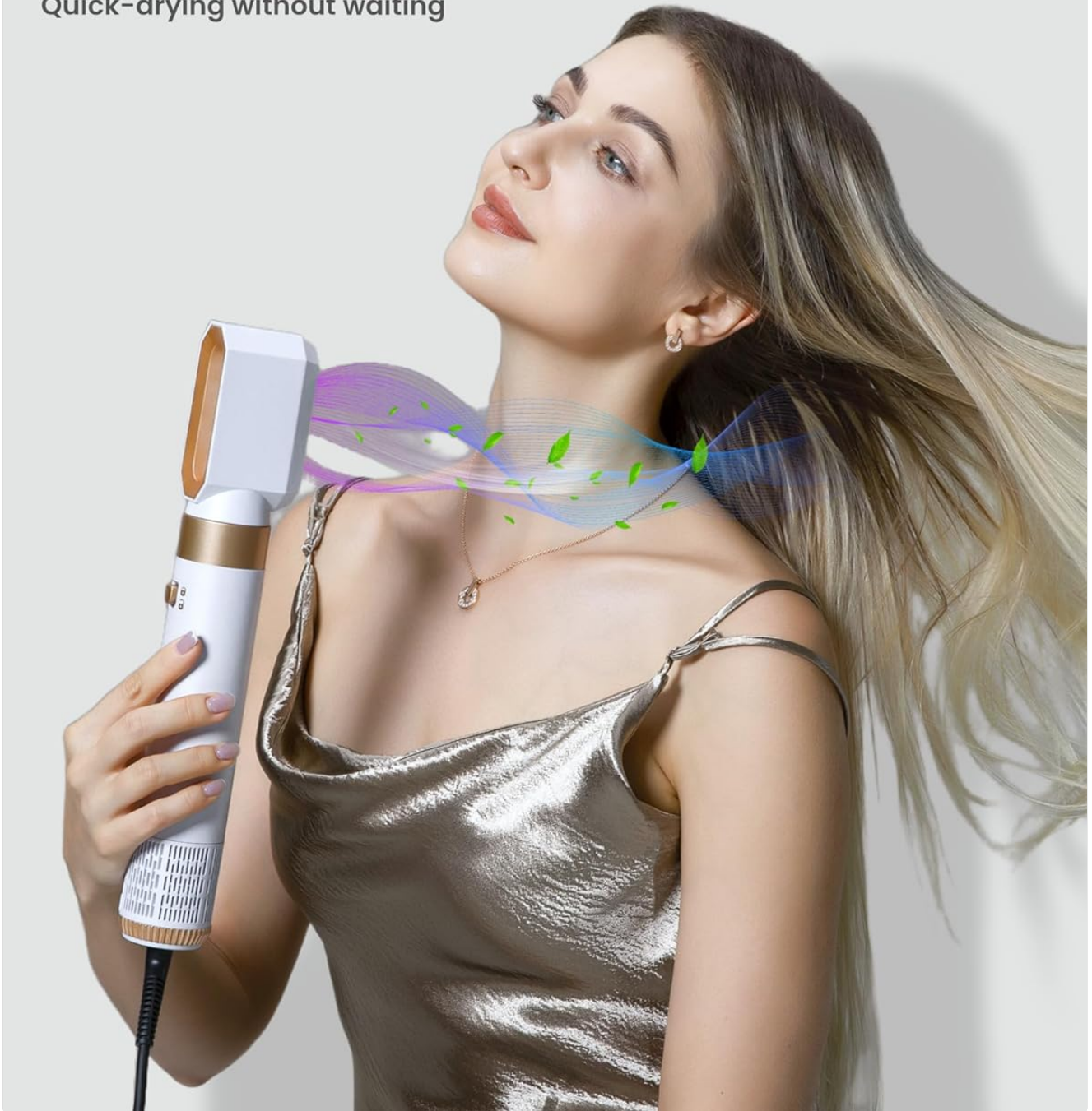
Figure 4: The blow dryer head efficiently dries hair.