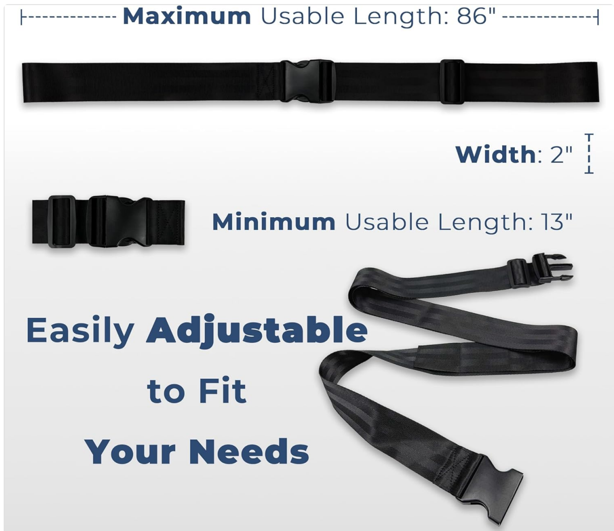
Image 8.1: Visual representation of the belt's adjustable length (13" to 86") and width (2").