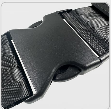
Image 3.3: Close-up view of the cross-box stitching, demonstrating the reinforcement at the buckle connection point.

Reinforced with cross-box stitching at the belt-to-buckle connection, our wheelchair lap belt ensures extra durability and strength where it matters most.