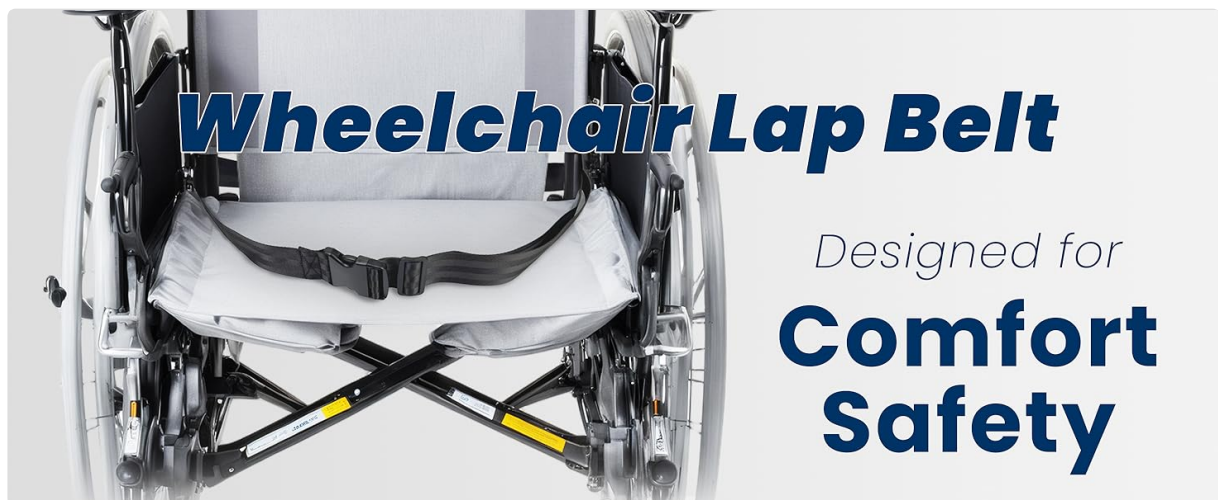
Image 1.1: The PSNOOK Wheelchair Lap Belt, highlighting its design for comfort and safety.

This manual provides essential instructions for the proper installation, use, and maintenance of your PSNOOK Adjustable Wheelchair Safety Strap Seat Belt. Designed to enhance safety and provide stable support, this belt is suitable for individuals requiring extra security in wheelchairs, transport chairs, and mobility scooters. Please read this manual thoroughly before use to ensure safe and effective operation.