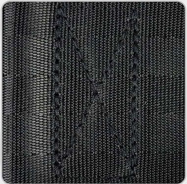
Image 3.2: Detail of the five-twill weave, illustrating the enhanced strength and smooth finish of the strap material.

Our wheelchair lap belt features advanced five-twill weaving for enhanced durability, increasing resistance to stretching and tearing, while ensuring long-lasting performance and comfort.