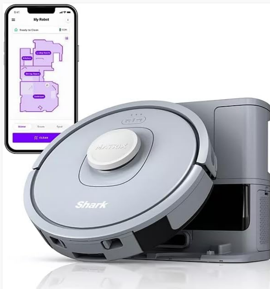
Image: The Shark Matrix robot vacuum docked with its self-empty base, alongside a smartphone displaying the SharkClean app with a home map.

Carefully remove all packaging materials from the robot and the self-empty base. Place the self-empty base against a wall in an open area, ensuring there are no obstacles within 3 feet (1 meter) on either side and 5 feet (1.5 meters) in front. Plug the power cord into the base and then into a wall outlet.