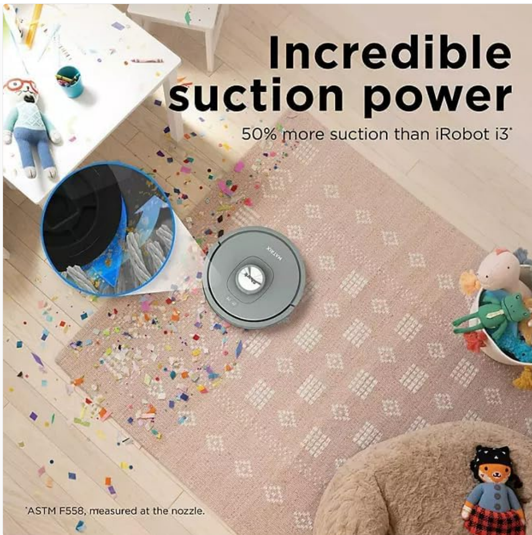
Image: The Shark Matrix robot vacuum cleaning a rug covered in confetti and debris, with an inset showing the powerful suction action.