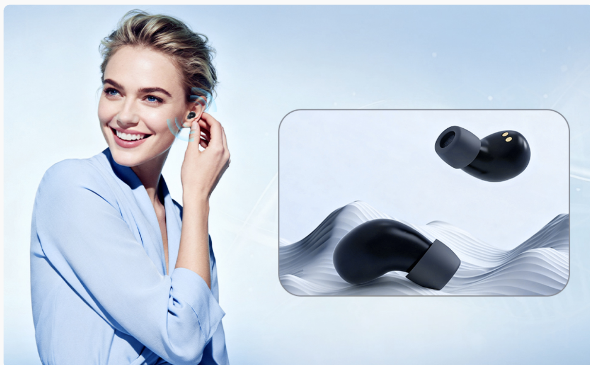
Figure 5.3: Diagram illustrating the comfortable and pressure-free fit of the earbuds.