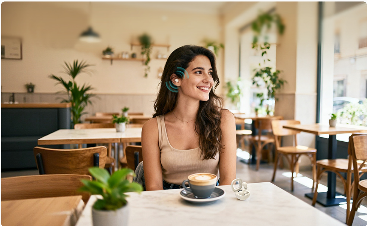
Figure 2.3: Woman wearing Honcas Mini Earbuds discreetly in a cafe, demonstrating their low-profile fit.