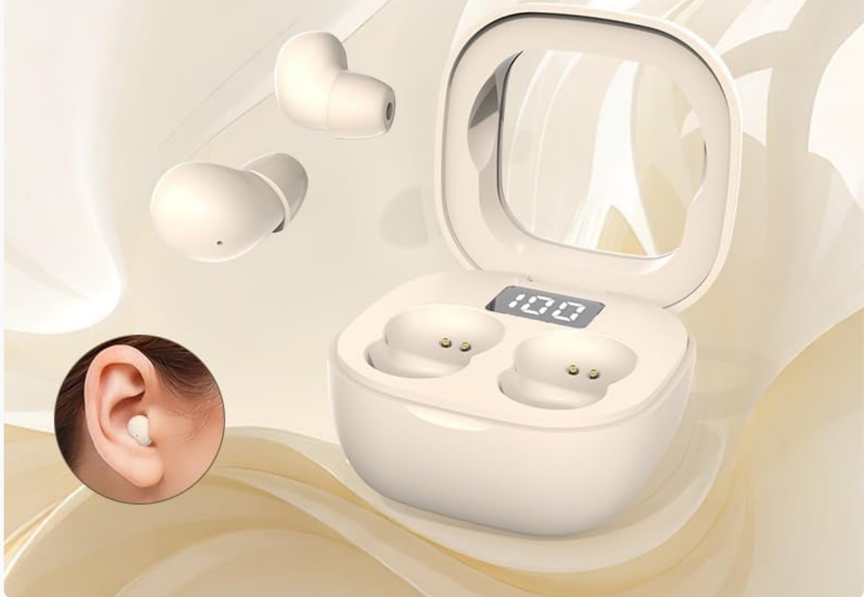
Figure 5.1: Charging case with USB-C port for power input.