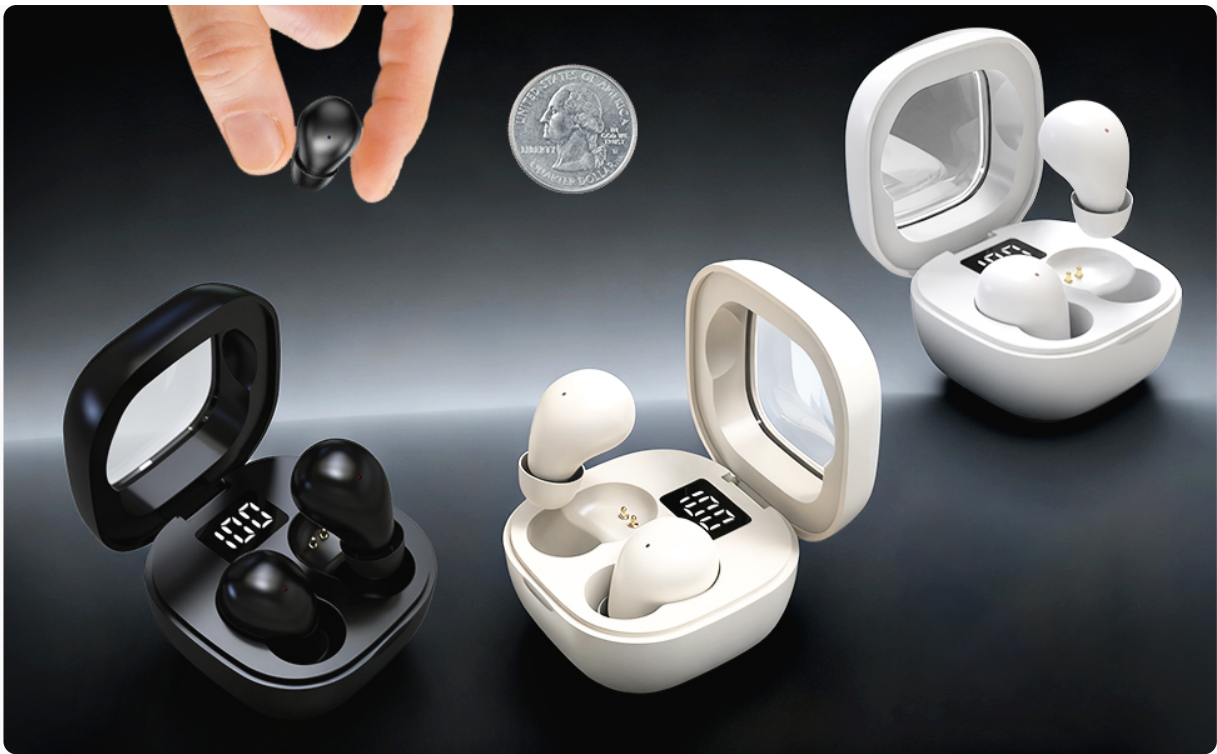
Figure 2.2: Size comparison of Honcas Mini Earbuds next to a dime, highlighting their compact size.