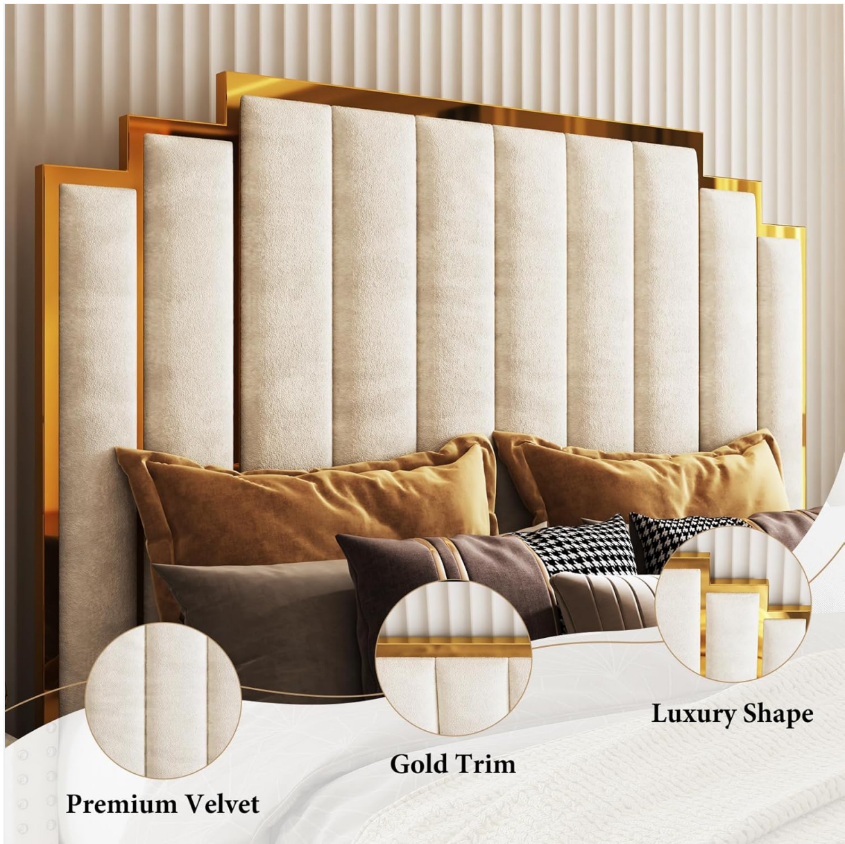
Image: A detailed view of the headboard, showcasing the premium velvet upholstery and the shiny gold trim, highlighting the materials that require specific care.