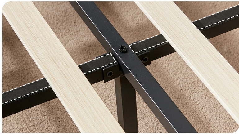
Image: A close-up view of the bed frame's wooden slats and metal support, highlighting the integrated EVA sponge and foam tape designed for noise reduction and a quiet sleep experience.

EVA Sponge for Noise-free Foam Tape for Quiet Sleep