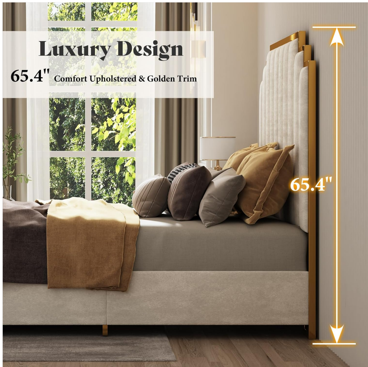
Image: The fully assembled AMERLIFE King Size Upholstered Bed frame, showcasing the cream velvet headboard with gold trim and the wooden slat support system, ready for a mattress.

Your browser does not support the video tag.