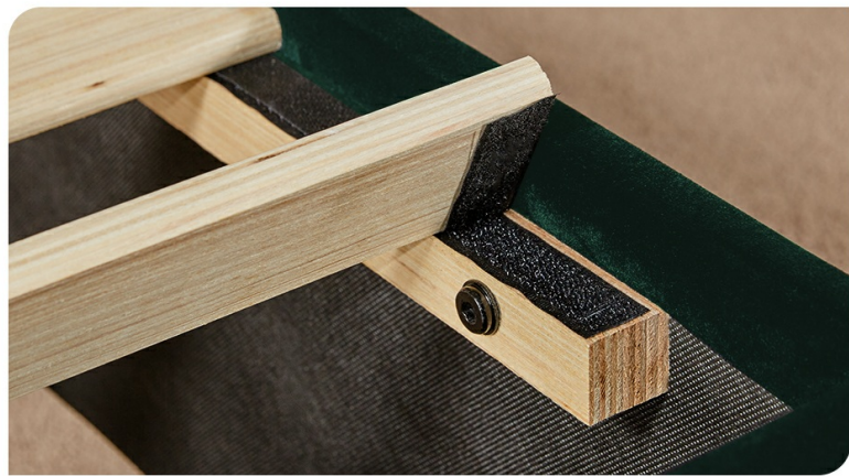
Image: A detailed view of the Velcro design on the bed frame slats, illustrating how it helps to secure the mattress and prevent shifting, contributing to a stable and comfortable sleeping surface.