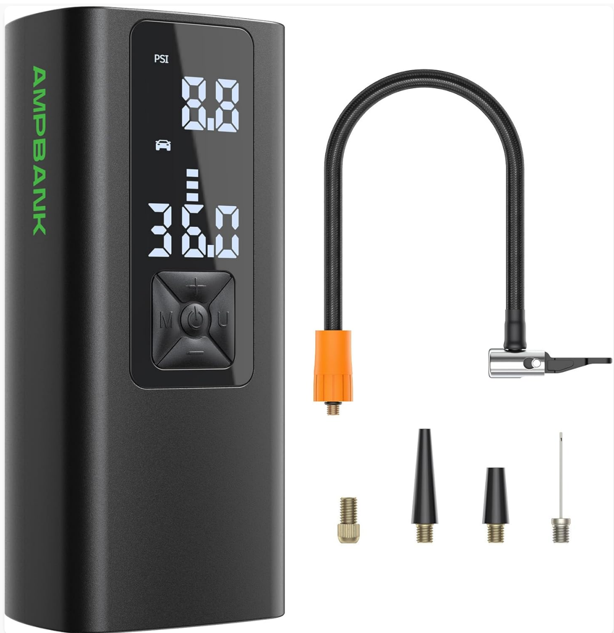
The AMPBANK AT003 Portable Tire Inflator, shown with its flexible air hose and various inflation adapters.