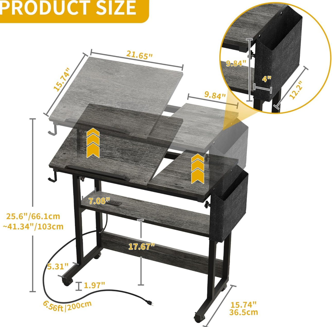
Figure 3.1: Detailed product dimensions of the DWVO Height Adjustable Drawing Desk, including height range, tabletop size, and storage bag dimensions.