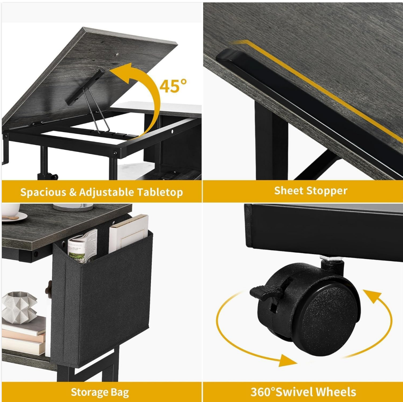
Figure 4.3: Key features including tilting tabletop, sheet stopper, storage bag, and swivel wheels.

Your browser does not support the video tag.