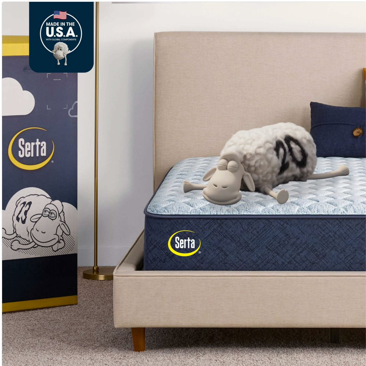
Image: The Serta Sleeptrue Firm 11-inch Twin Hybrid Mattress, ready for use.