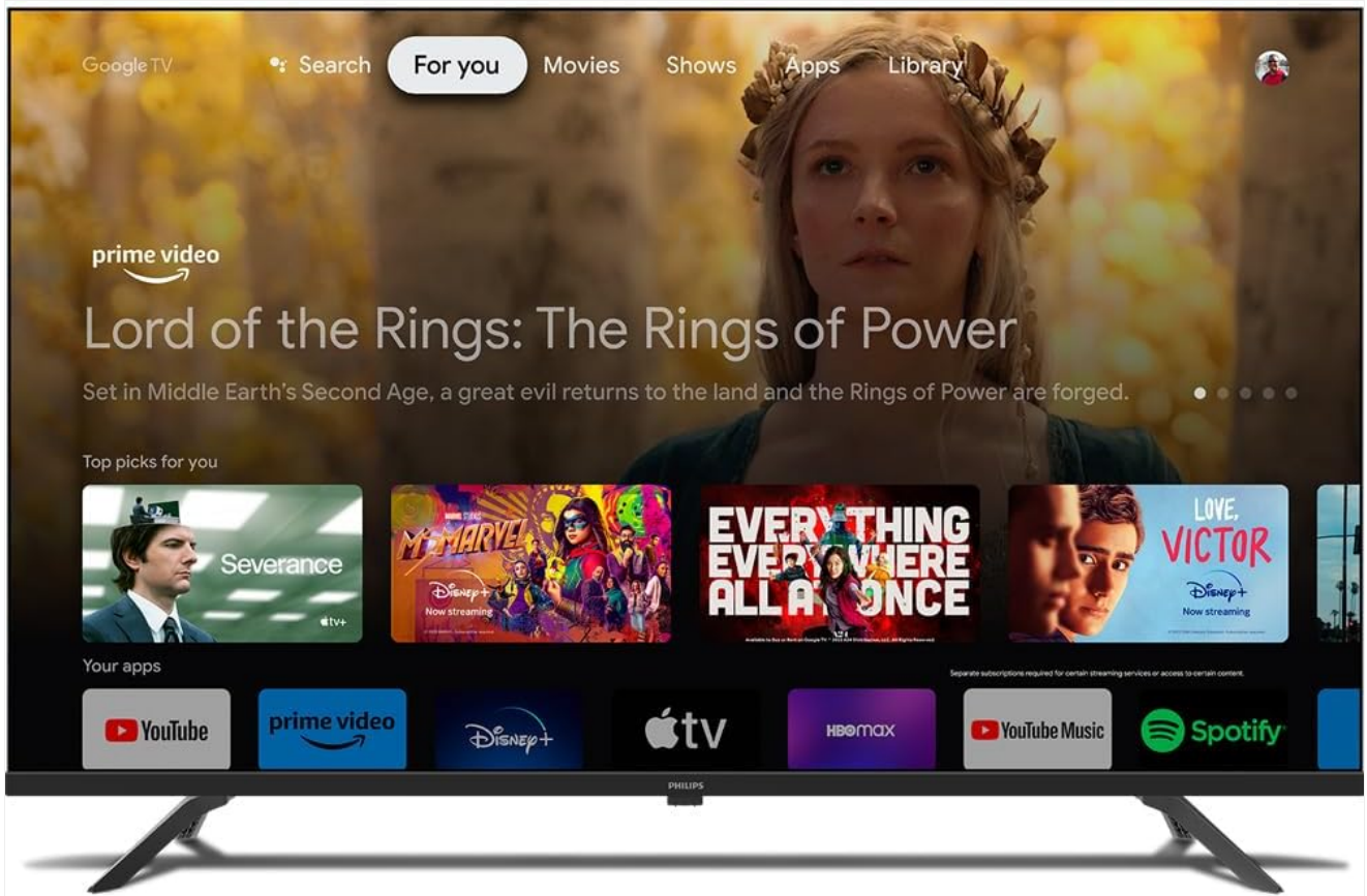
Image: The Google TV home screen on the PHILIPS Smart TV, displaying various content recommendations and installed applications.