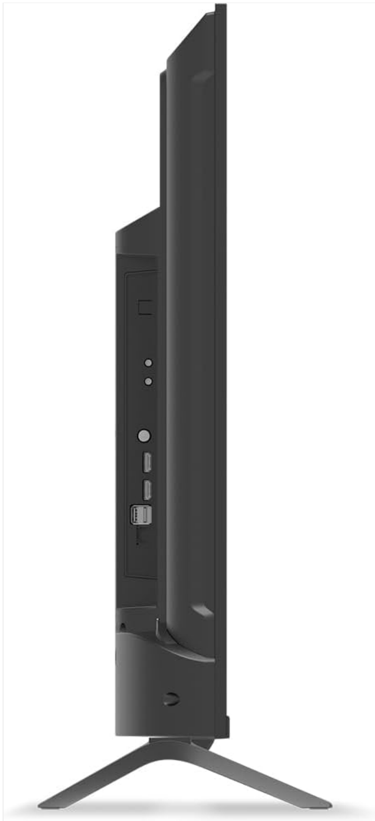
Image: Side profile of the PHILIPS Smart TV, illustrating the accessible connectivity ports including HDMI and USB.