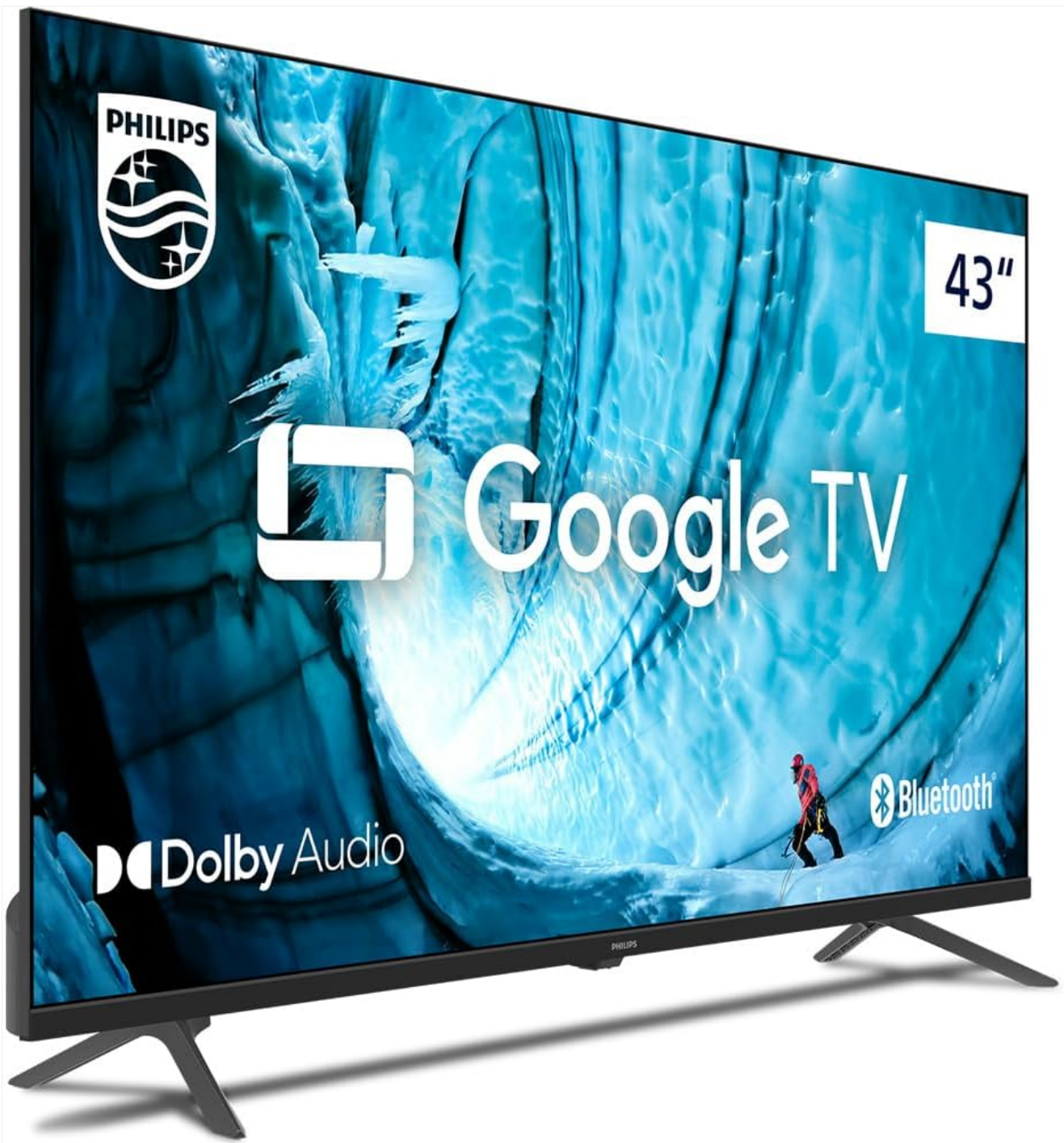
Image: Angled view of the PHILIPS Smart TV with its two-pronged stand attached, ready for tabletop placement.