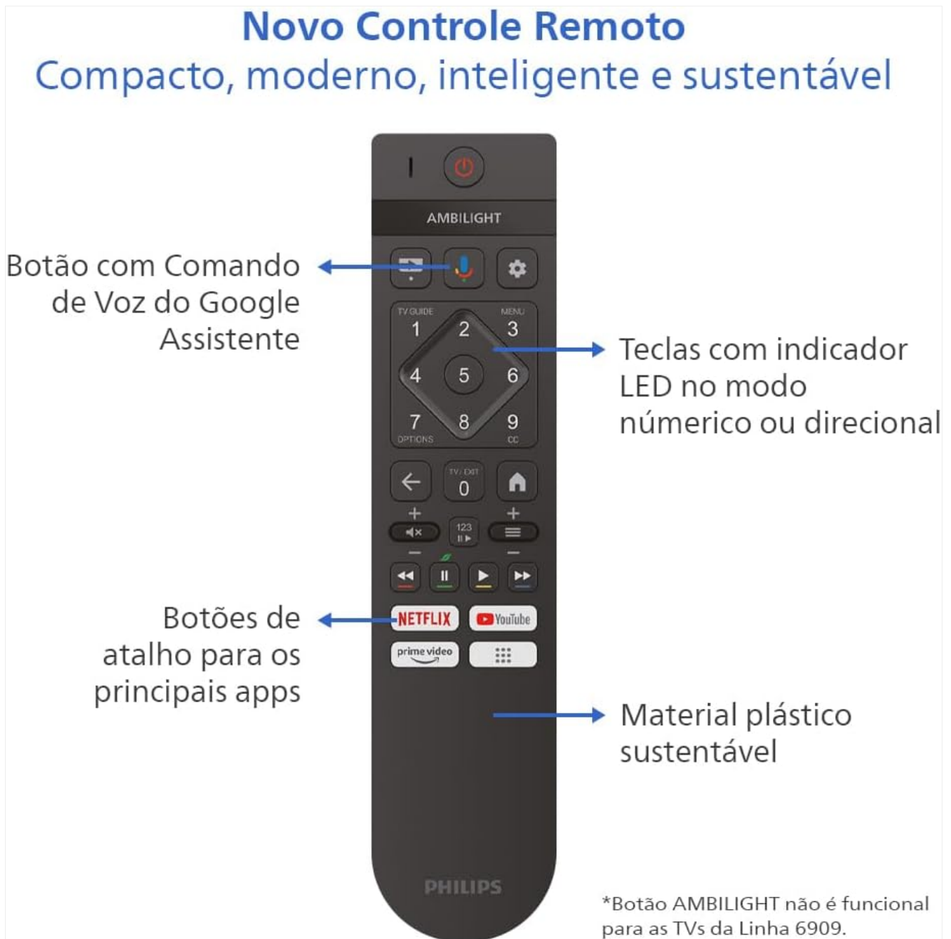
Image: The PHILIPS remote control, highlighting the Google Assistant voice command button and dedicated shortcut buttons for streaming services.

The included remote control is compact and designed for intuitive navigation. It features a dedicated button for Google Assistant voice control and quick access buttons for popular streaming apps like Netflix and YouTube.