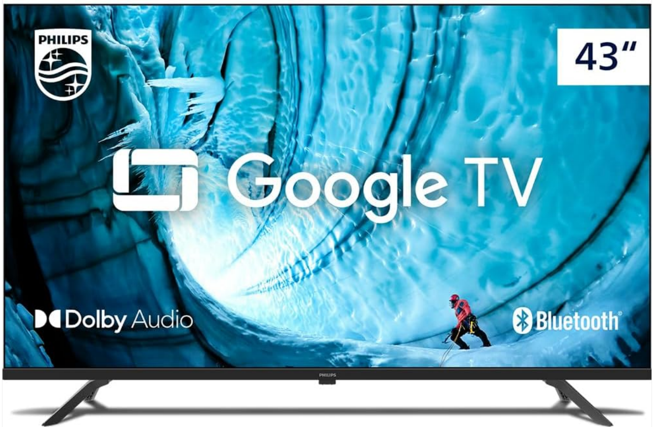
Image: Front view of the PHILIPS 43PFG6909/78 Smart TV, showcasing its slim bezels and the Google TV interface.