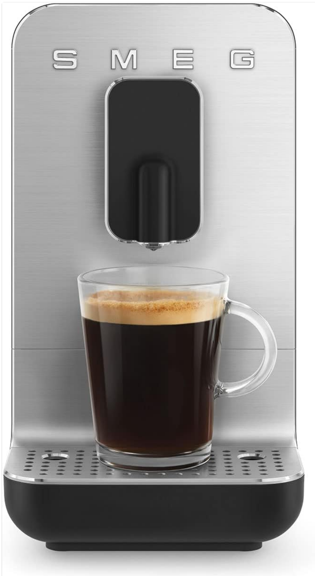
Figure 5: The Smeg BCC11BLMUS espresso machine actively dispensing a long coffee into a clear glass mug. The illuminated coffee dispenser ensures visibility during the brewing process.