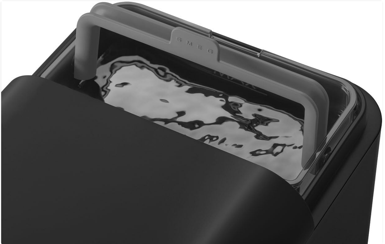
Figure 2: The removable water tank of the Smeg BCC11BLMUS espresso machine, shown with water being added. The tank is located at the rear of the unit and features a handle for easy removal and refilling.