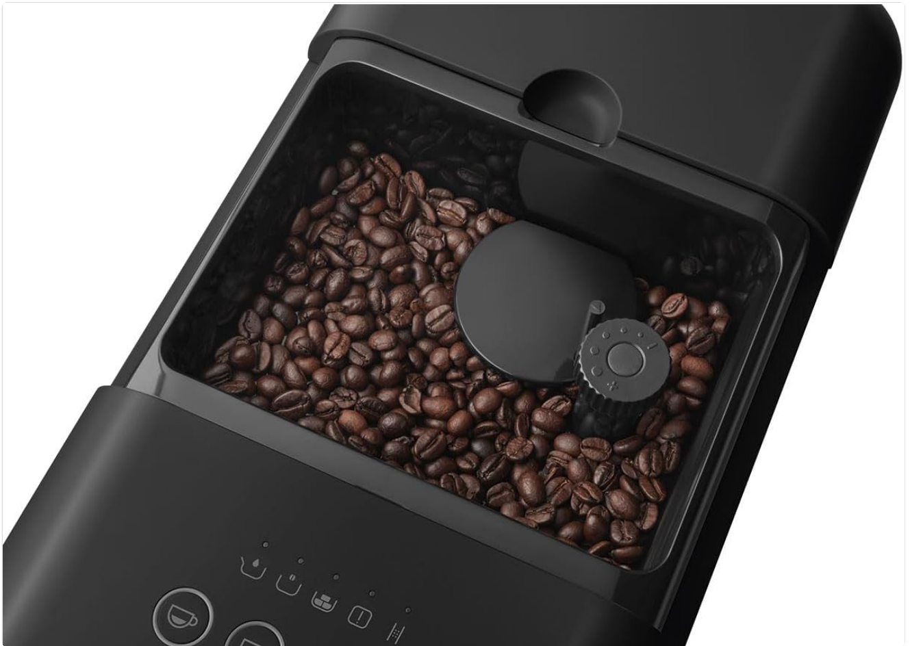
Figure 3: A close-up view of the bean hopper on the Smeg BCC11BLMUS espresso machine, filled with whole coffee beans. The integrated grinder is visible, ready to process beans for brewing.