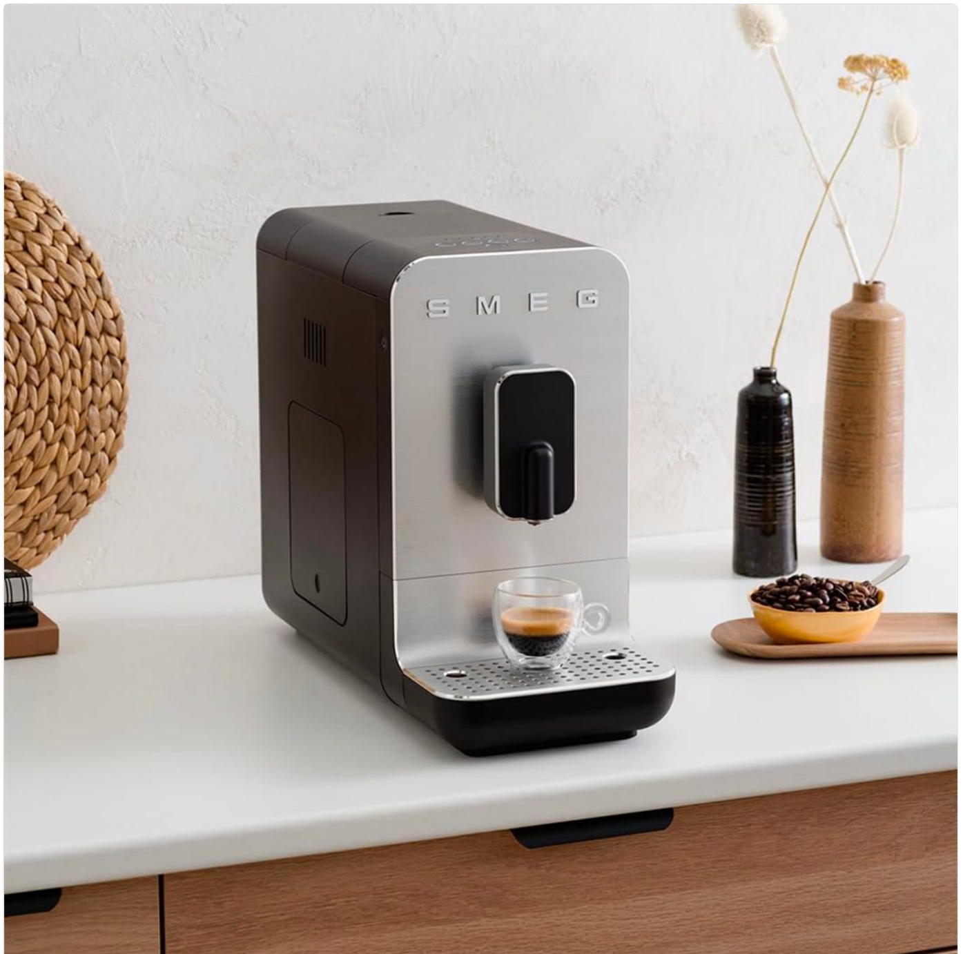
Figure 1: The Smeg BCC11BLMUS Fully Automatic Espresso Machine positioned on a kitchen counter, showcasing its compact design and matte black finish with brushed aluminum accents. An espresso cup is placed on the drip tray, ready for brewing.