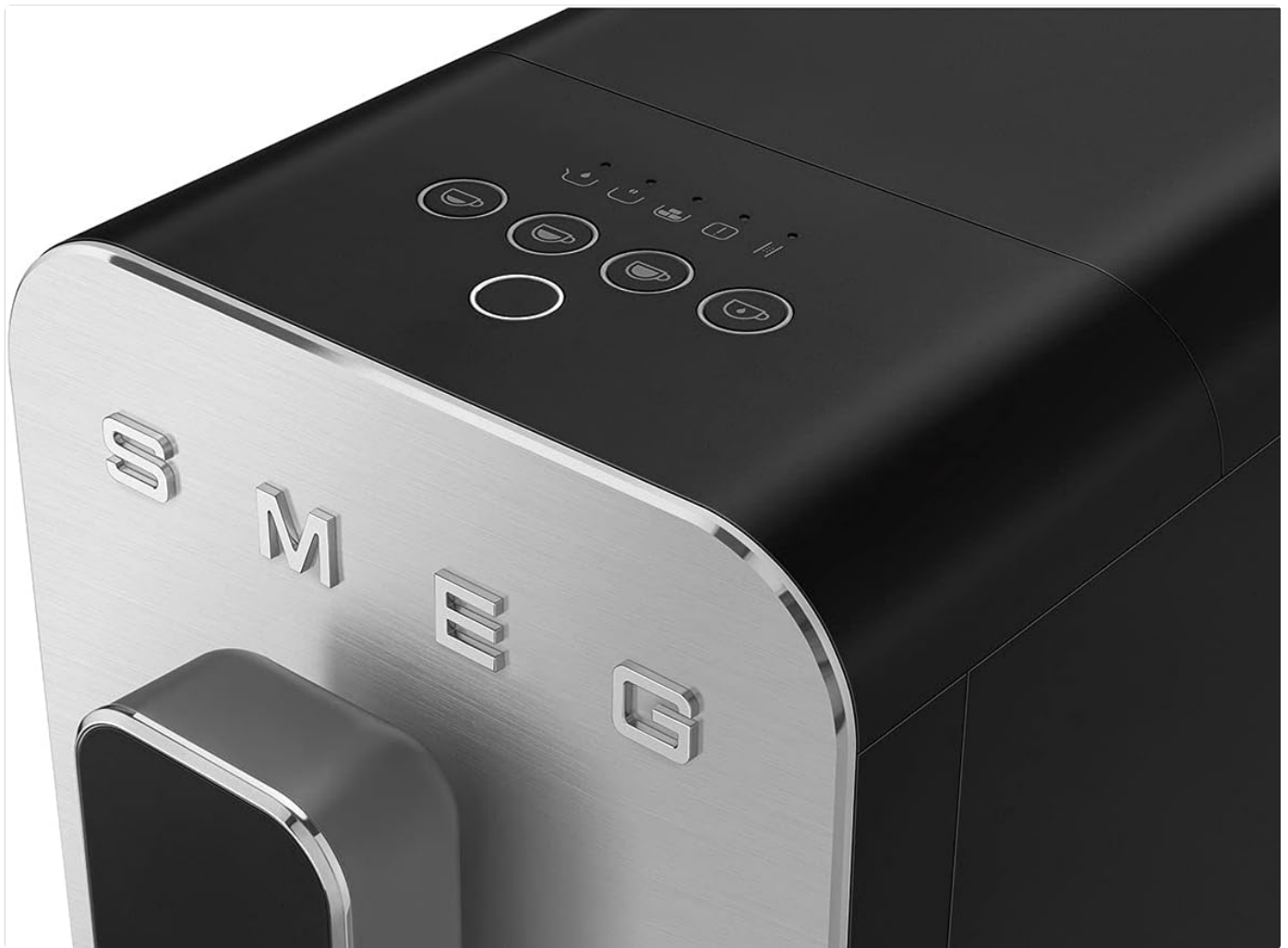
Figure 4: A detailed view of the top-mounted control panel on the Smeg BCC11BLMUS espresso machine. The LED-lit buttons indicate various beverage options and machine status.

The machine features an intuitive LED-lit push-button interface. Buttons illuminate white for standard selections and orange for alternative options.