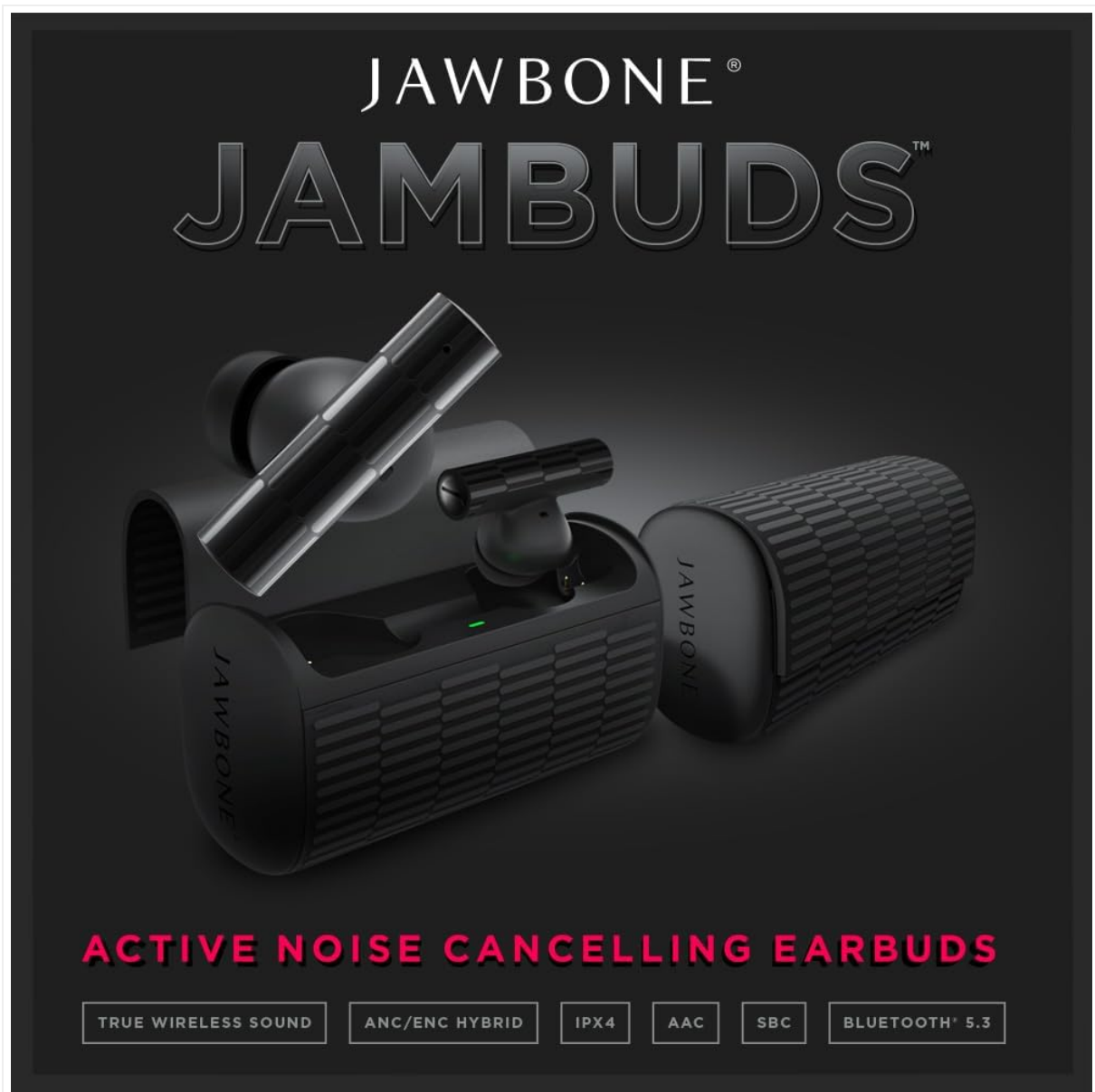
Image 4.1: The earbuds are designed for a comfortable fit, delivering clear audio with active noise cancellation.