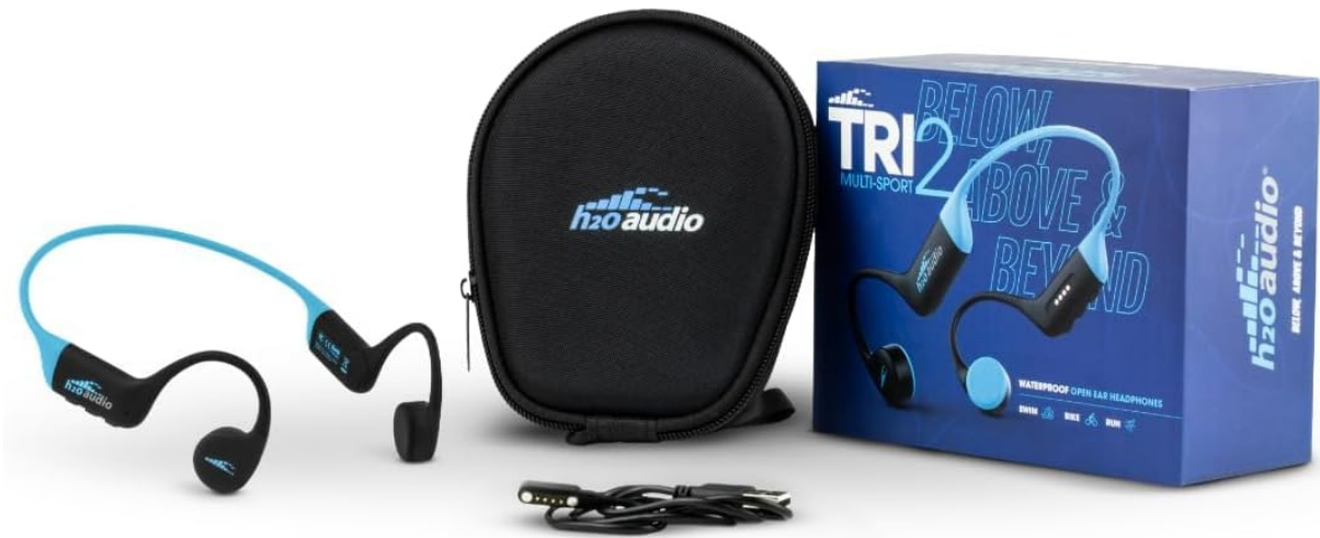
Image: The H2O Audio TRI 2 headphones, protective case, and charging cable as they appear when unboxed.

Video: An unboxing demonstration of the H2O Audio TRI 2 headphones, showing all included accessories and how they are packaged.