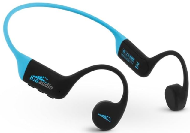
Image: The H2O Audio TRI 2 headphones accompanied by a summary of their technical specifications.