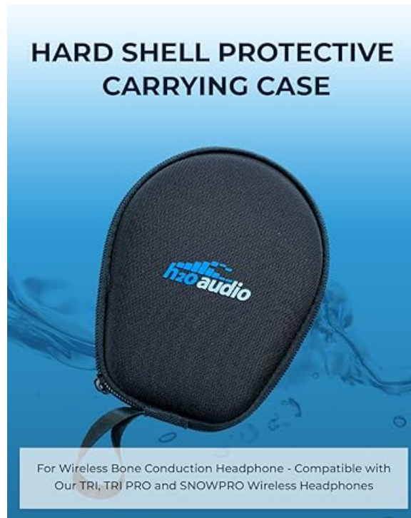
Image: The H2O Audio TRI 2 headphones neatly stored inside their protective carrying case.

Store the headphones in their protective hard shell case when not in use to prevent damage from impacts or scratches. Store in a cool, dry place away from direct sunlight and extreme temperatures.