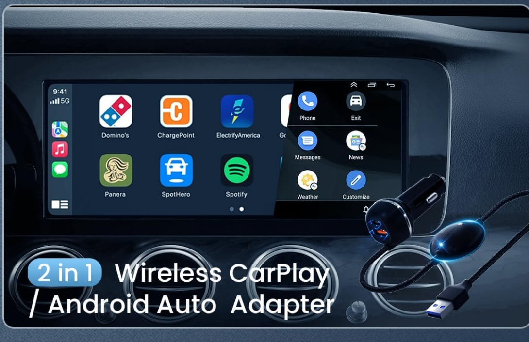
Image: The CODONOVA CA3 device, showcasing its compact design and integrated car charger, wireless CarPlay, and Android Auto functionalities.