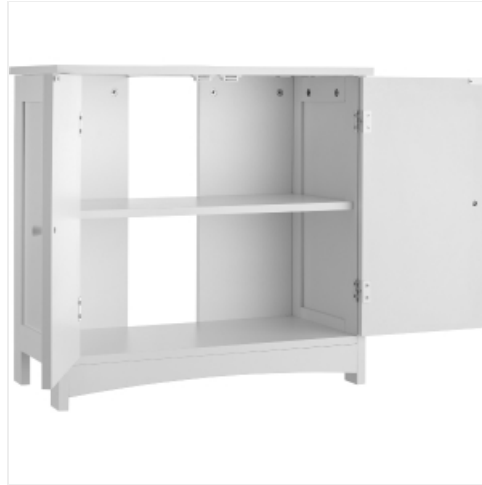
Figure 4.1: Interior view with shelf. This image shows the cabinet interior with the sturdy intermediate shelf installed, dividing the space into two compartments.