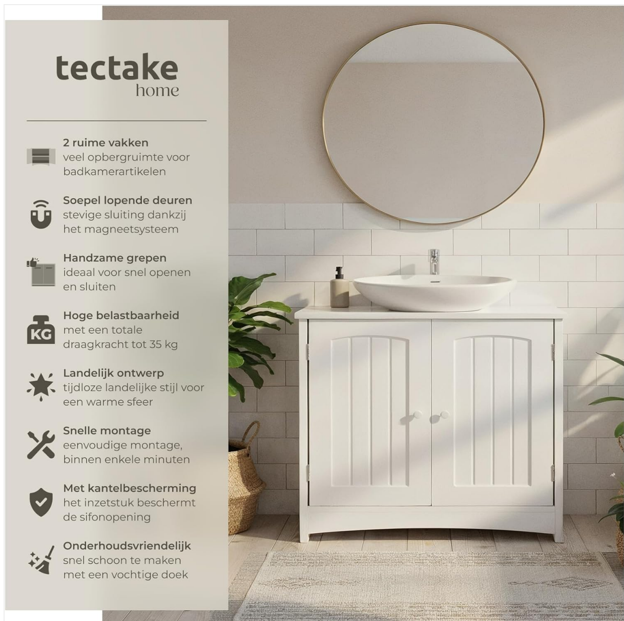
Figure 4.4: Fully assembled cabinet. This image shows the tectake bathroom cabinet fully assembled, ready for use under a sink.

10. Final Check: Ensure all screws are tightened and the cabinet is stable.