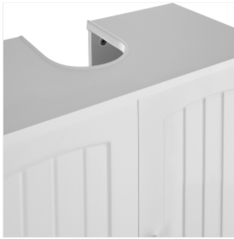
Figure 4.3: Siphon cutout protection. This image highlights the durable plastic edge protection around the siphon cutout, designed to prevent moisture damage to the cabinet.

10. Final Check: Ensure all screws are tightened and the cabinet is stable.