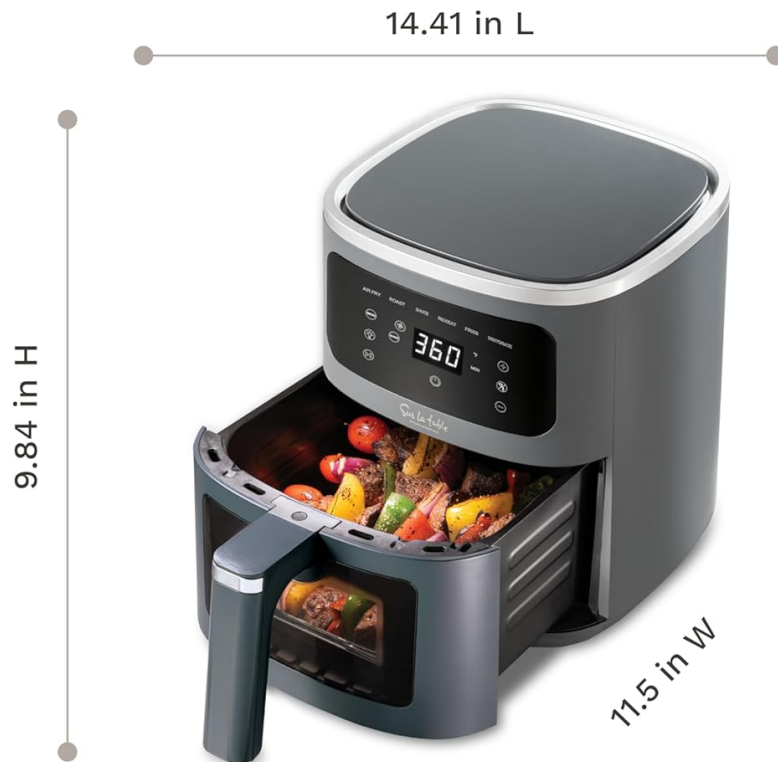
Image: Product dimensions for space planning.