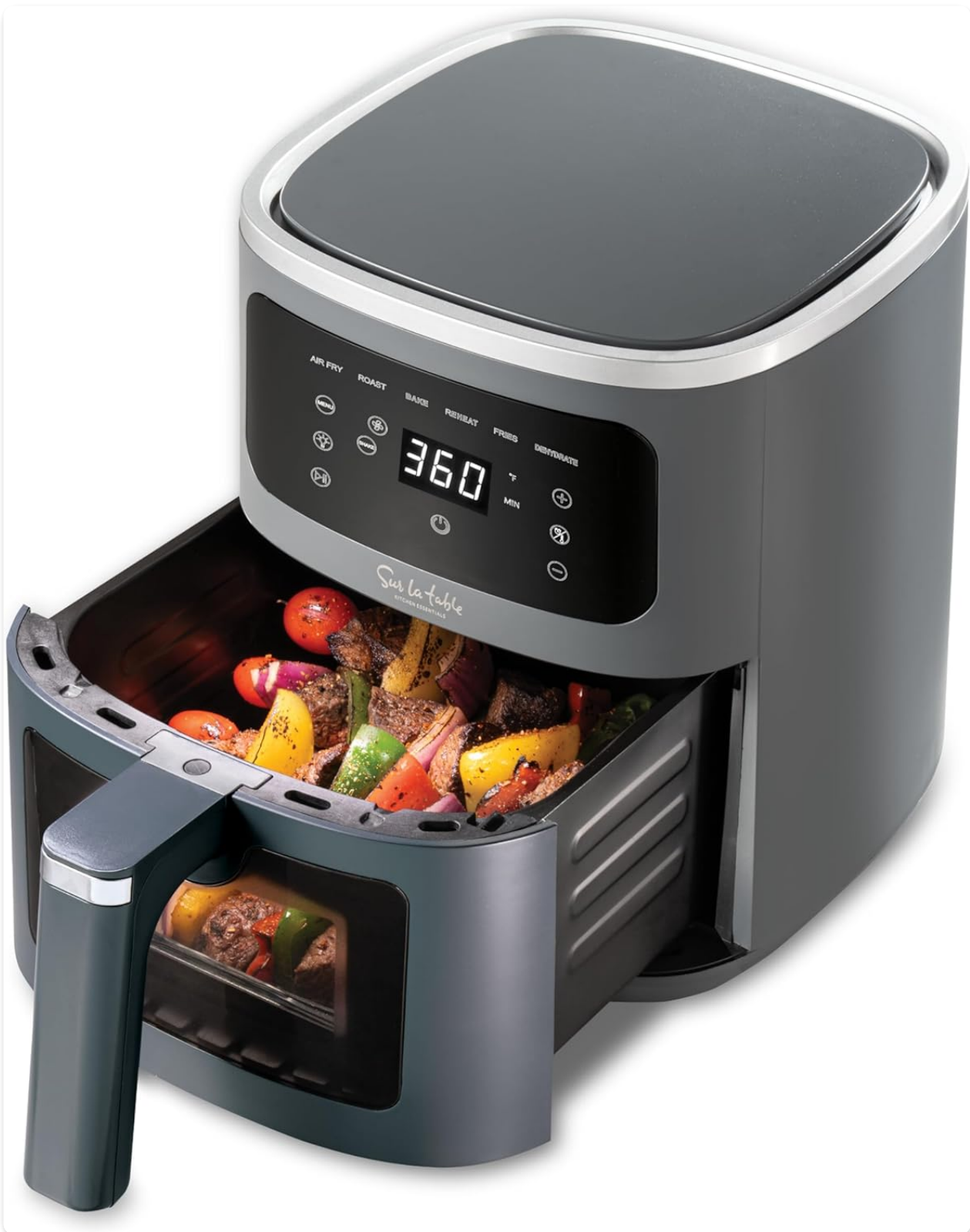
Image: Sur La Table 4.2 Quart Air Fryer in use, showcasing its compact design and capacity for various ingredients.