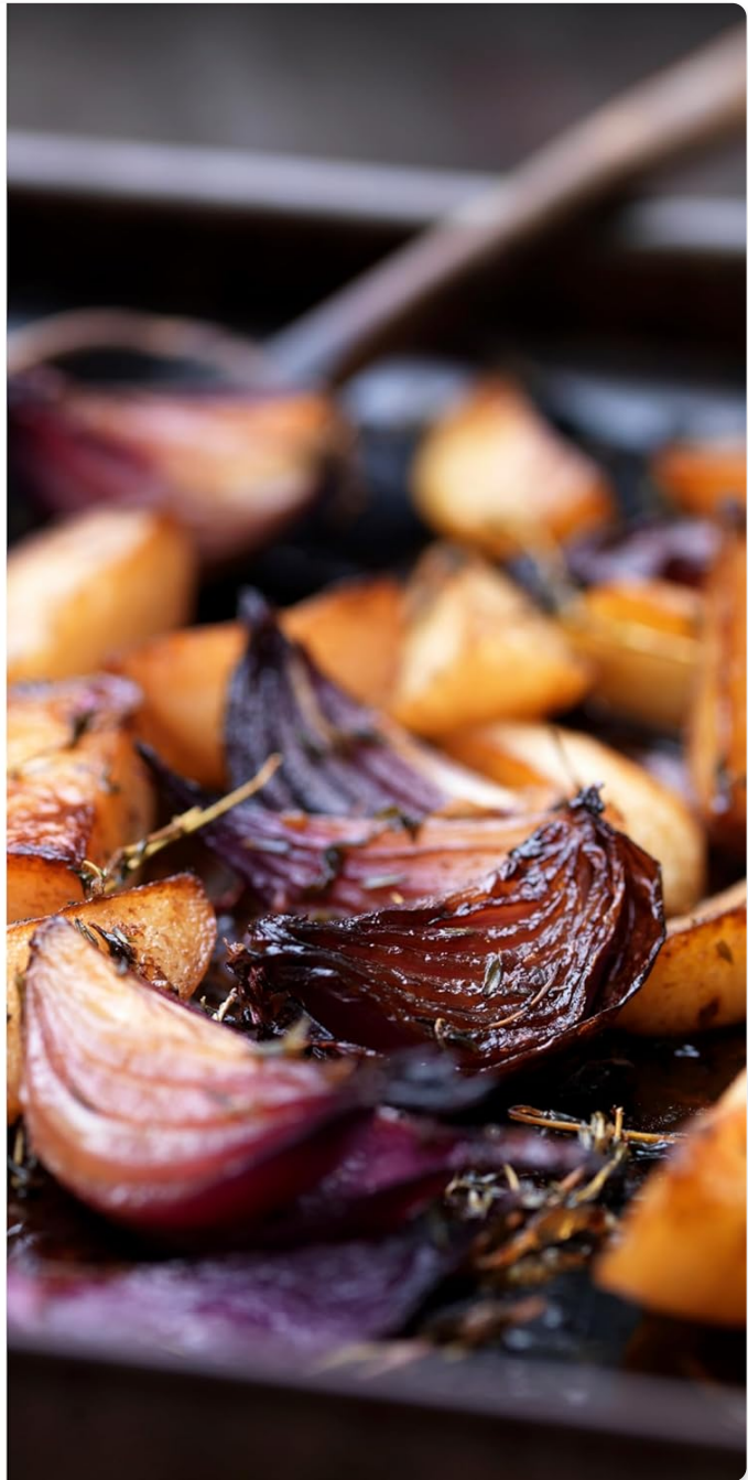
Image: Six versatile cooking presets.