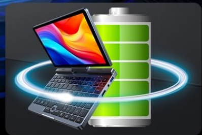
3200mAh Battery With 4-6 Hours

Image: A visual representation of the Intel 12th Gen Alder Lake N100 processor, detailing its TDP, core/thread count, and Max Turbo Frequency, emphasizing the laptop's internal power.