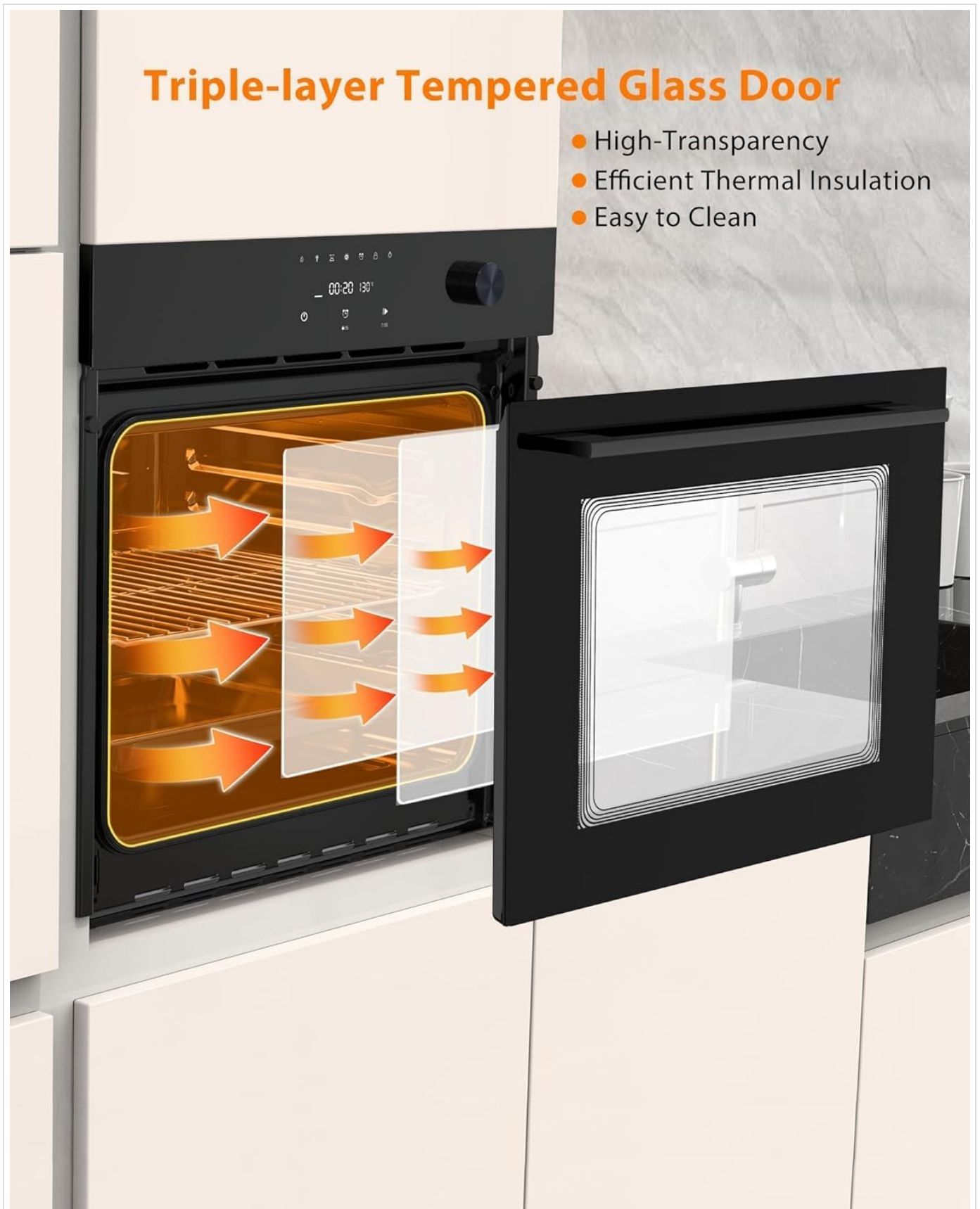
Image 2: Illustration of the oven's triple-layer tempered glass door, showing heat insulation properties.