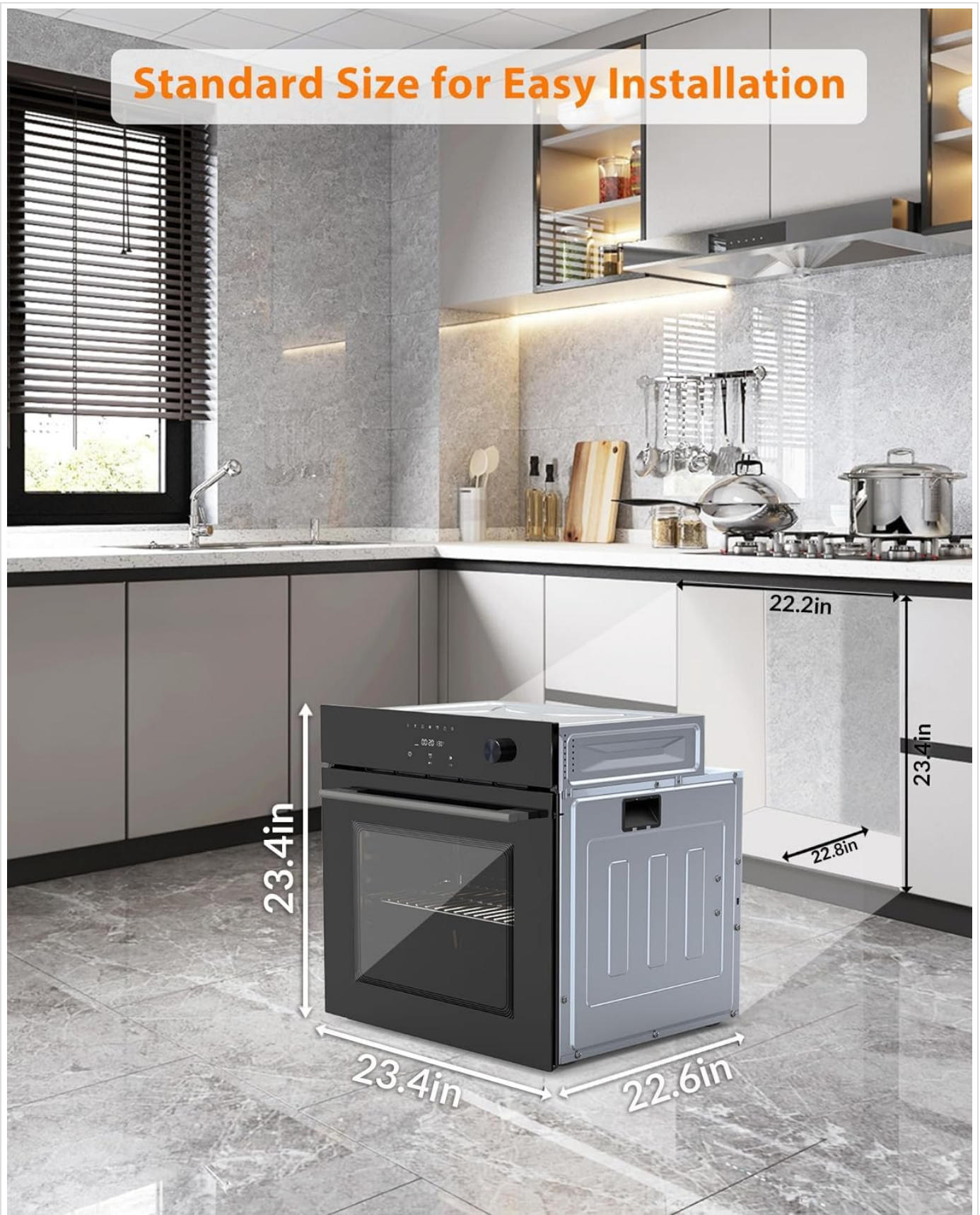
Image 4: Diagram illustrating the standard dimensions for installing the 24-inch built-in electric wall oven, showing height, width, and depth measurements for cabinet integration.