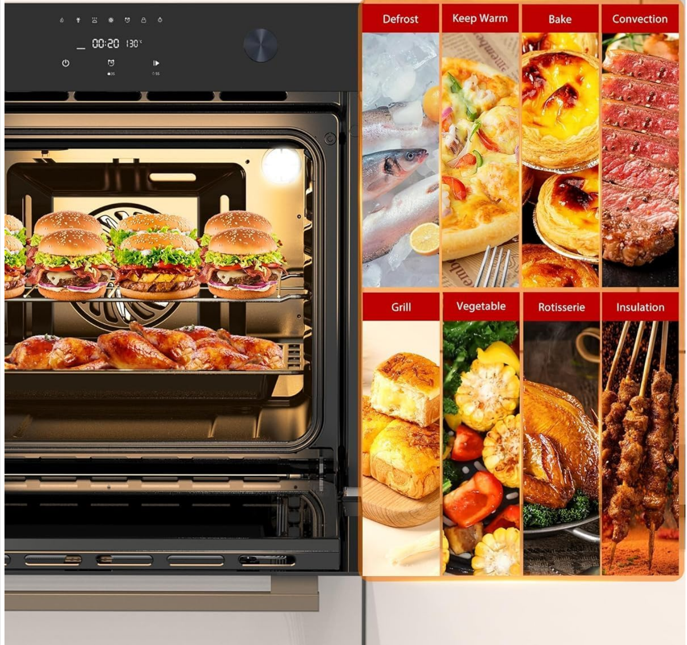
Image 6: Visual representation of the 8 quick automatic cooking functions available on the oven, such as Defrost, Keep Warm, Bake, Convection, Grill, Vegetable, Rotisserie, and Insulation.

The program modes for effortless cooking to meet most daily cooking needs