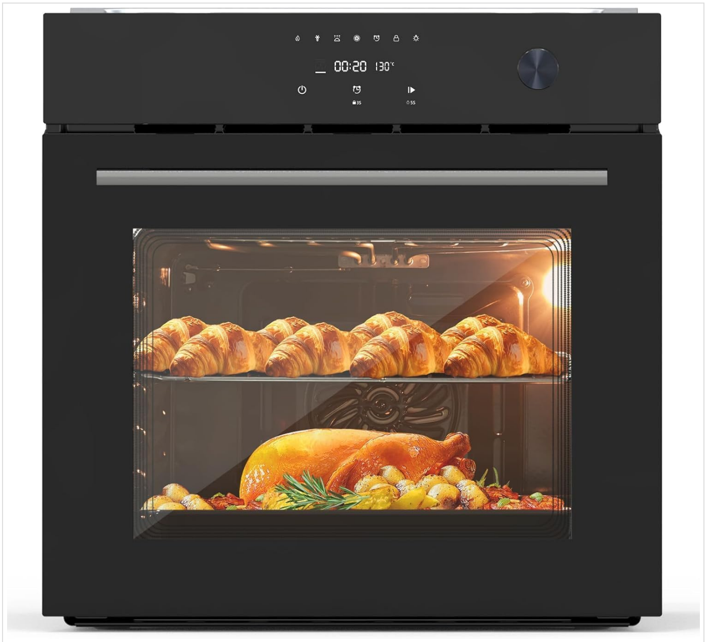
Image 1: Front view of the GarveeHome 24-inch Built-in Electric Convection Wall Oven, showcasing its sleek black finish and illuminated interior with food cooking.