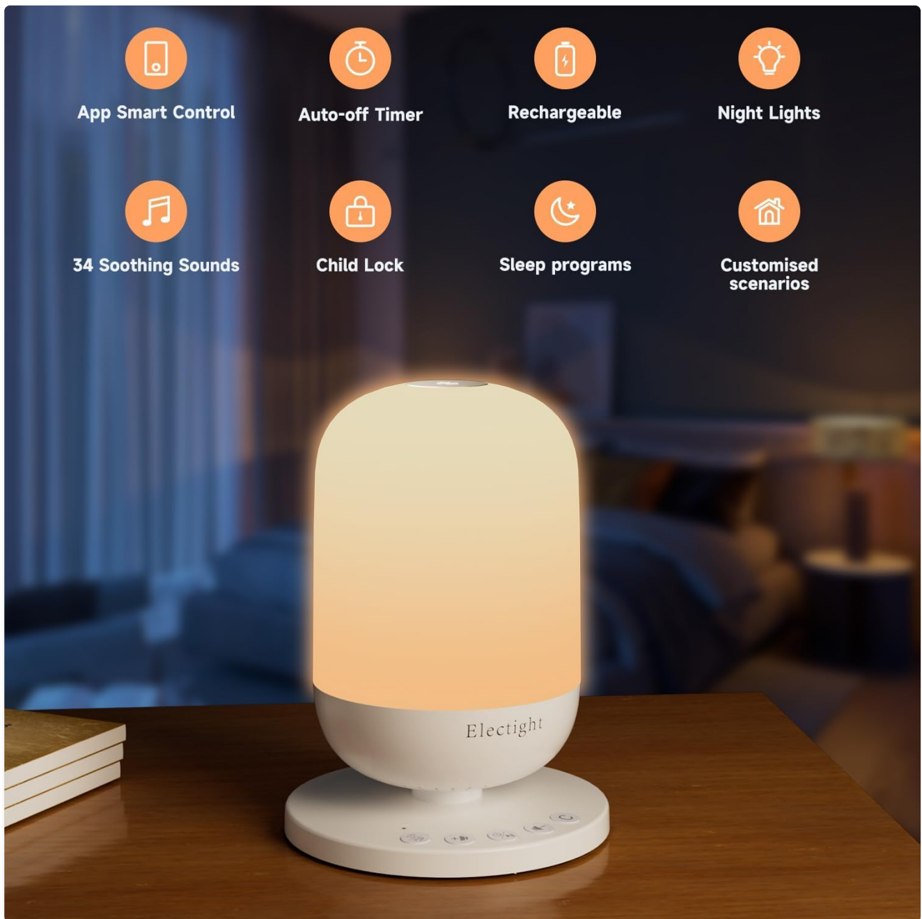
Image: Overview of the Electight White Noise Machine highlighting its key features such as app control, timer, rechargeable battery, night light, 34 sounds, child lock, sleep programs, and customizable scenarios.