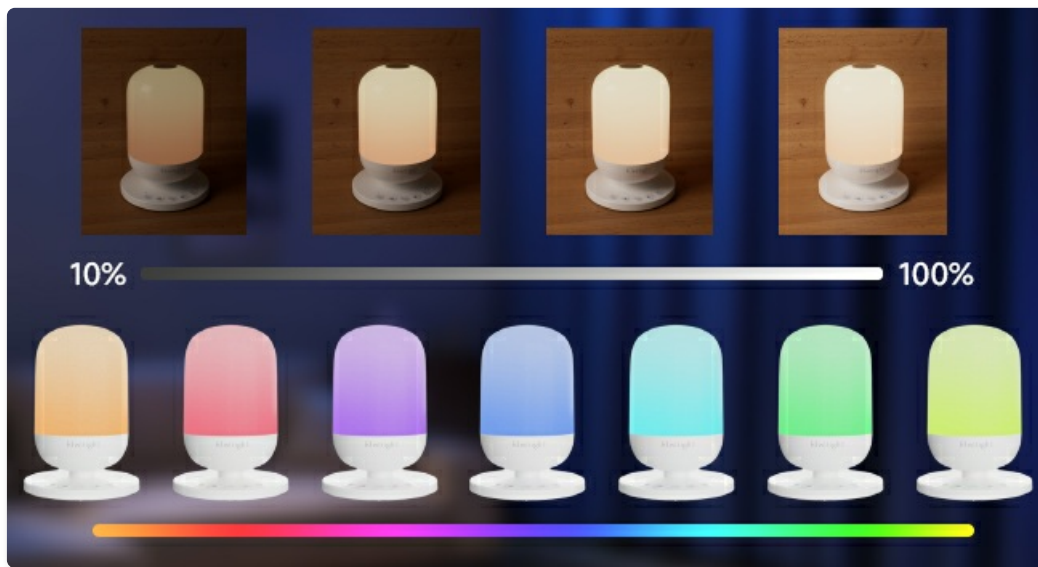
Image: A visual demonstration of the night light's capabilities, showcasing different colors and a brightness scale from 10% to 100%.