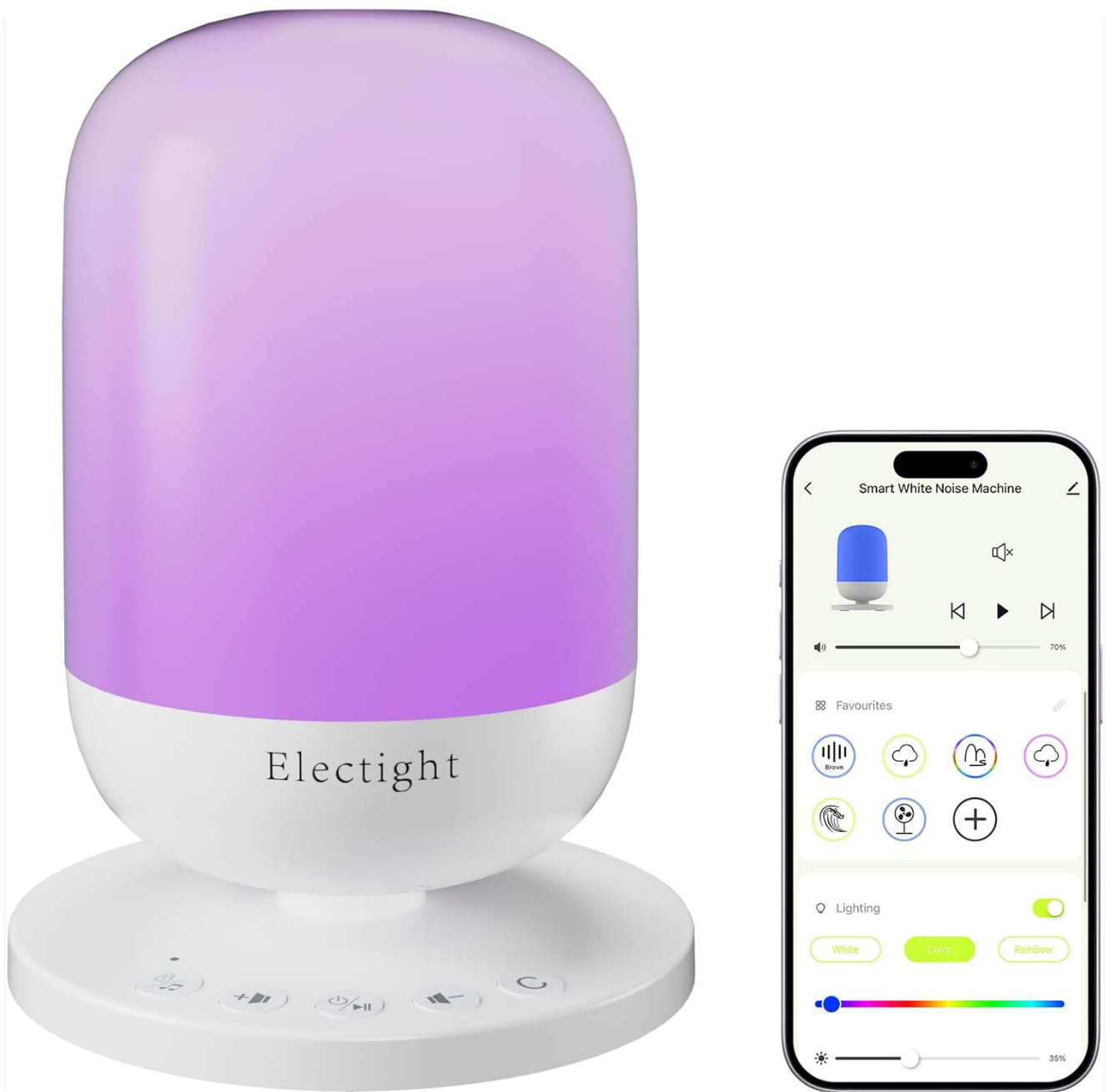
Image: The Electight White Noise Machine shown alongside a smartphone screen displaying the mobile application interface for controlling the device's sounds and lighting.