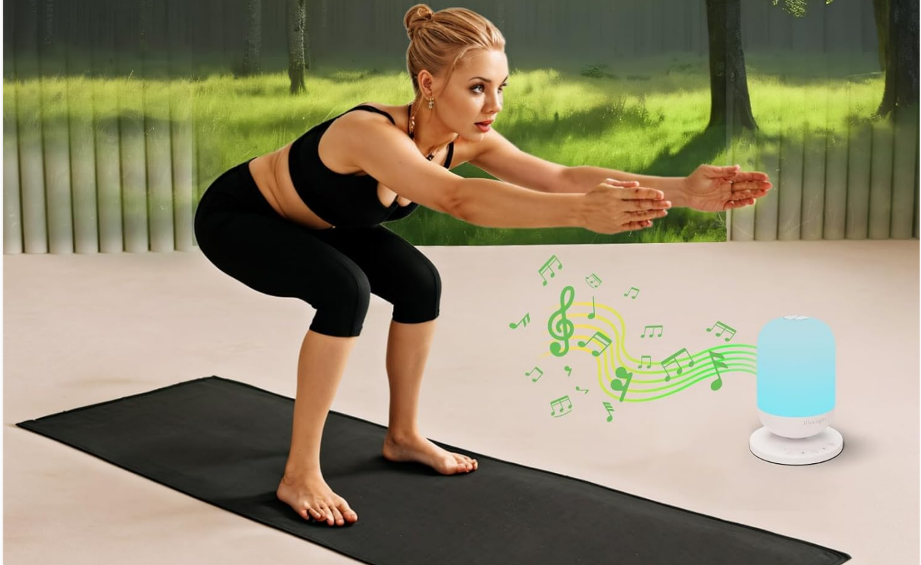
Image: A visual representation of the sound categories available, including white noises, fan sounds, lullabies, and nature sounds, suggesting a high-quality sound experience for a cozy atmosphere.