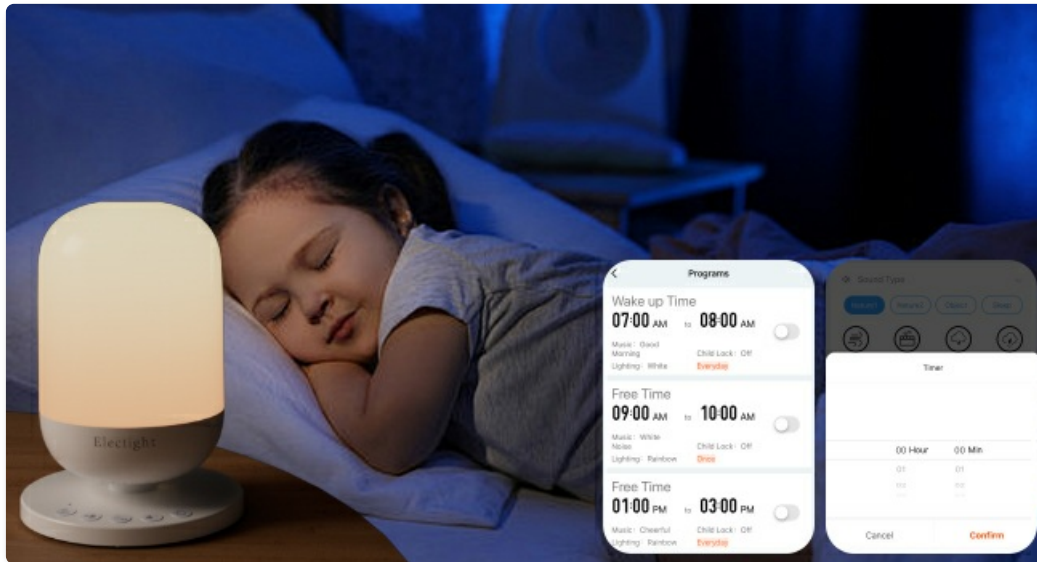
Image: A child sleeping with the white noise machine on a bedside table, illustrating its use for sleep. The image also shows the app interface for setting sleep programs and timers.