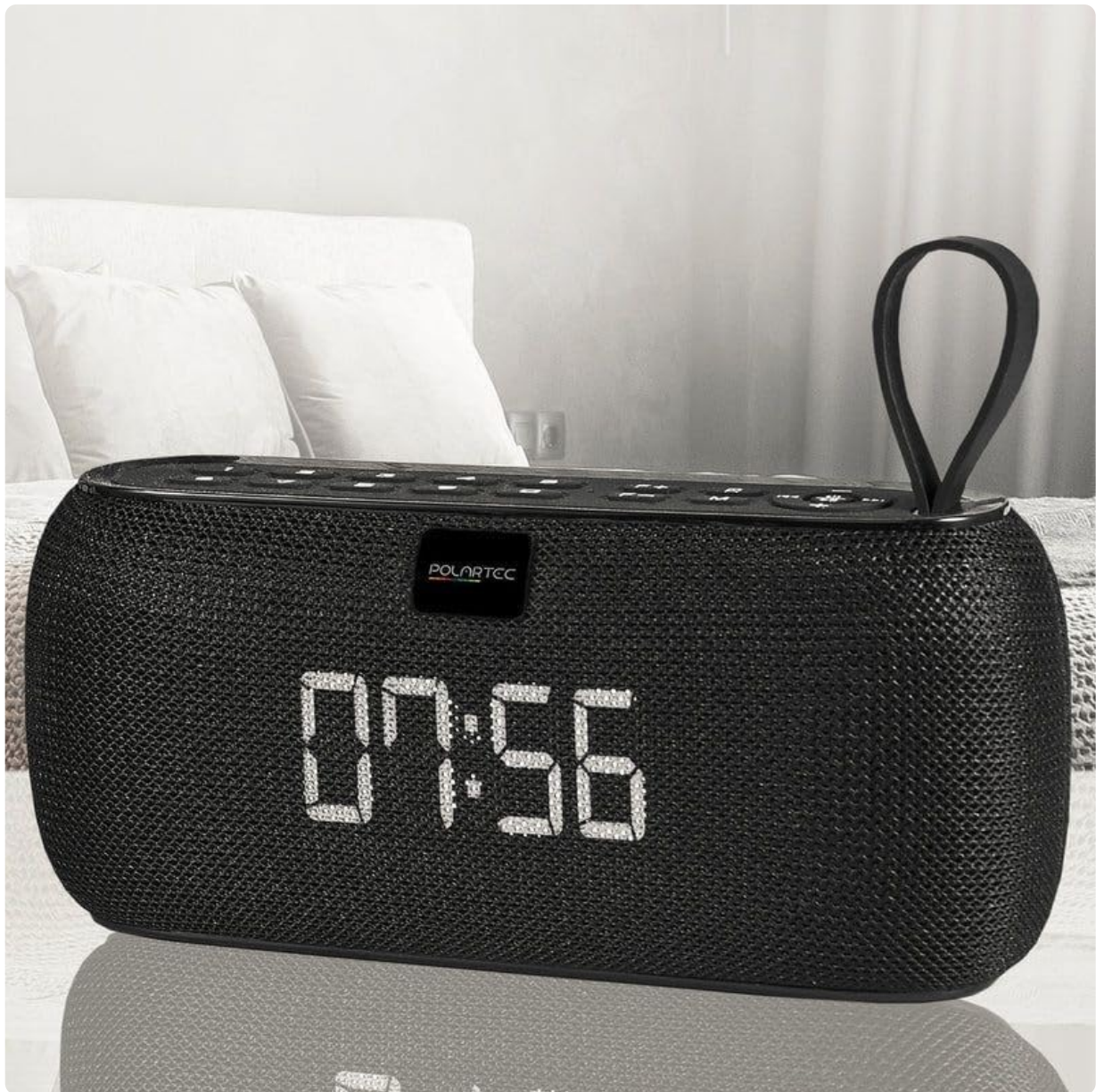
Figure 4.2: The Polartec Alarm Clock Bluetooth Speaker positioned on a bedside table, displaying the time 07:56, indicating its use as an alarm clock.