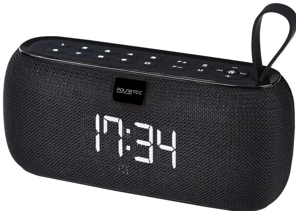
Figure 4.1: Angled view of the Polartec Alarm Clock Bluetooth Speaker, highlighting the top control panel and digital time display.