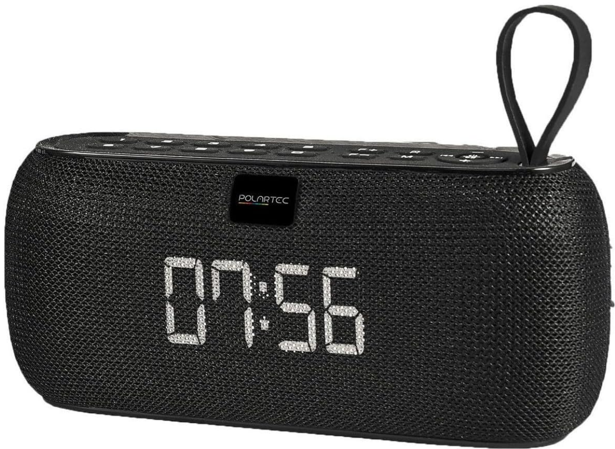
Figure 1.1: Front view of the Polartec Alarm Clock Bluetooth Speaker, displaying the time 07:56.