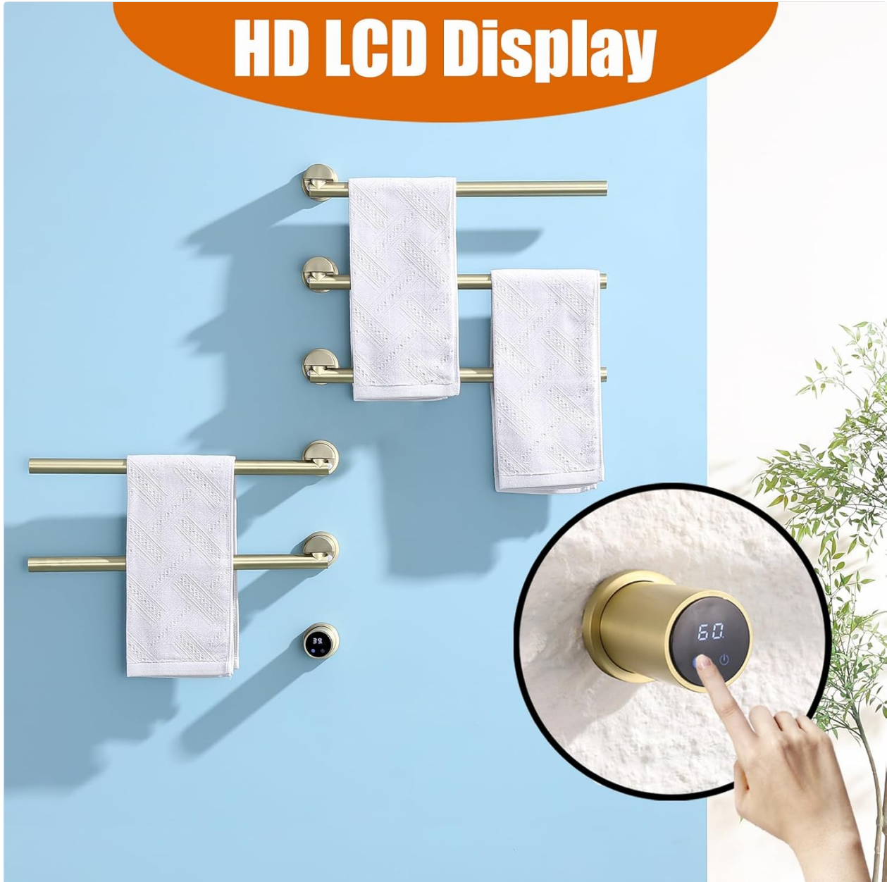
Image: Close-up of the HD LCD display on the towel warmer, showing temperature settings and touch controls.