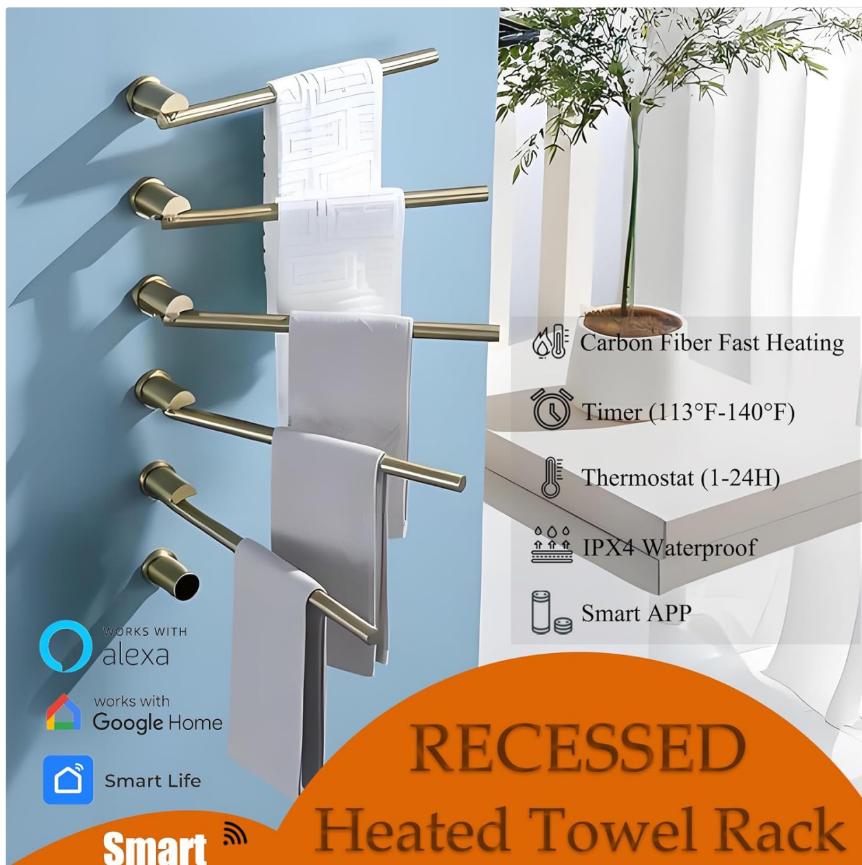
Image: Key features of the QREZAA Heated Towel Rack, including carbon fiber heating, timer, thermostat, IPX4 waterproofing, and smart app control.