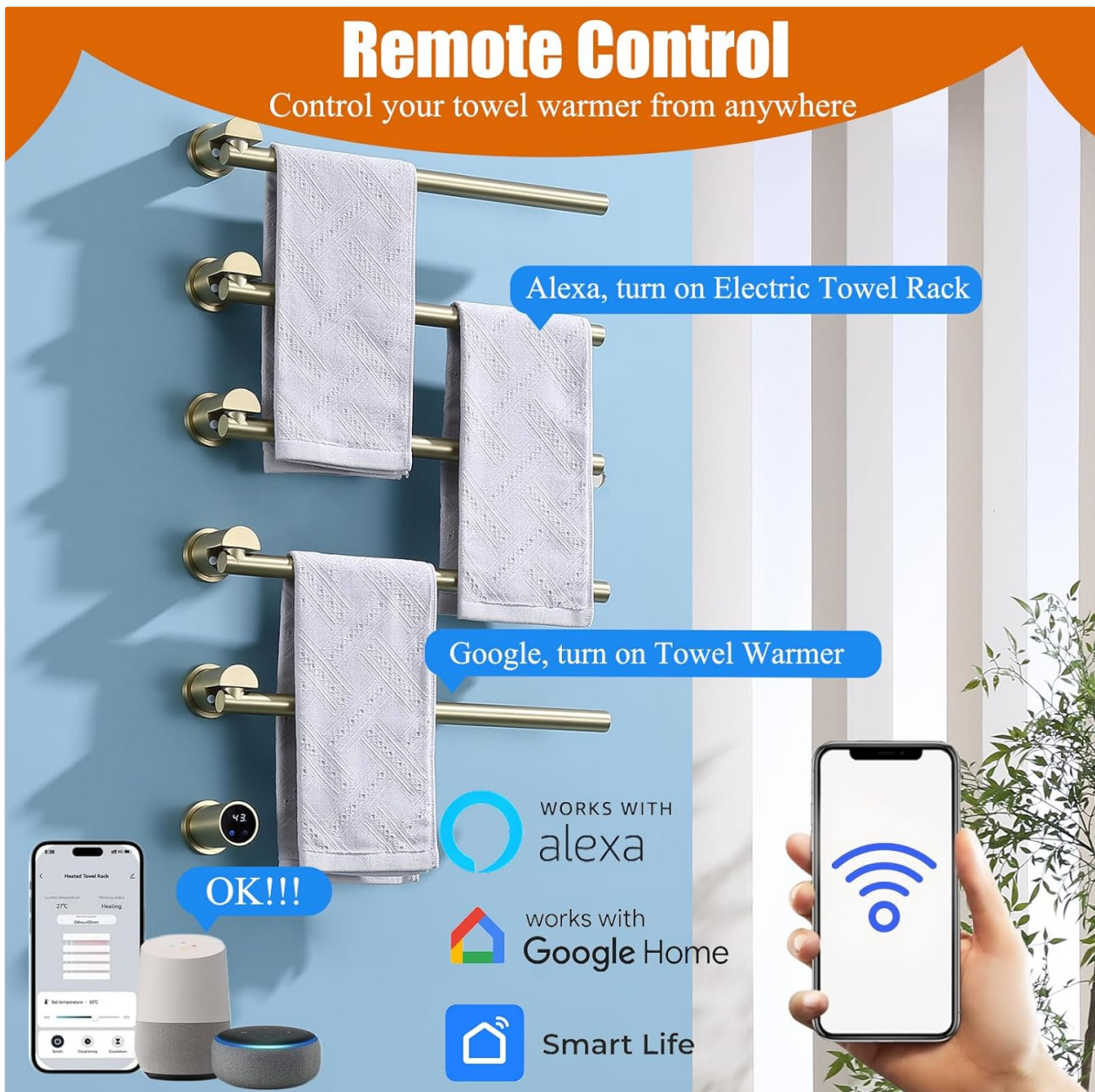
Image: Demonstrates remote control capabilities using a smartphone app, Alexa, and Google Home devices.