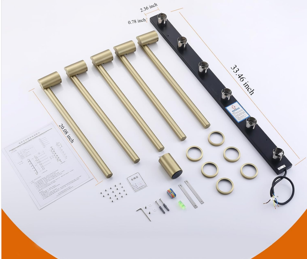
Image: All components included in the QREZAA FK-035 Heated Towel Rack package, laid out on a white surface.