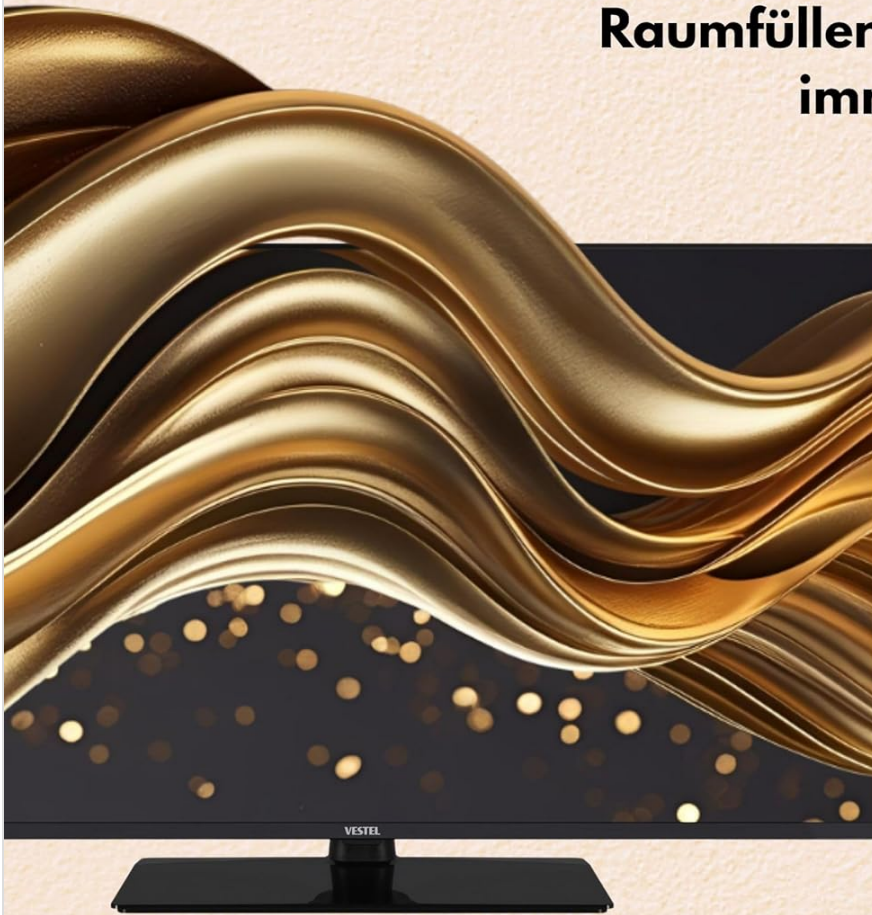
Image: Graphic demonstrating Dolby Atmos technology, promising immersive, room-filling sound.