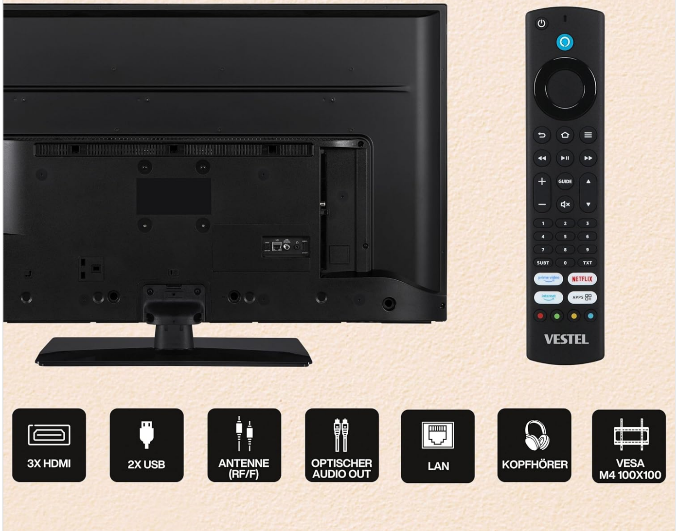
Image: Rear panel of the TV displaying 3 HDMI ports, 2 USB ports, Antenna (RF/F) input, Optical Audio Out, LAN port, and Headphone jack. The remote control is also shown.