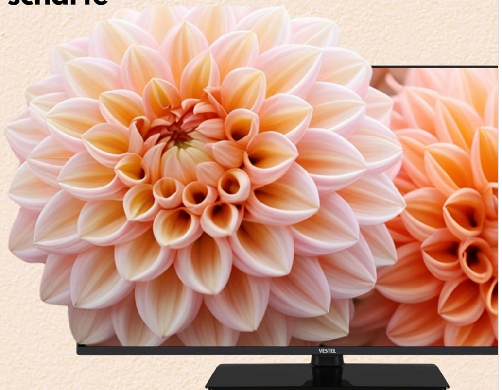
Image: Visual representation of display technologies including Dolby Vision, HDR10, Micro Dimming, and Super Resolution, emphasizing brilliant colors and sharp details.