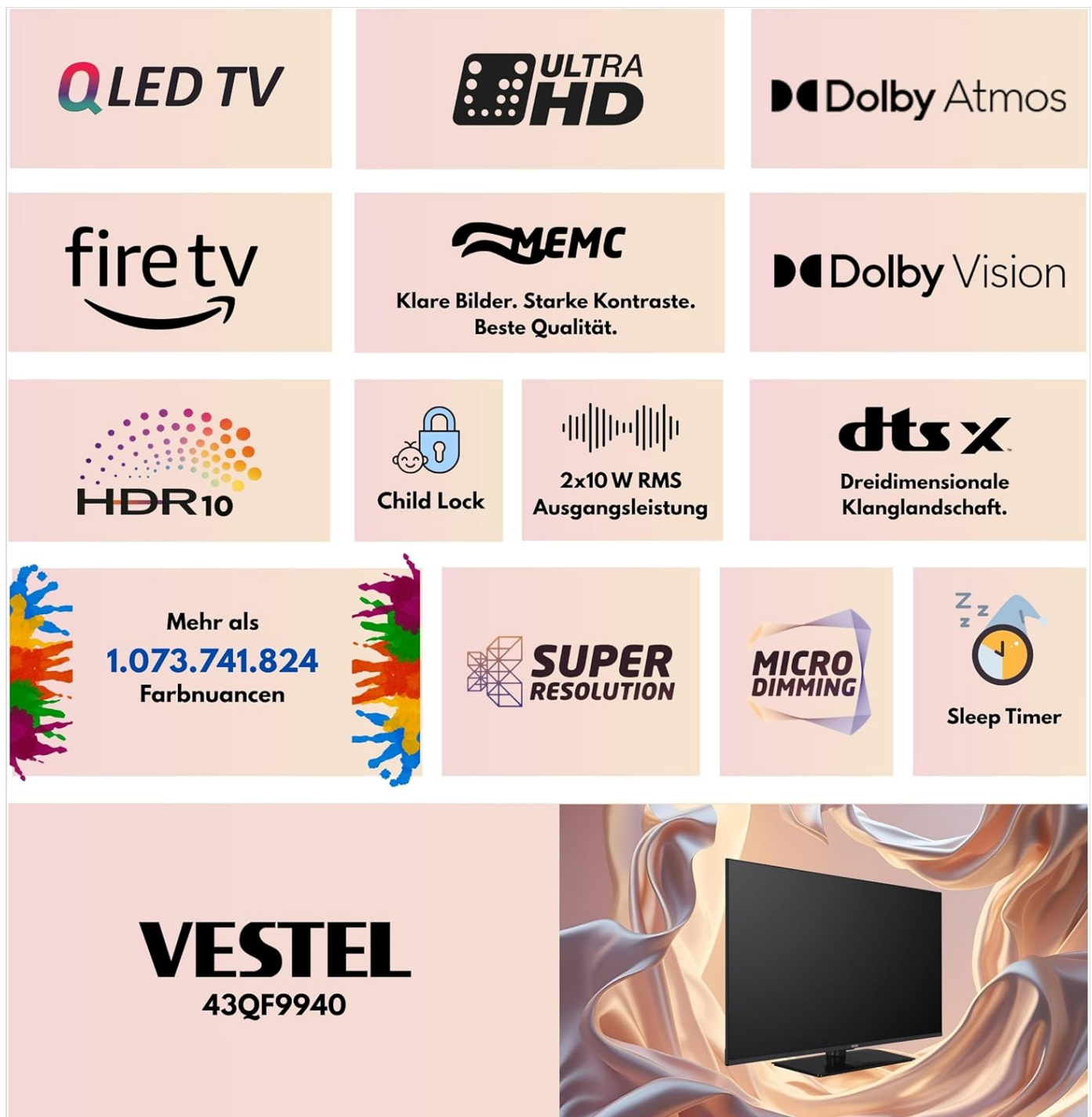
Image: A collage of icons and text highlighting key features such as QLED, Ultra HD, Dolby Atmos, Fire TV, HDR10, DTS X, Micro Dimming, and Super Resolution.