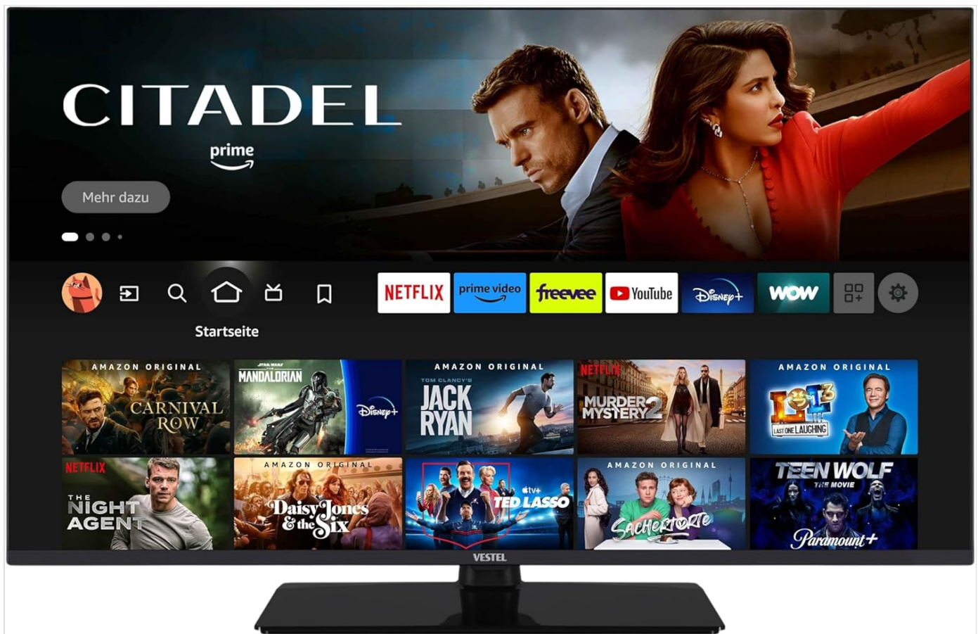
Image: The Vestel QLED 43QF9940 Fire TV showcasing its smart interface with popular streaming services like Prime Video, Netflix, YouTube, and Disney+.