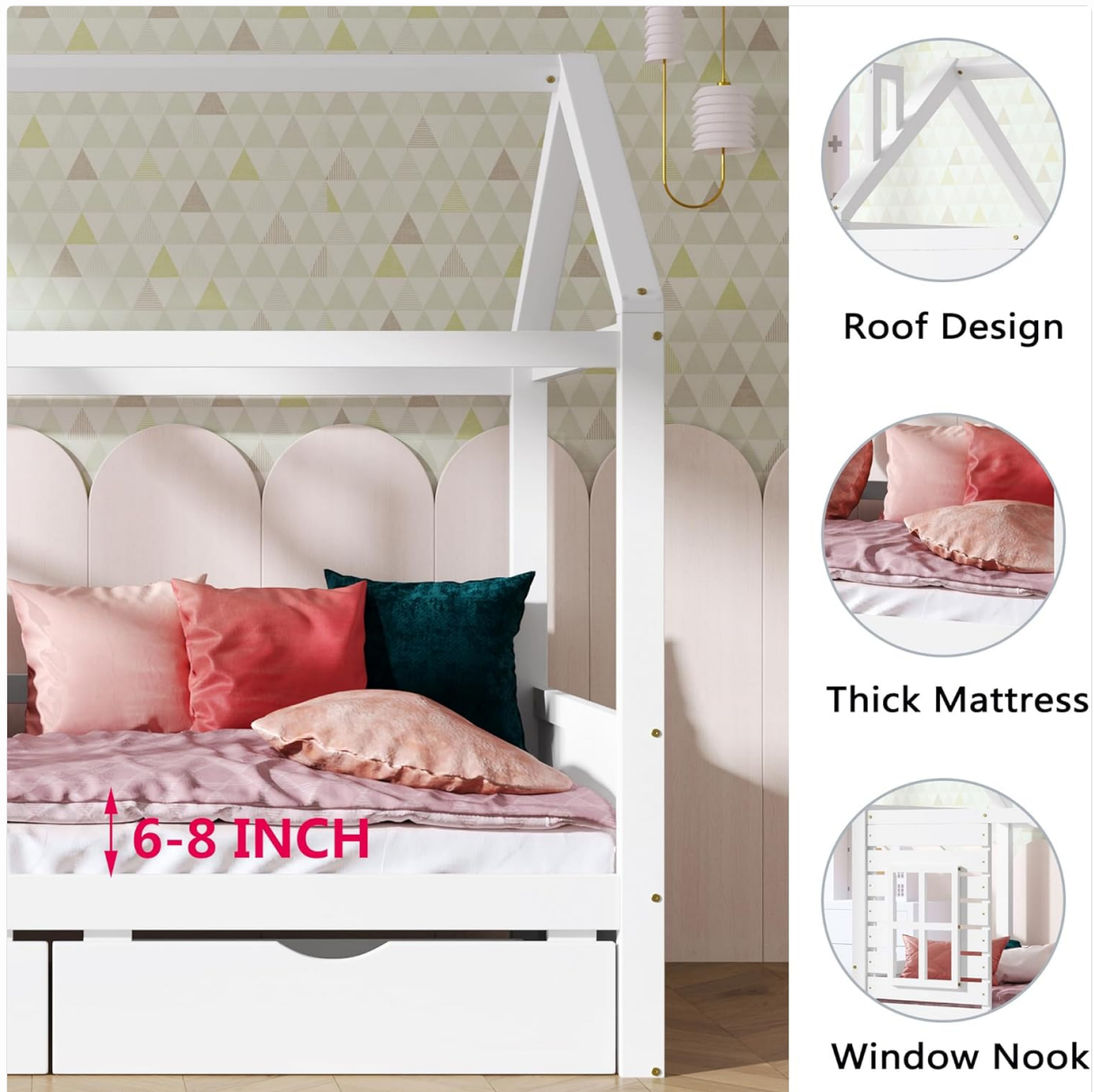
Figure 3: Recommended mattress thickness and design features.