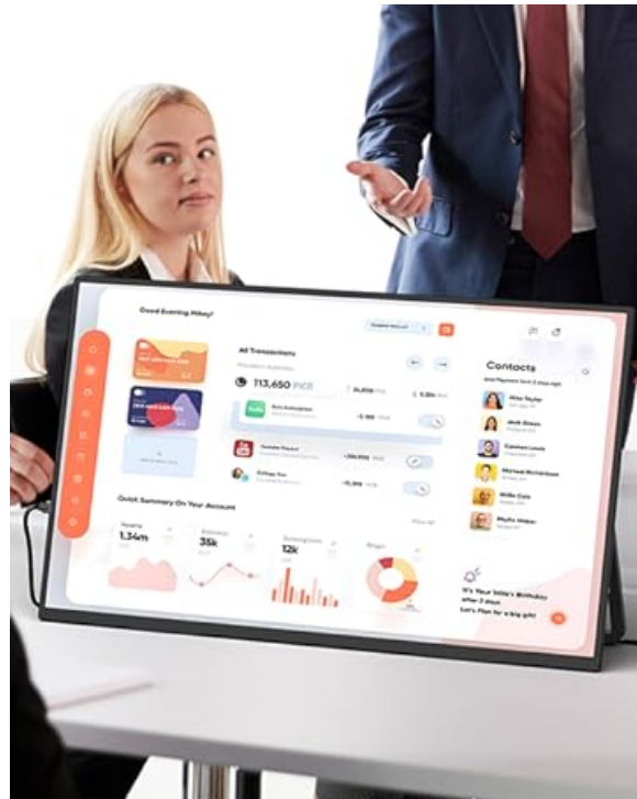
Image: HotYeah's commitment to customer support and warranty.