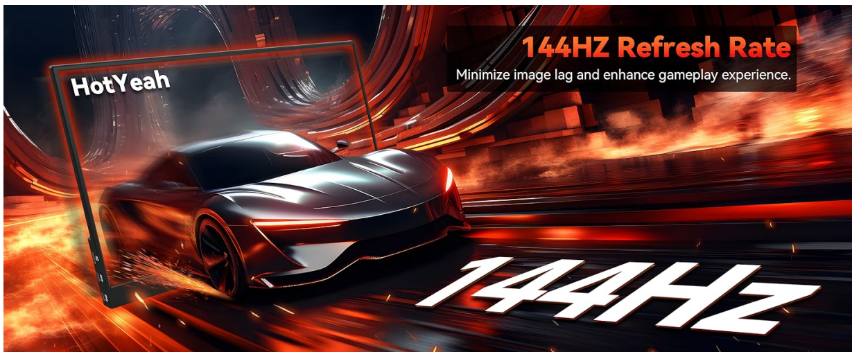
Image: The monitor showcasing its 144Hz refresh rate during a gaming session.