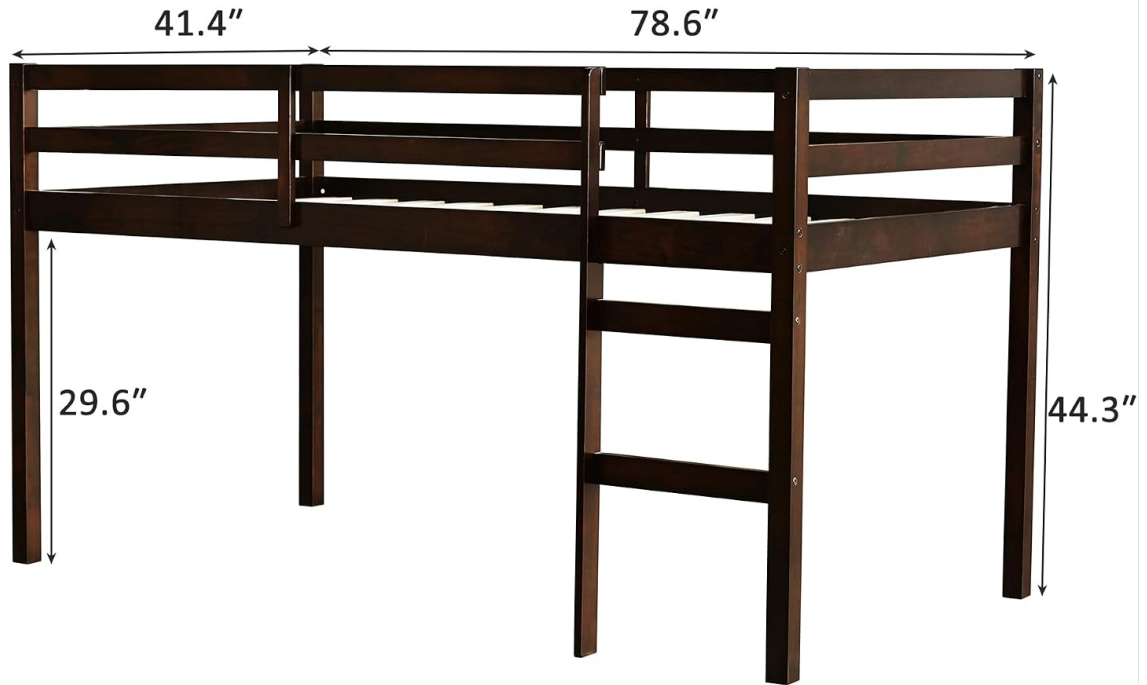
Image: Diagram illustrating the dimensions of the low loft bed: 78.6 inches length, 41.4 inches width, 44.3 inches height, with a clearance of 29.6 inches under the bed.