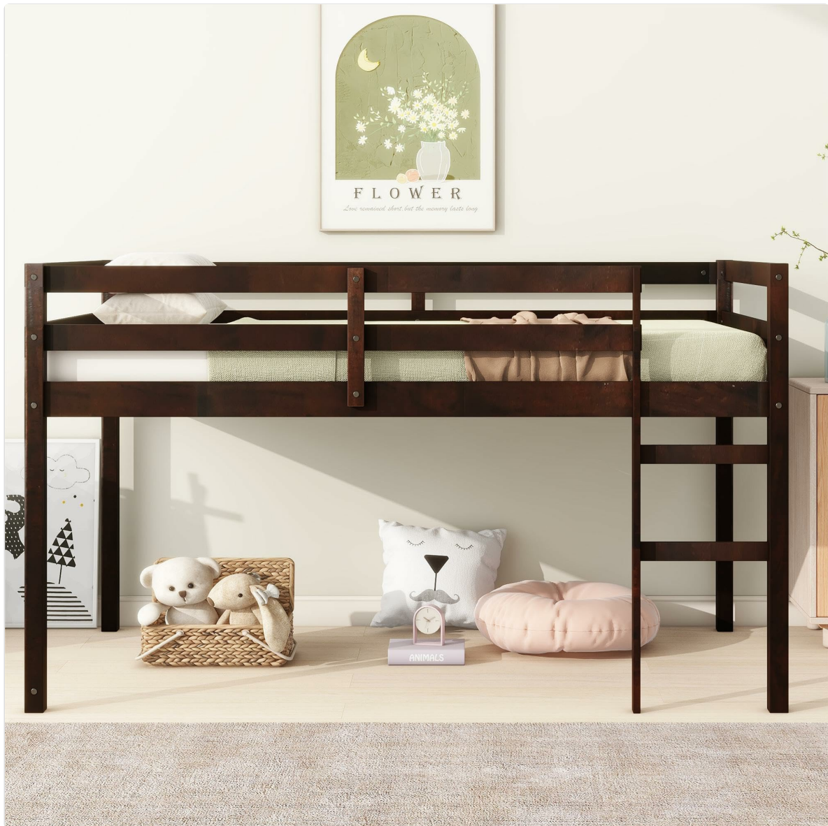
Image: Nahenduo Low Loft Bed Twin Size in Espresso finish, showcasing its overall design.