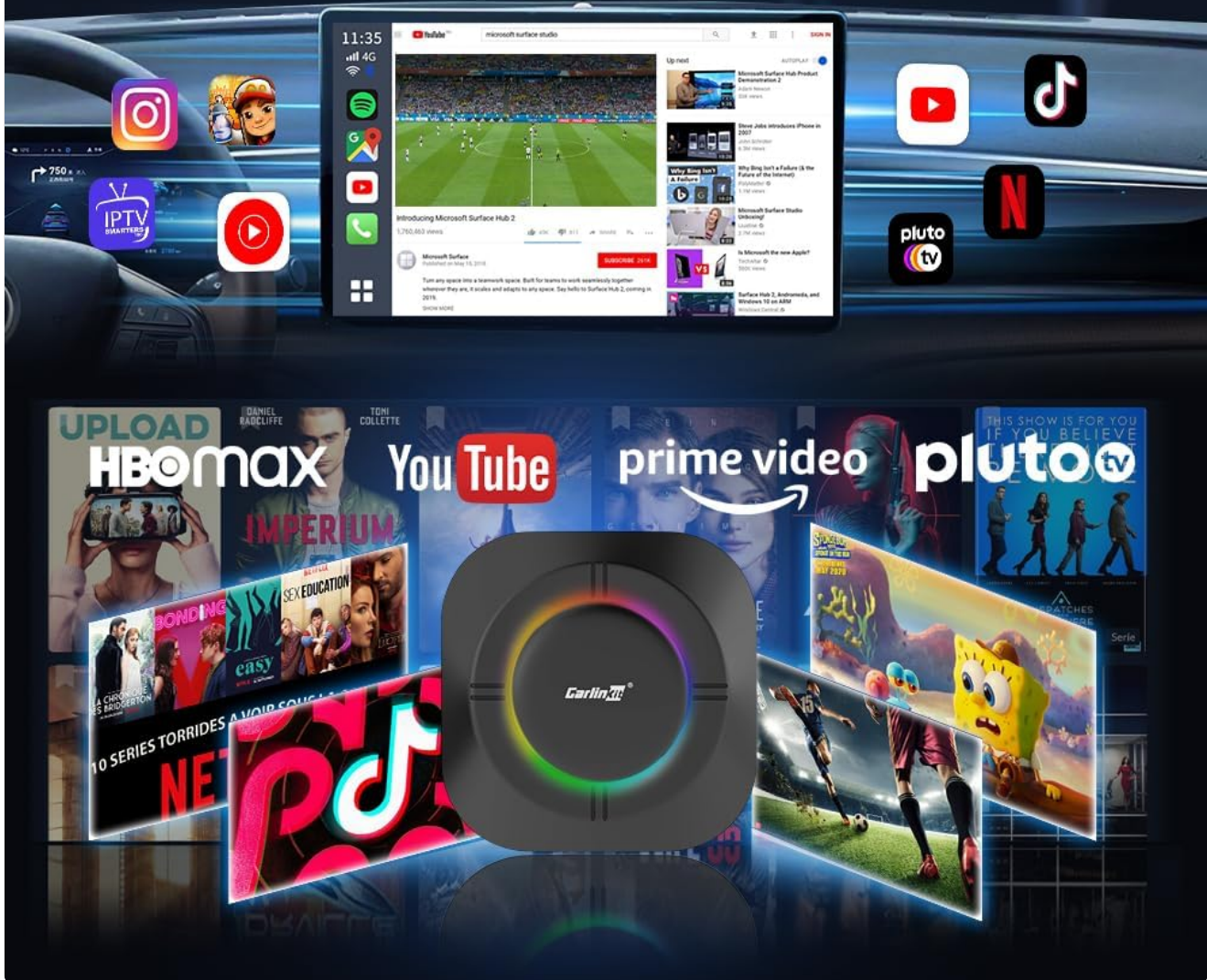
Image: Car infotainment screen displaying various entertainment apps like YouTube, Netflix, TikTok, and Pluto TV, indicating the device's capability for video entertainment.