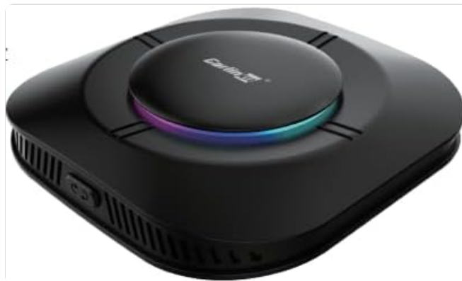
Image: Front view of the CarlinKit Tbox Ambient AI Box, a compact black square device with a circular center featuring an ambient light ring.

The CarlinKit Tbox Ambient AI Box is a multi-functional device designed to enhance your in-car entertainment and connectivity. It converts your car's wired CarPlay or Android Auto system into a wireless one, providing access to Android 13.0 features, app downloads, and seamless switching between CarPlay and Android Auto. This manual provides detailed instructions for setup, operation, and maintenance of your device.