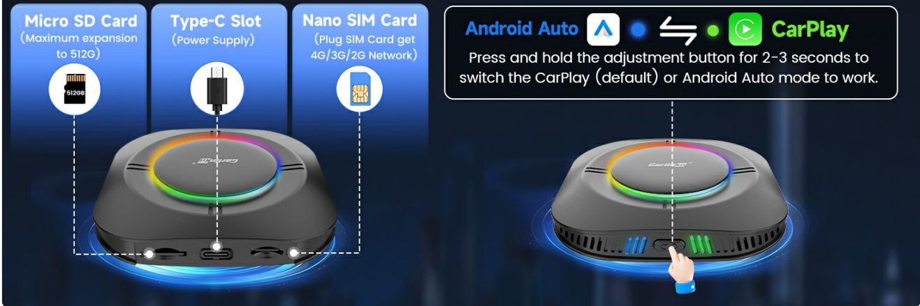
Image: Diagram illustrating the process of switching between Android Auto and CarPlay by pressing and holding the adjustment button on the device, also showing the Micro SD Card, Type-C Slot, and Nano SIM Card slots.