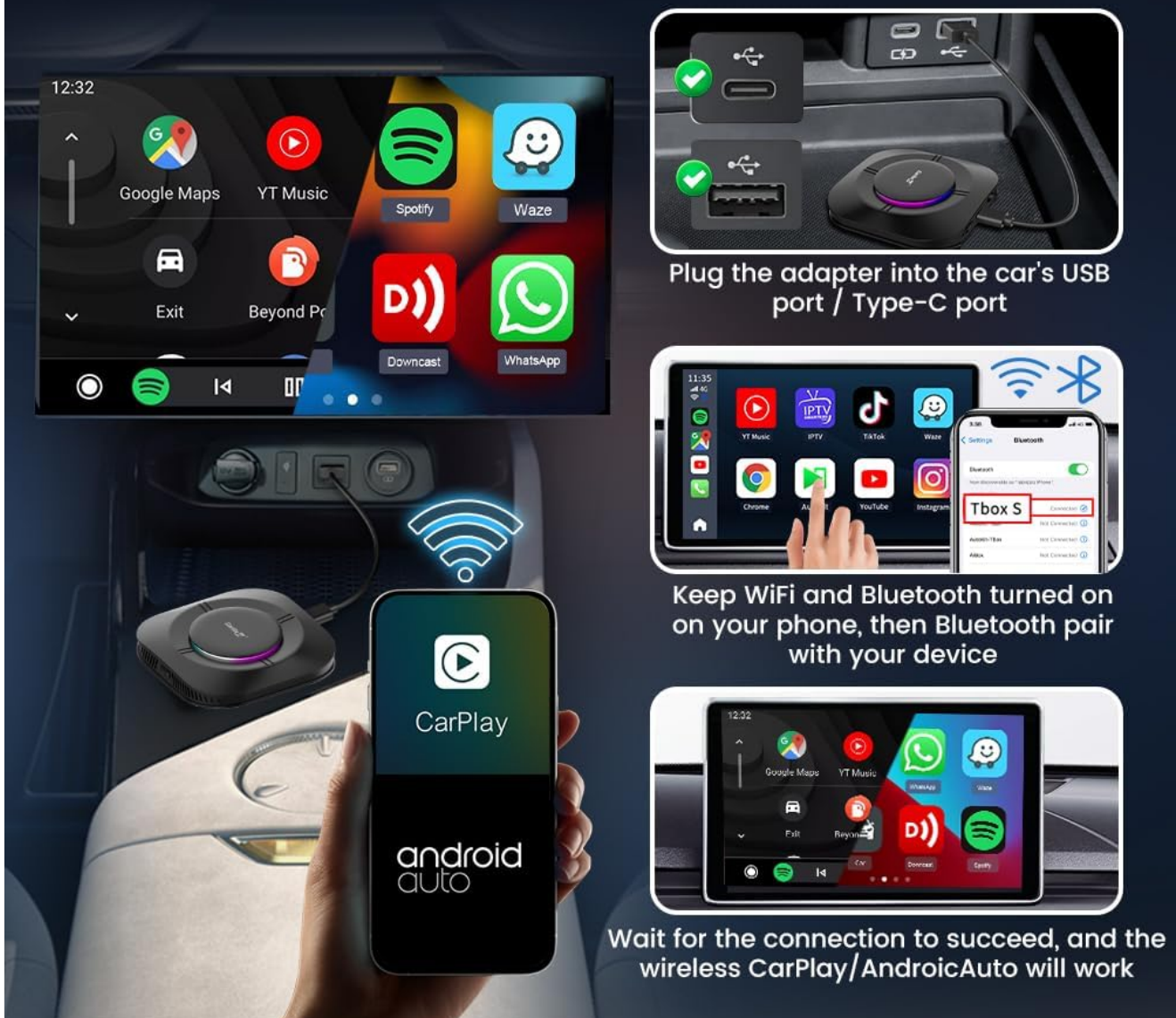
Image: Visual guide showing the three steps to connect the device: plugging it into the car's USB port, enabling Wi-Fi and Bluetooth on the phone and pairing, and finally, the successful connection displaying wireless CarPlay/Android Auto.