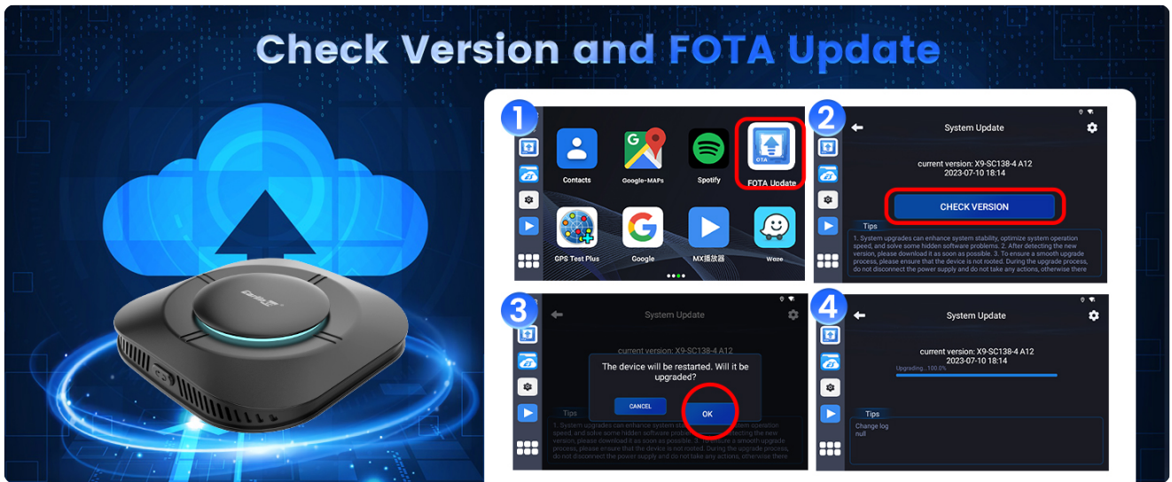
Image: Four-step visual guide demonstrating how to check for and perform a FOTA (Firmware Over-The-Air) update on the device's system settings.