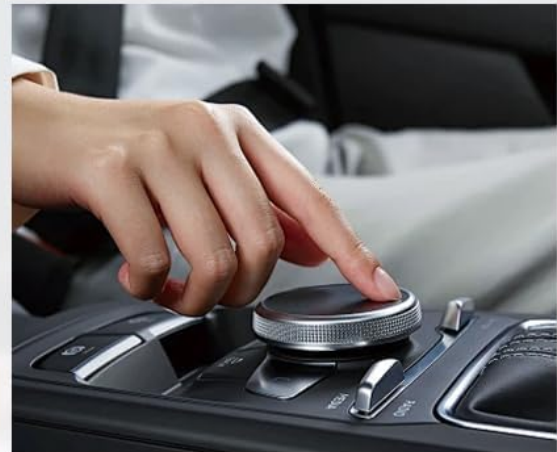
OEM Knob Control