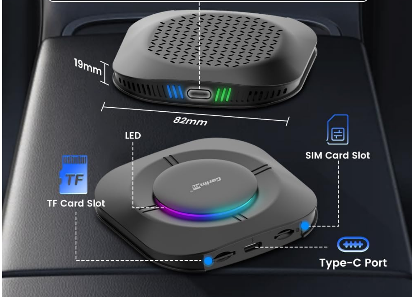
Image: Detailed diagram of the CarlinKit Tbox Ambient AI Box, highlighting the LED indicator, TF Card Slot, SIM Card Slot, Type-C Port, and the adjustment button, along with dimensions (82mm x 82mm x 19mm).

Press and hold the adjustment button for 2–3 seconds to switch the CarPlay (default) or Android Auto mode to work.