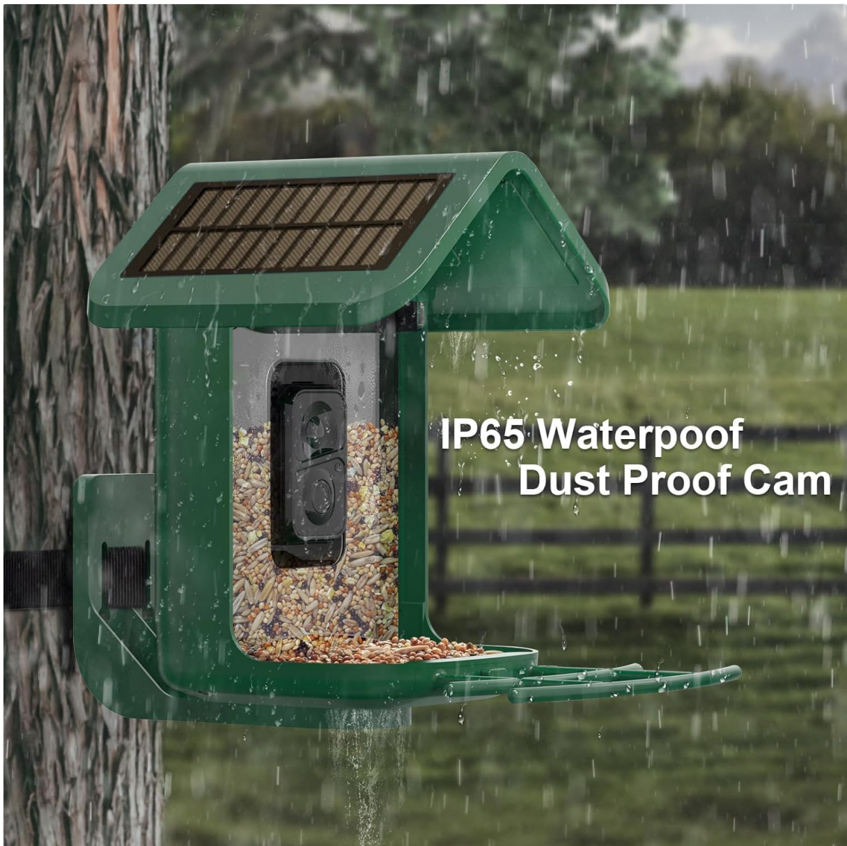
Image: Bird feeder mounted on a tree, showcasing the solar panel and weatherproof design.

Your browser does not support the video tag.