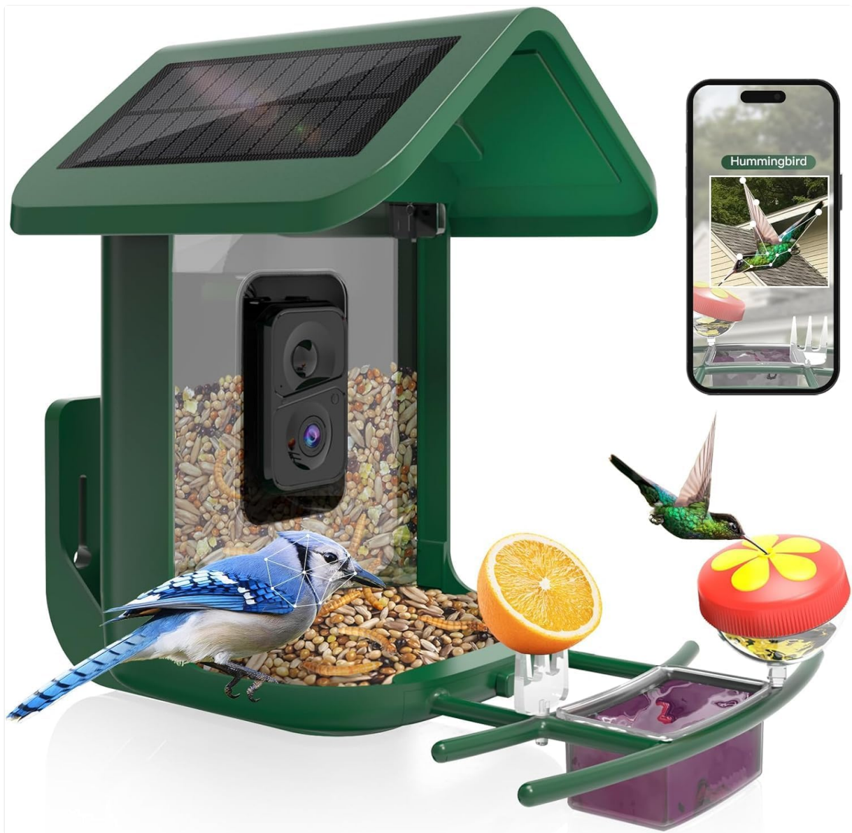
Image: The bird feeder filled with various seeds, showing the transparent seed compartment.