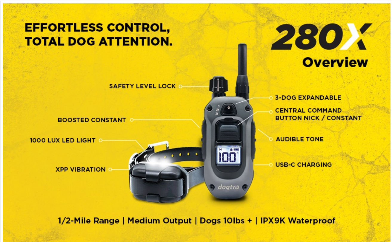
Figure 5: Dogtra 280X System Overview