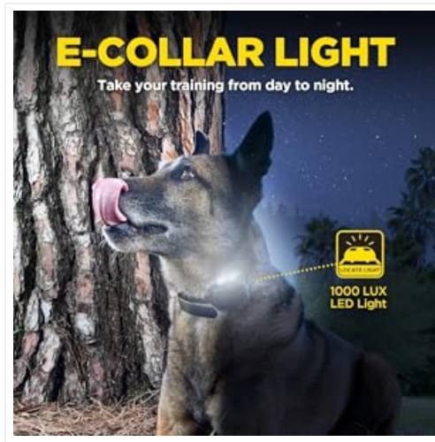
Figure 9: 1000 Lux LED Light for Visibility