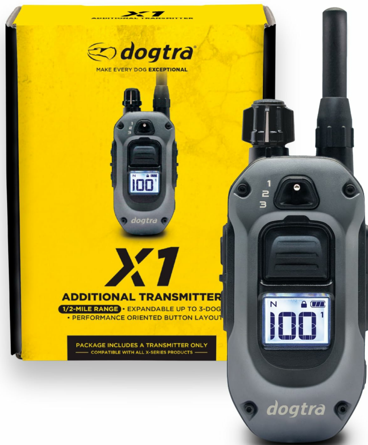
Figure 1: Dogtra X-Series X1 E-Collar Remote Transmitter