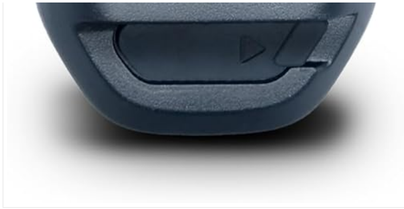
Figure 4: Back View of Transmitter with Belt Clip