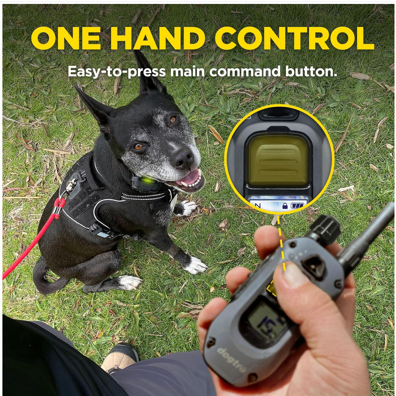
Figure 6: One-Hand Control for Easy Operation

The transmitter offers 100 levels of precise stimulation. Use the intensity dial on the top of the transmitter to increase or decrease the level. The current level is displayed on the LCD screen.