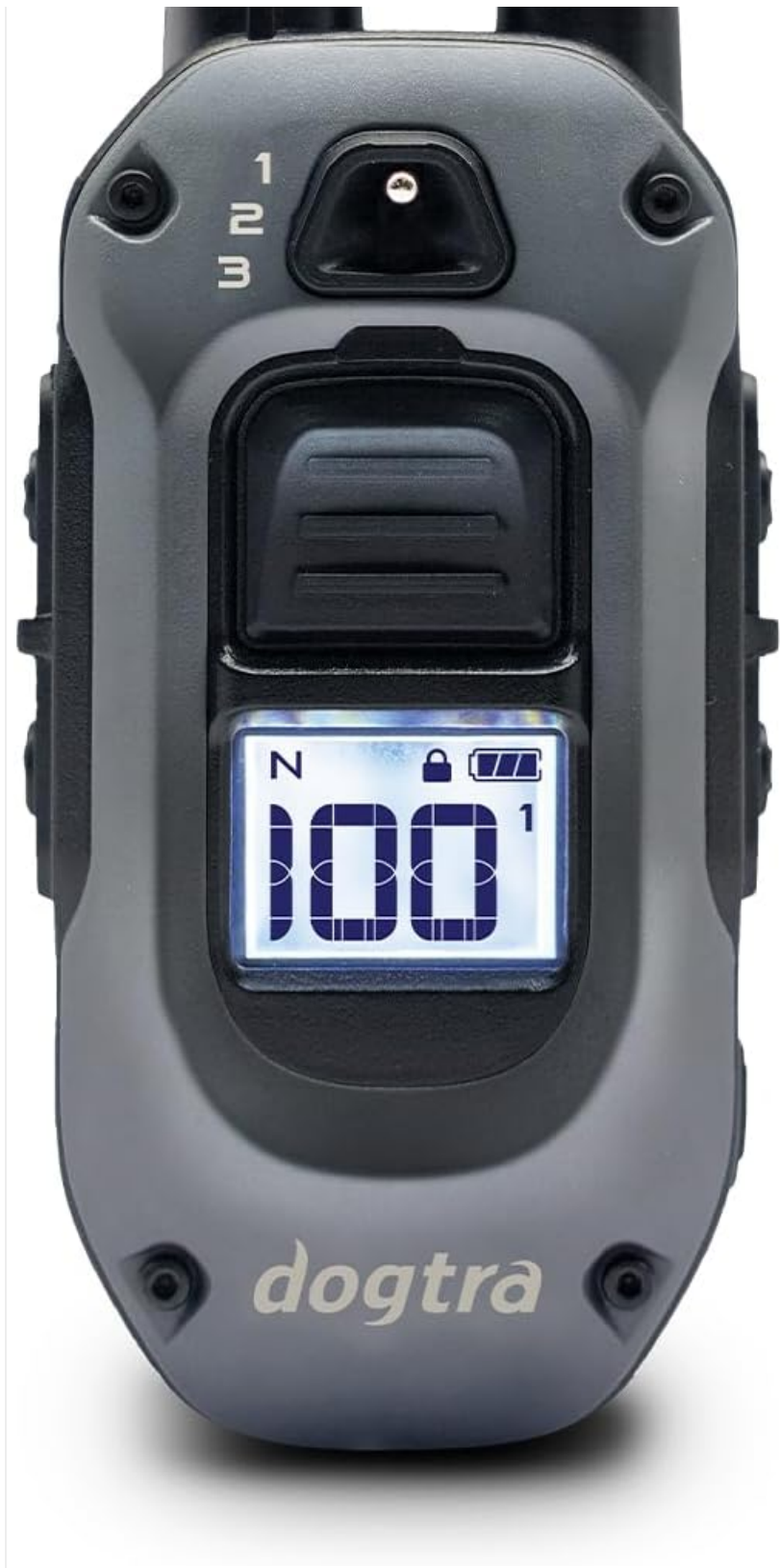
Figure 2: Front View of Transmitter