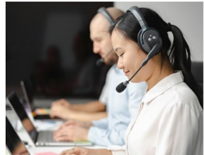
Expert After-Sales Support