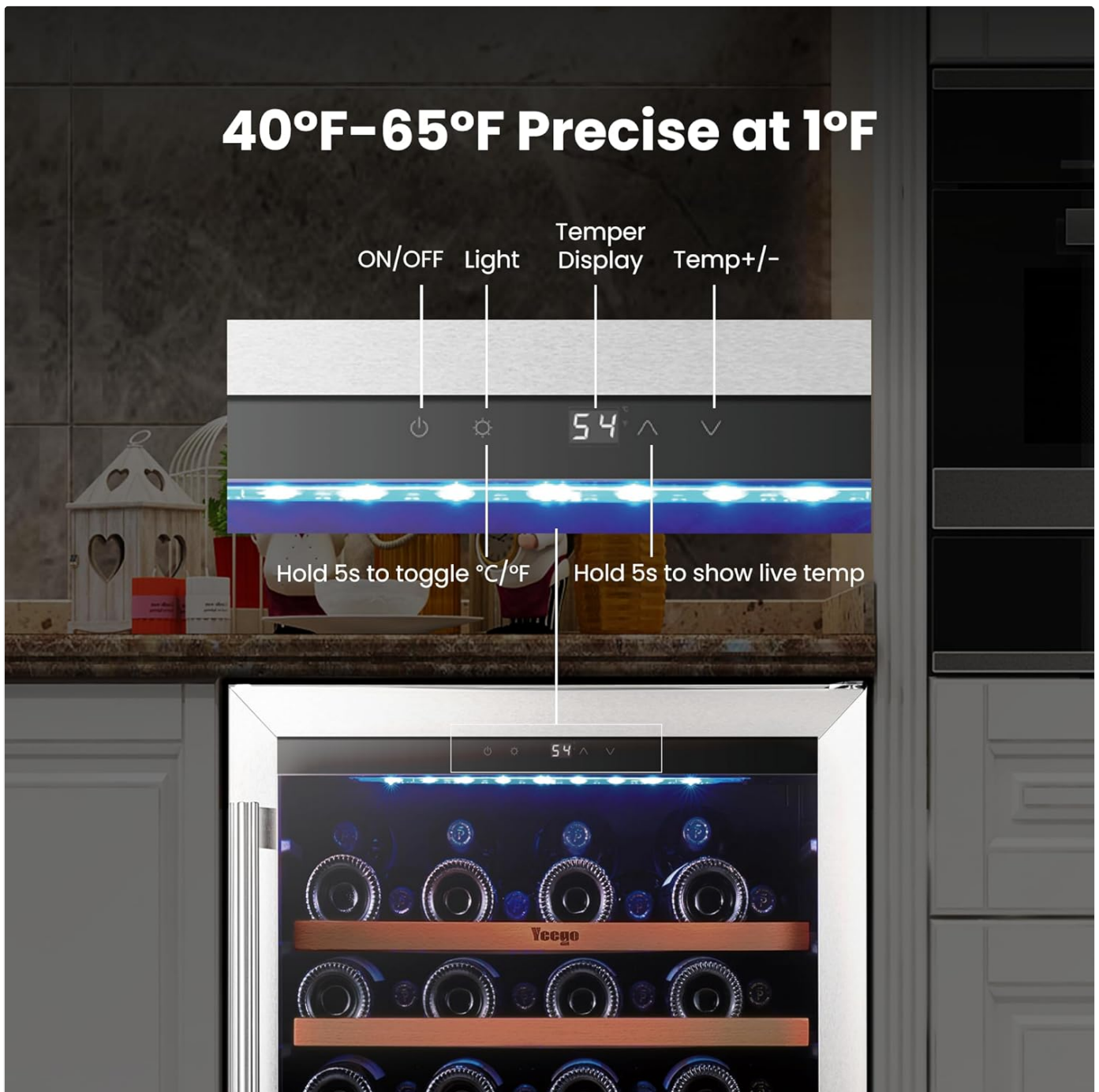
Figure 4.1: The LED control panel allows precise temperature adjustment and control of the interior blue light.