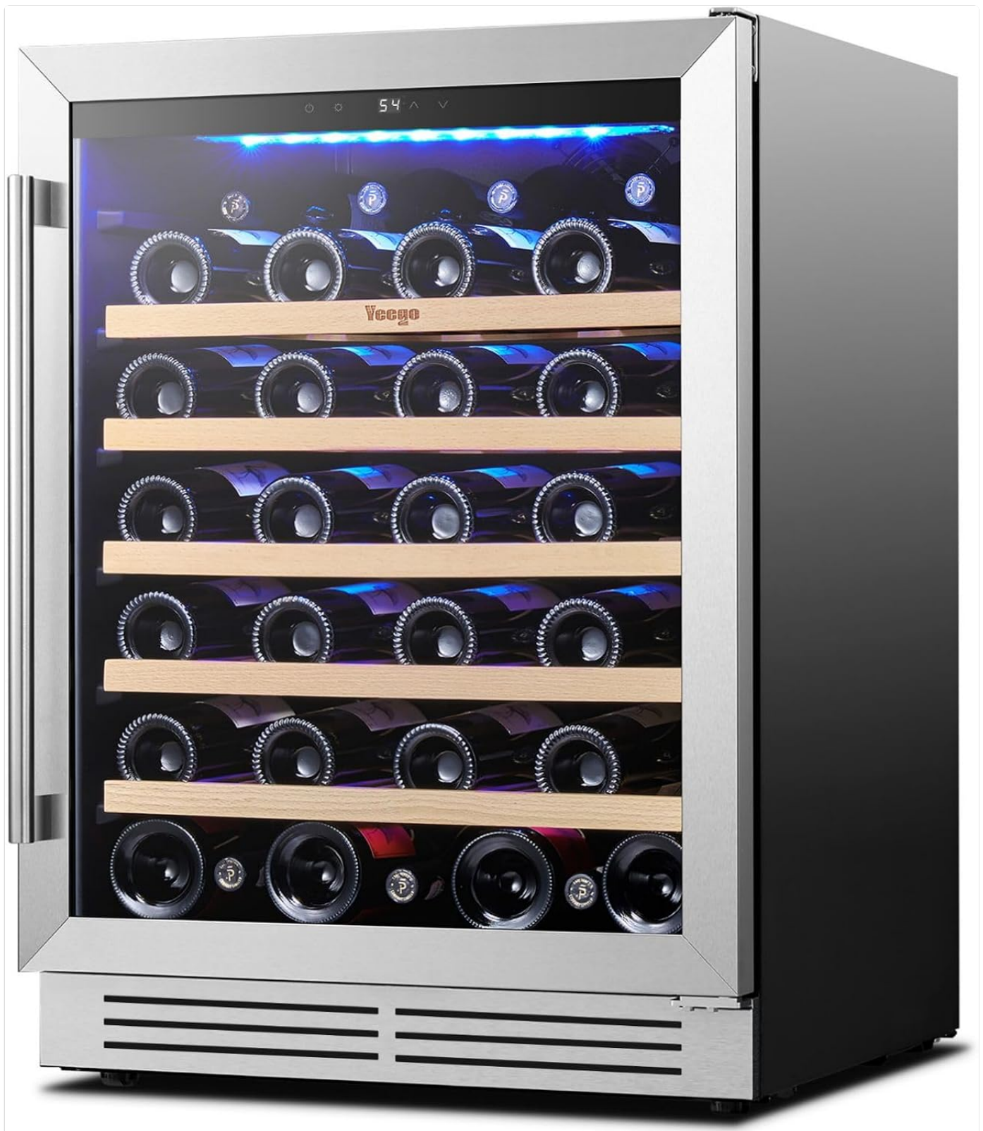
Figure 2.1: Front view of the Yeego 24-inch Single Zone Wine Fridge Cooler.