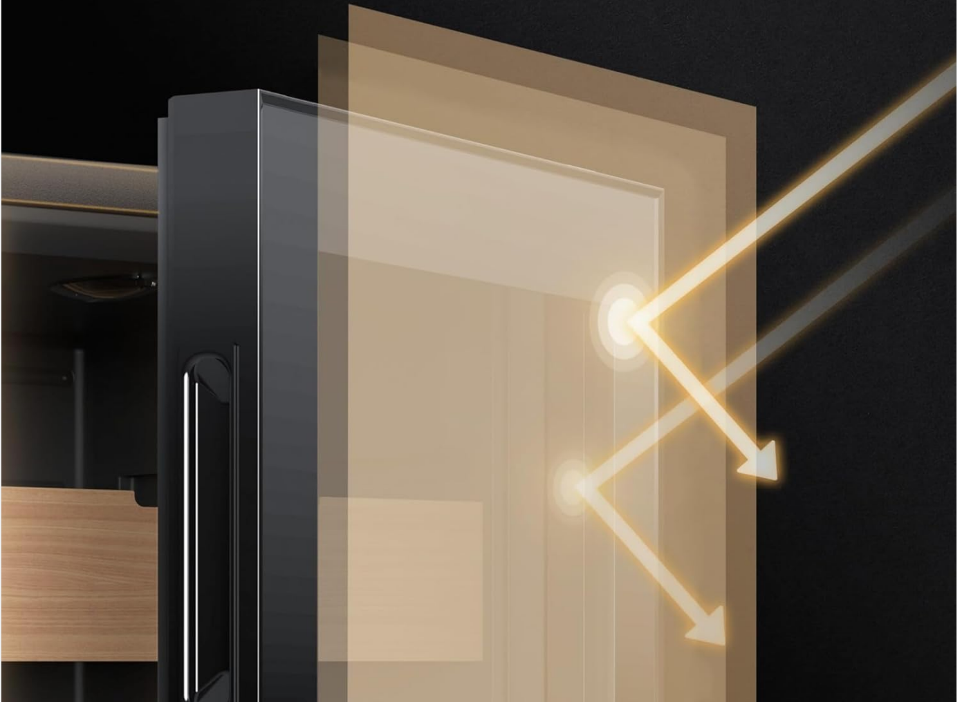
Figure 2.4: The double-layered tempered glass door effectively blocks harmful UV rays, ensuring wine preservation.