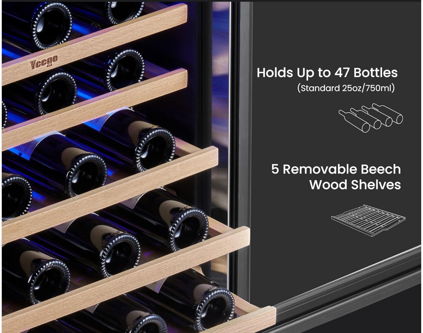
Figure 2.2: Close-up of the removable beech wood shelves, designed for flexible storage and protection of wine bottles.