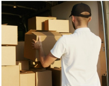
Secure Package Delivery