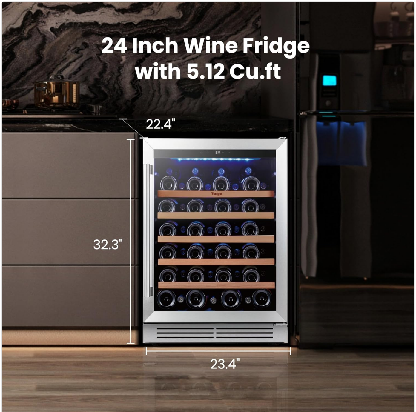
Figure 7.1: Detailed dimensions of the 24-inch wine fridge, showing width, depth, and height.