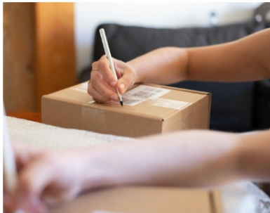
360° Protective Packaging