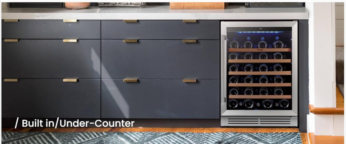
Figure 3.1: The wine fridge can be installed as a freestanding unit or integrated into cabinetry as a built-in or under-counter appliance.