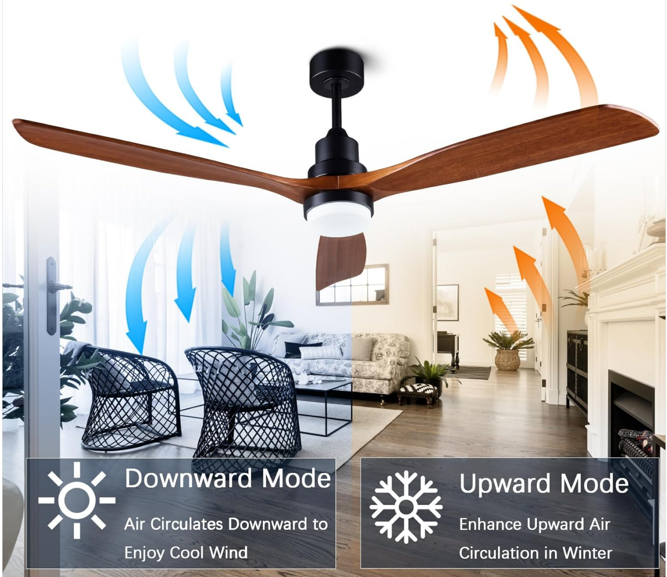
Figure 4: Explanation of the reversible function: Downward Mode for cooling in summer and Upward Mode for heat distribution in winter.