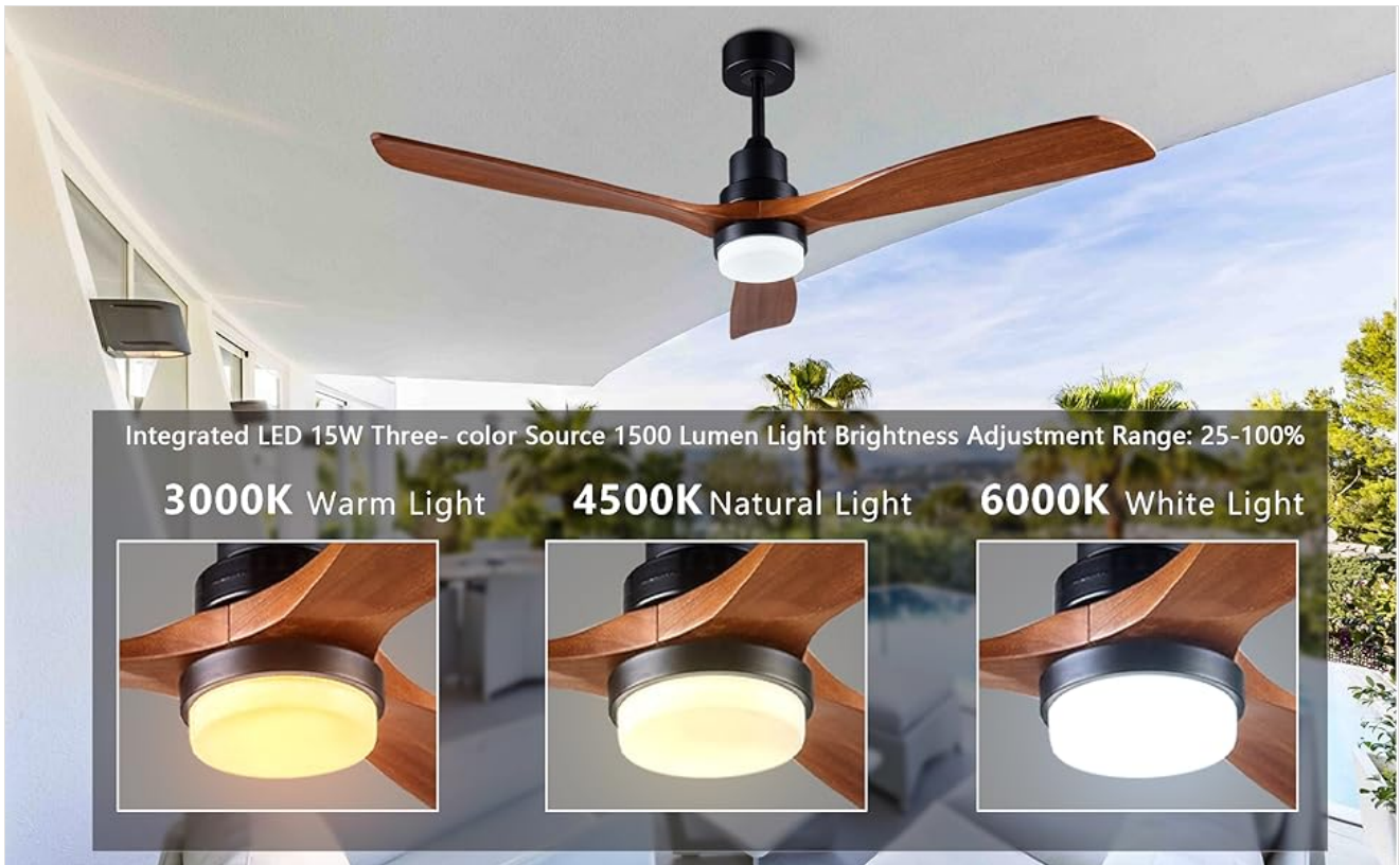
Figure 5: The integrated LED light offers three color temperatures: 3000K (Warm), 4500K (Natural), and 6000K (White).