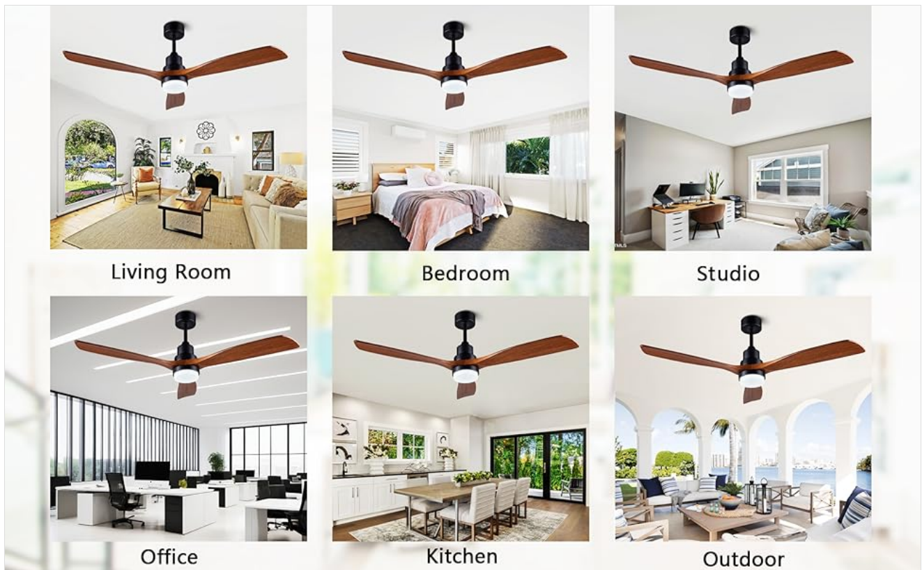
Figure 2: The 60-inch ceiling fan installed in a living room, bedroom, and courtyard, demonstrating its versatile application.