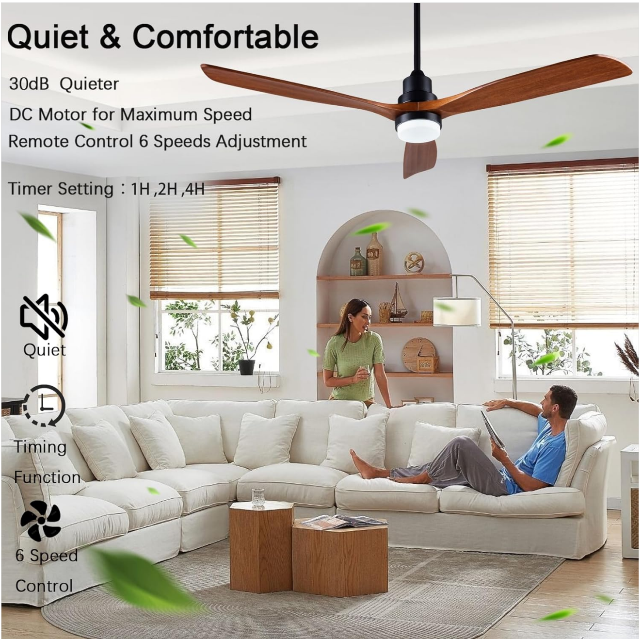
Figure 3: The fan's quiet operation (below 30dB), 6-speed adjustment, and timer functions (1H, 2H, 4H) for comfortable use.