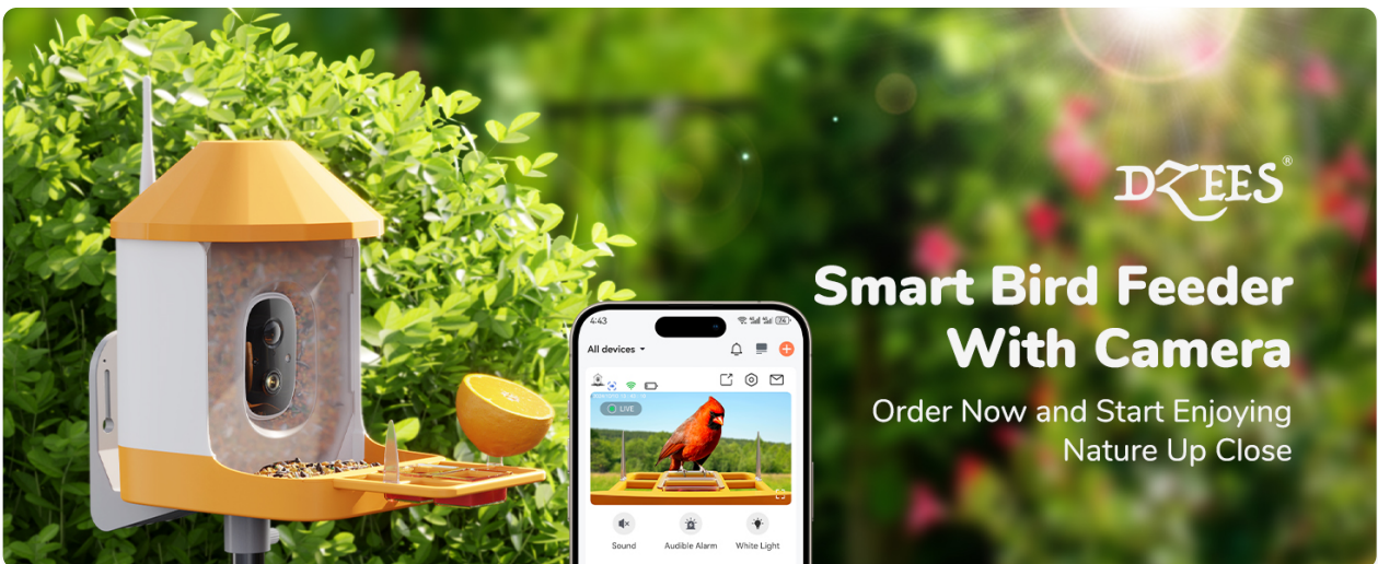
Image: Examples of bird videos captured and stored via the app.