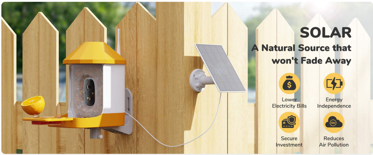
Image: The bird feeder is designed for various weather conditions.