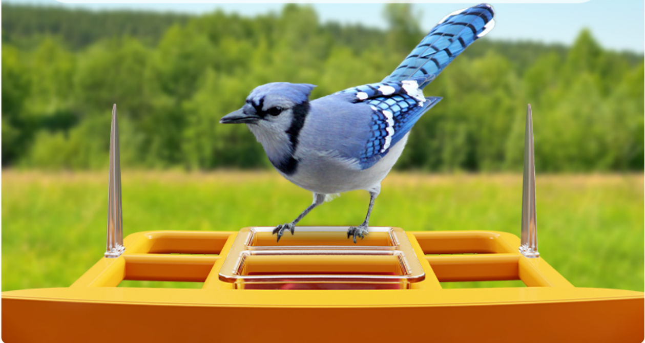
Image: Two-way audio and deterrence features.