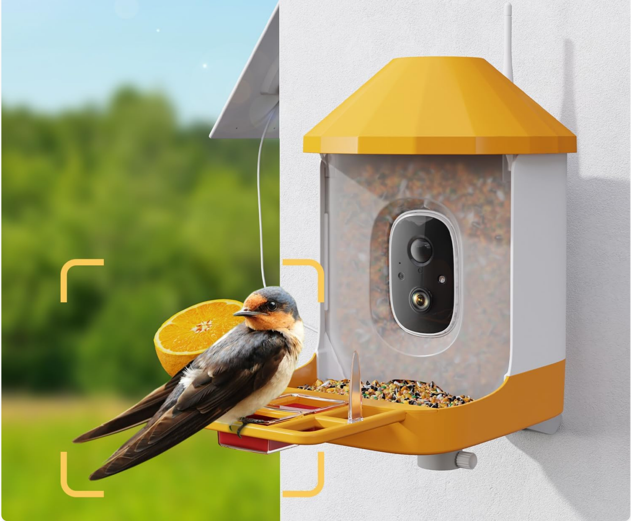
Image: All components included in the Dzees Smart Bird Feeder package.