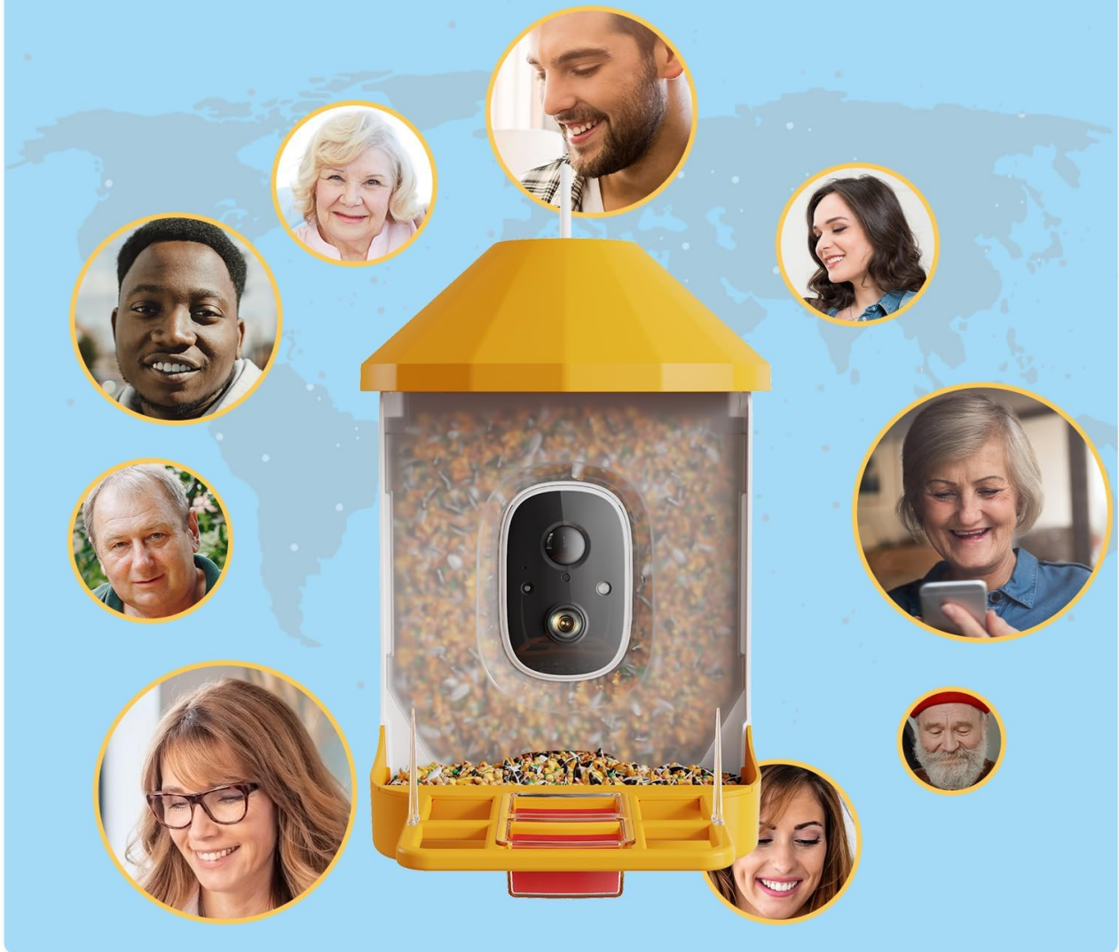
Image: Solar panel connected to the bird feeder for continuous power.