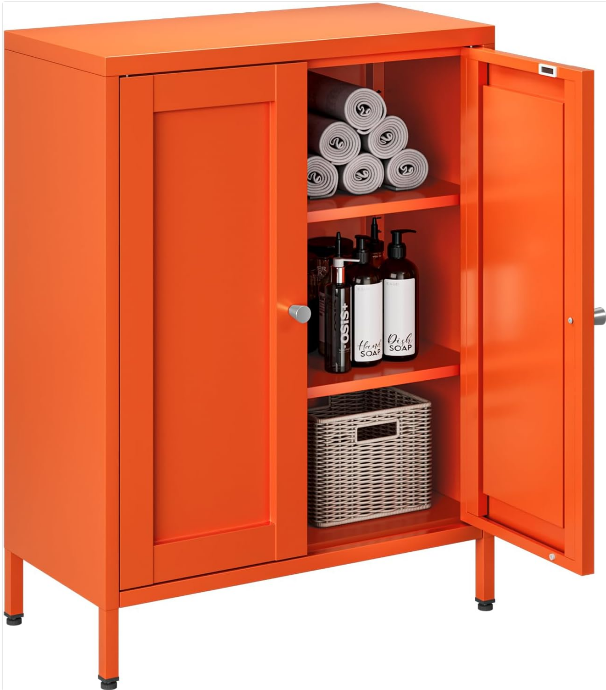
Figure 1: The fully assembled Bevivog small orange metal storage cabinet. The two doors are open, showcasing the interior with two adjustable shelves. Various items such as rolled towels, bottles, and a woven basket are neatly stored inside, demonstrating its storage capacity.