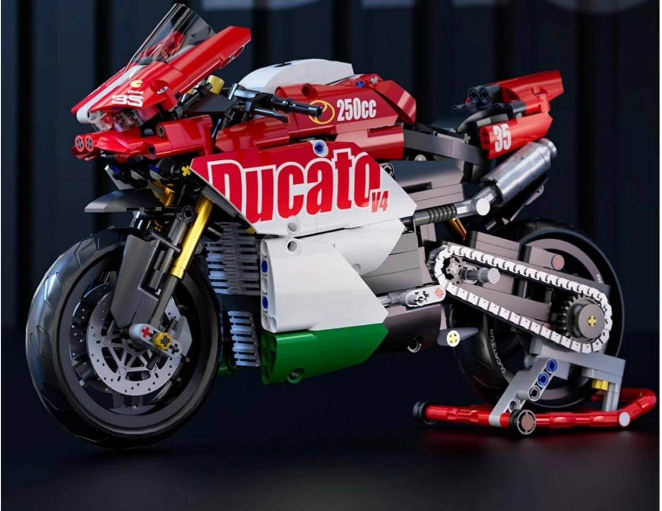
Image: Front view of the assembled HTLNUZD Motorcycle V4 Building Blocks Set, showcasing its detailed design and red and white color scheme.