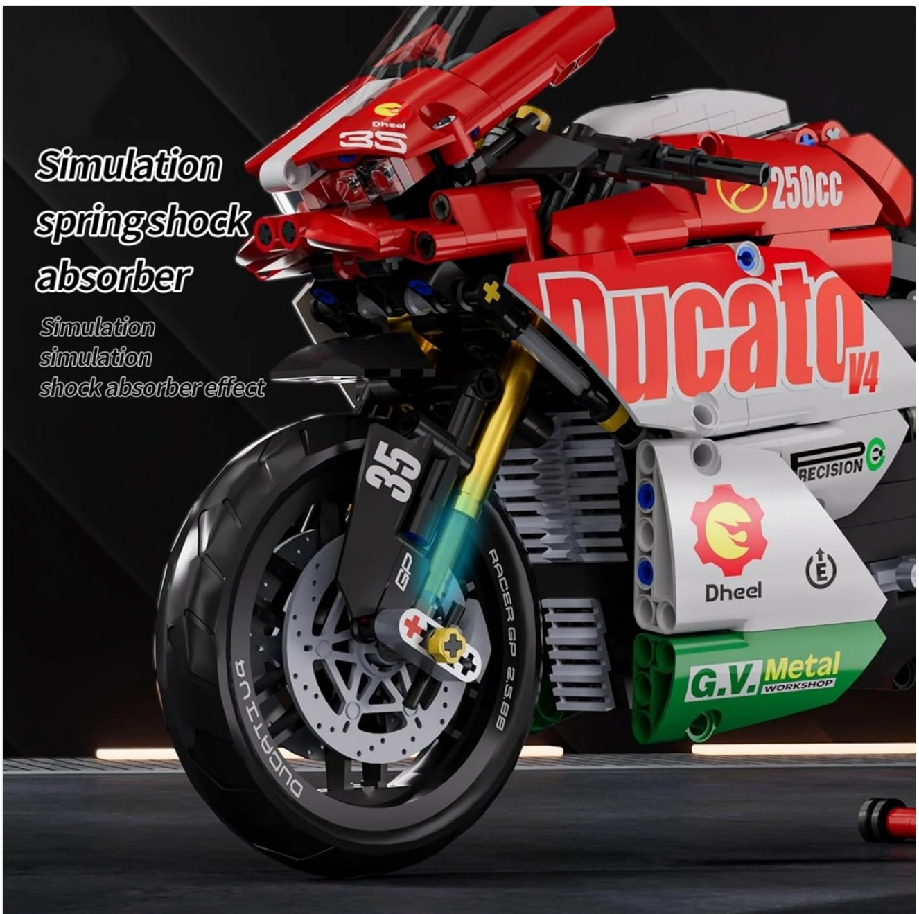
Image: Detail of the simulated spring shock absorber on the front fork, demonstrating a functional design element of the model.