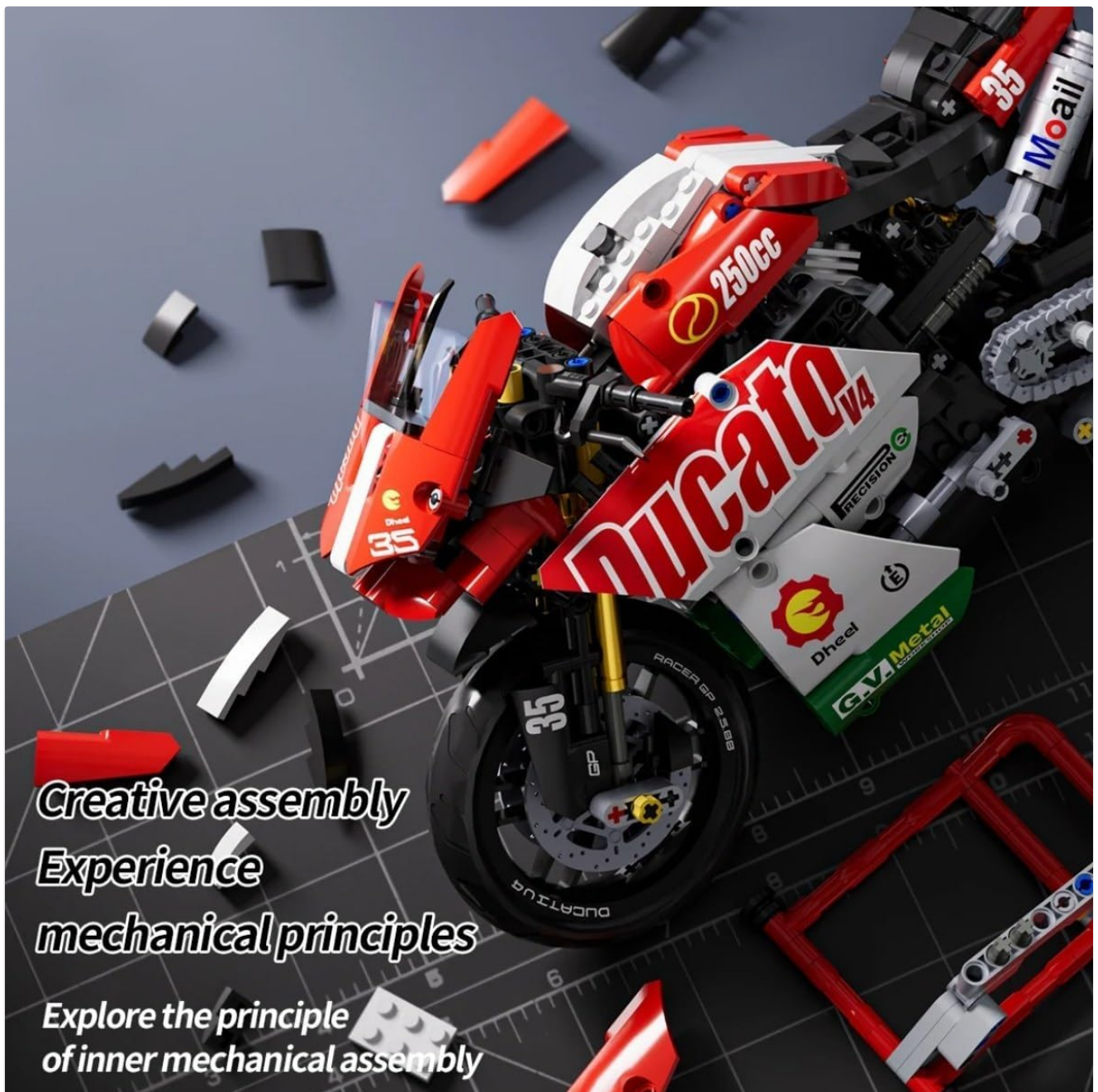
Image: A close-up view of the front wheel and engine section of the model, highlighting the intricate assembly details and various block types.