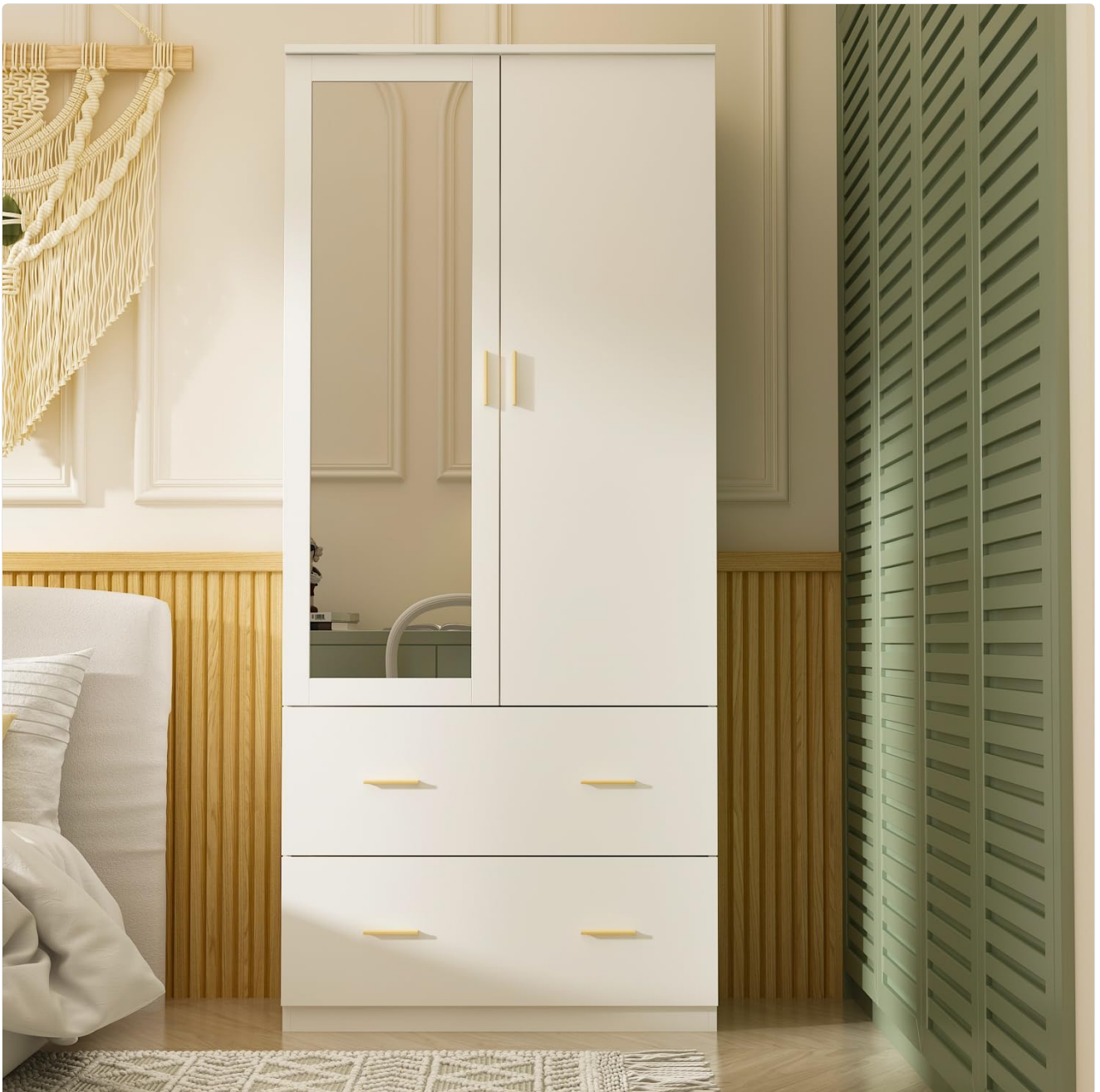
Image: The fully assembled Hitow 2 Door Wardrobe Armoire, showcasing its design and mirror feature.