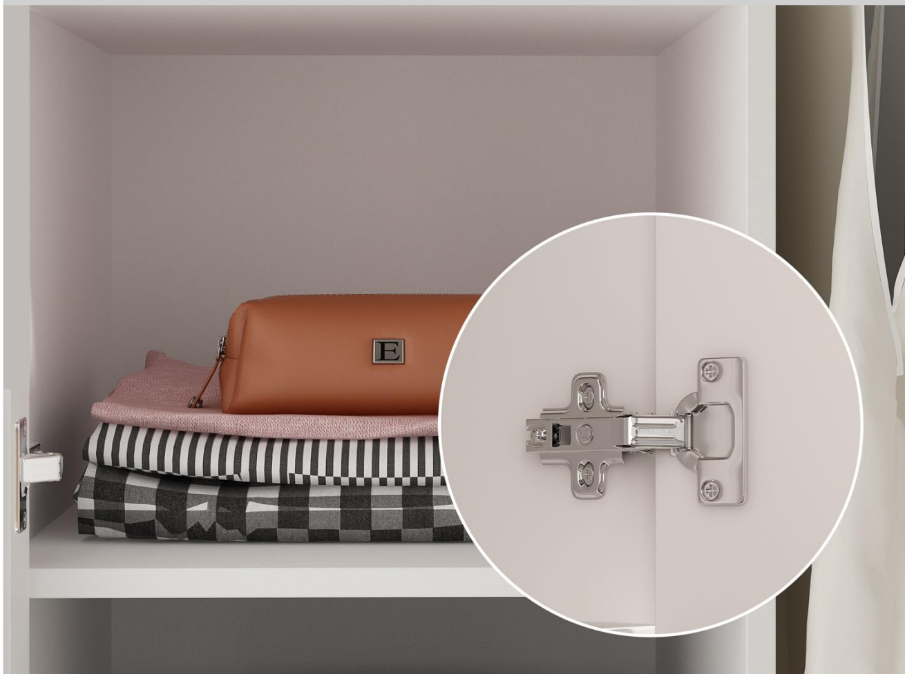
Image: Detail of the silent, strong, and durable hinge mechanism ensuring smooth door operation.

The connected hardware parts are strictly selected, firm and reliable, quiet and noise proof