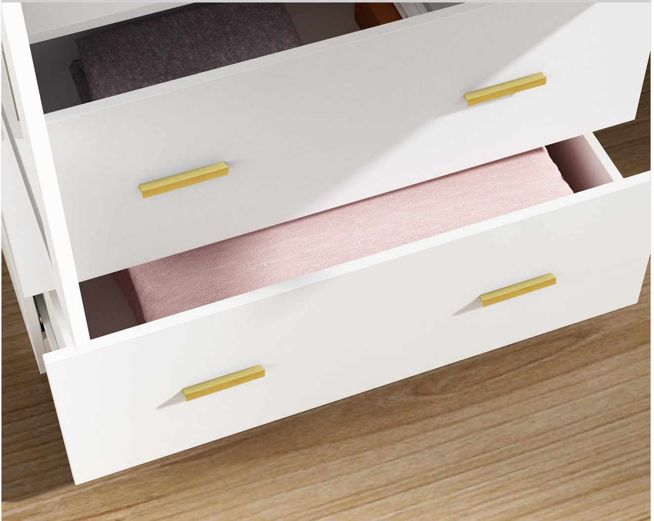
Image: The two spacious drawers, designed for easy access and storage of smaller items.

Private drawer space for easy storage of small items and easy access