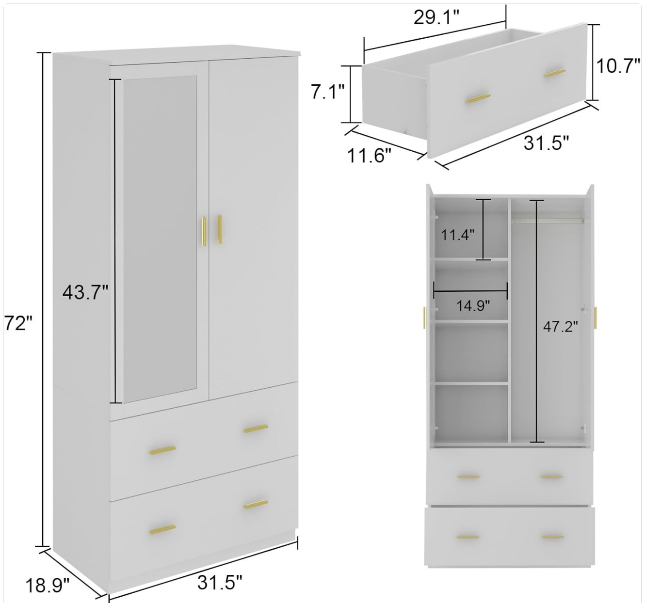
Image: Exploded view diagram illustrating all components and their respective dimensions for the Hitow 2 Door Wardrobe Armoire.