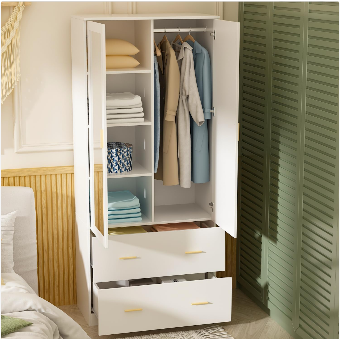
Image: Interior organization of the wardrobe, featuring a hanging rod for clothes and multiple shelves for folded items.