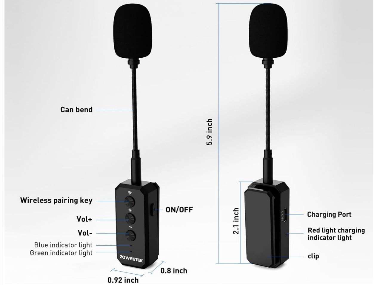
Image: Diagram of the ZOWEETEK Wireless Lavalier Microphone, highlighting its flexible neck, ON/OFF switch, Volume controls, Wireless pairing key, Charging Port, and indicator lights.