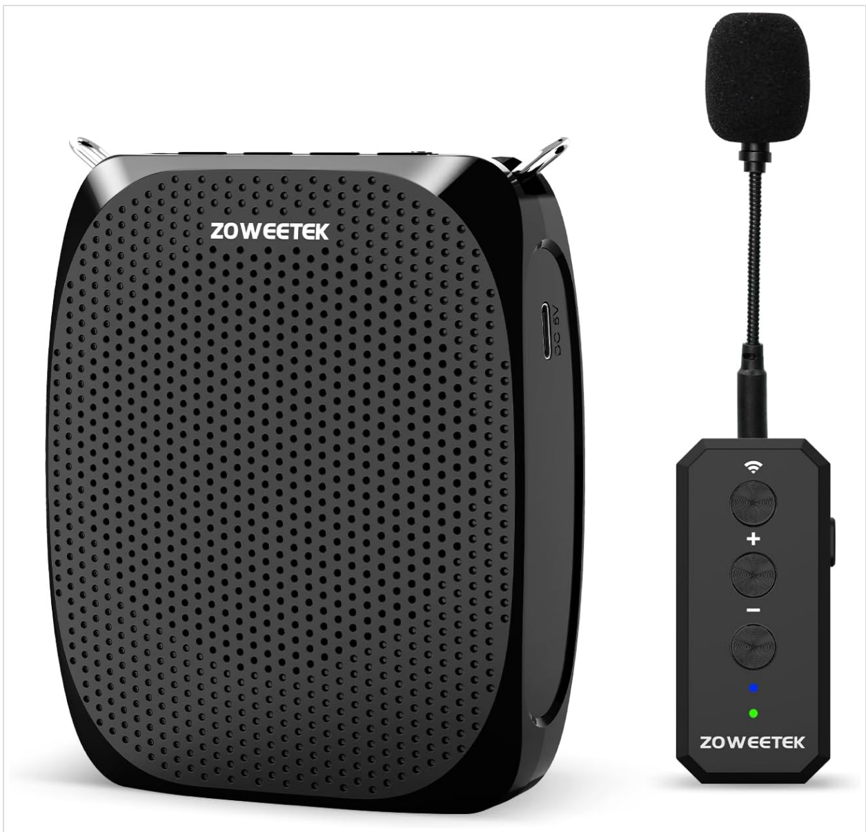
Image: The ZOWEETEK S711 Voice Amplifier (left) and its accompanying Wireless Lavalier Microphone (right).