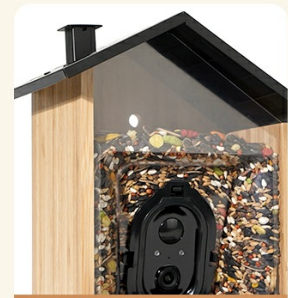
Large Food Storage 3.2L

Share your bird watching moments with others.