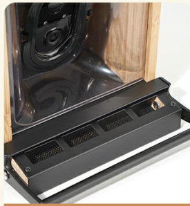
Squirrels-proof Spring Perch