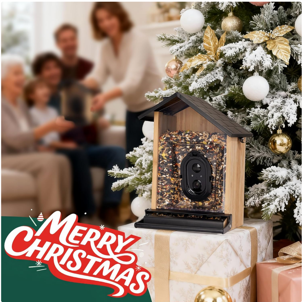
The BBPECO Smart Bird Feeder with its integrated camera and seed compartment.