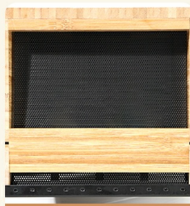
Drainage Hole Keep Food Dry