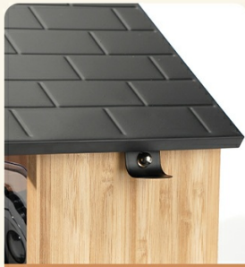
Open Roof by Pressed