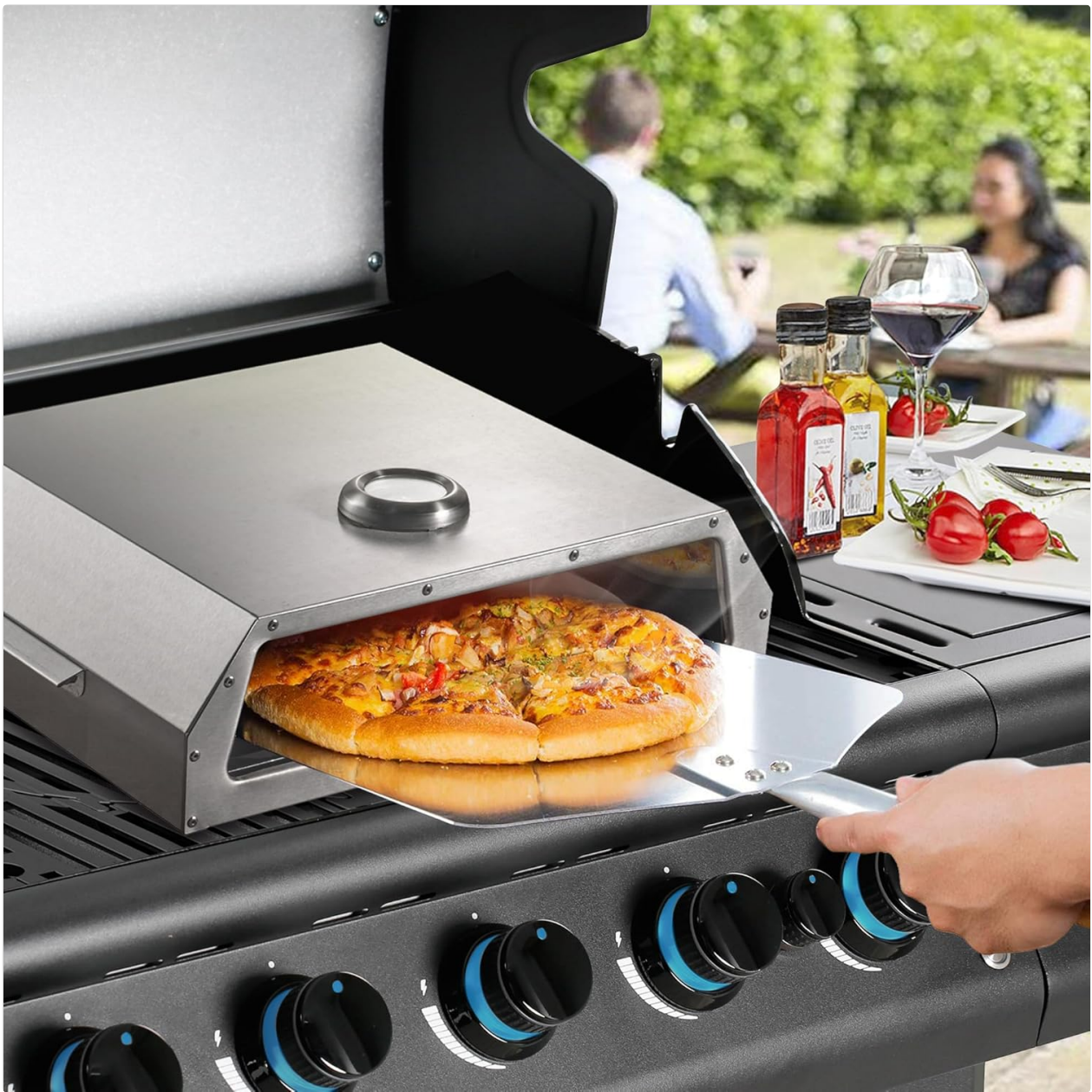
Image 5.1: A cooked pizza being carefully removed from the oven using a pizza peel.