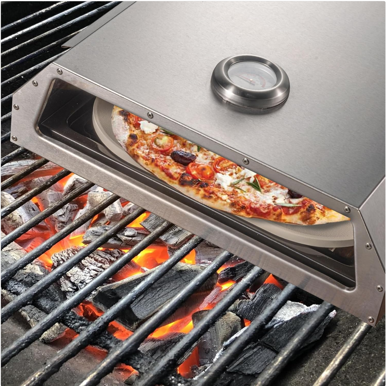
Image 4.1: The pizza oven positioned on a charcoal grill, ready for preheating.