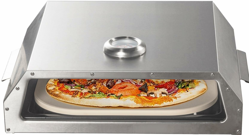
Image 1.1: Front view of the BIG HORN Portable Stainless Steel Pizza Oven, showing the integrated thermometer and the ceramic pizza stone.