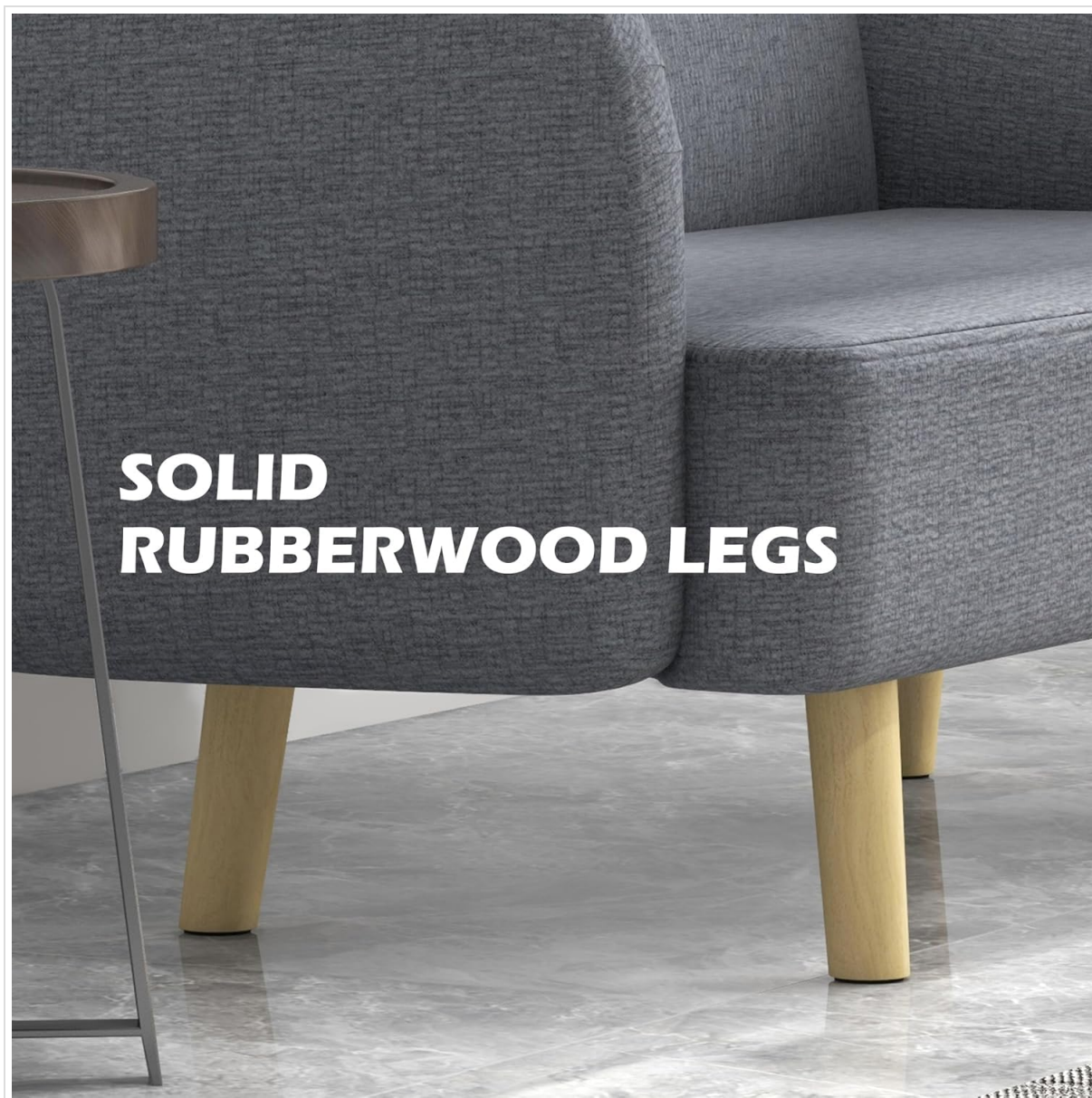
Image: Solid rubberwood legs provide stable support for the loveseat.