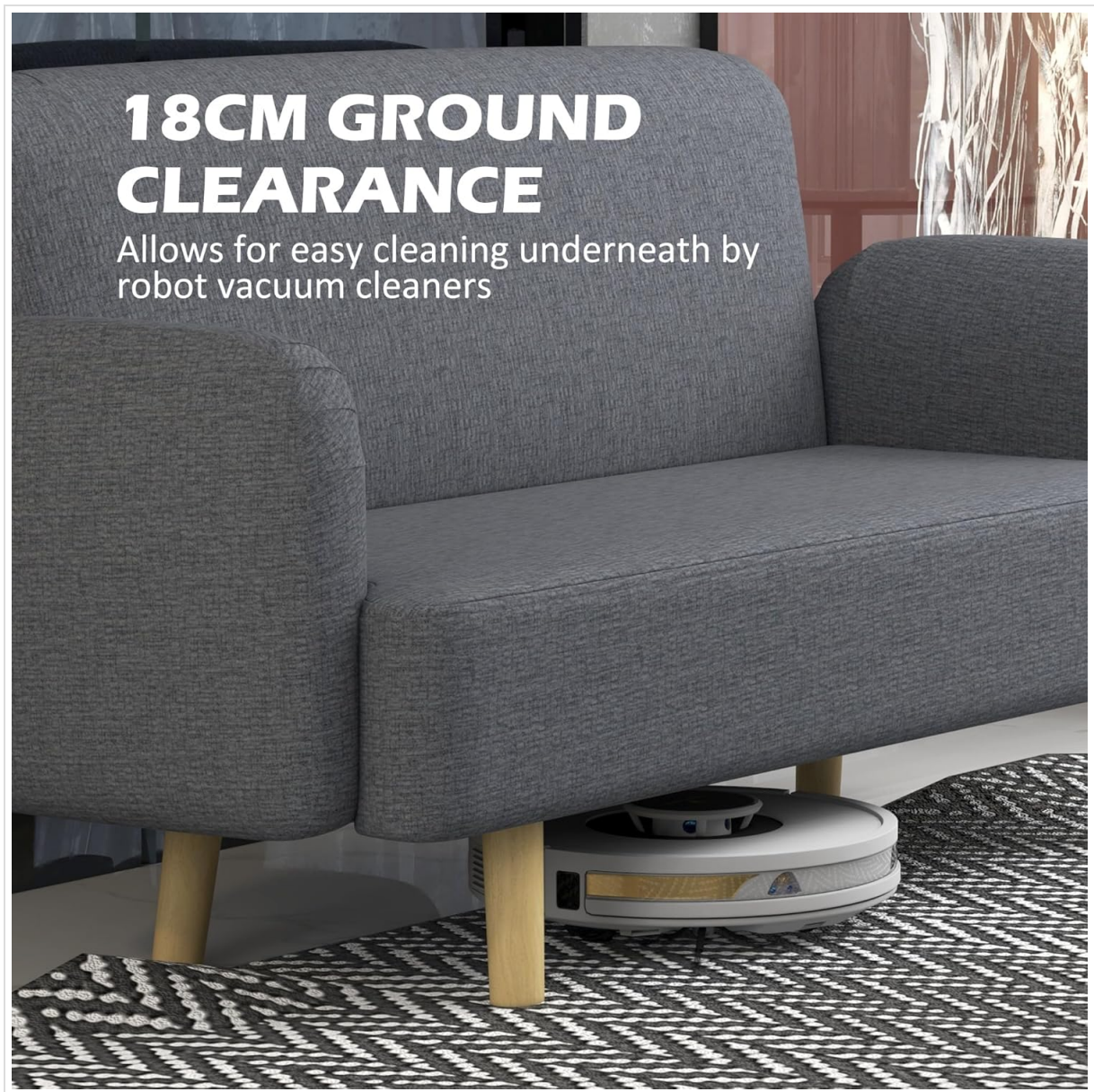
Image: The 18cm ground clearance facilitates easy cleaning underneath the sofa.