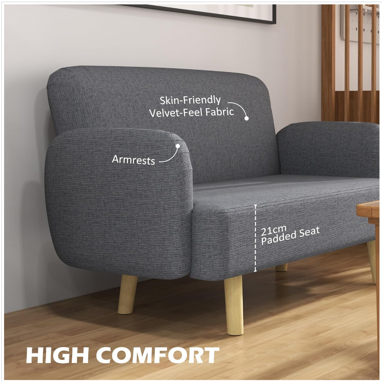
Image: Key comfort features including the padded seat and soft fabric.