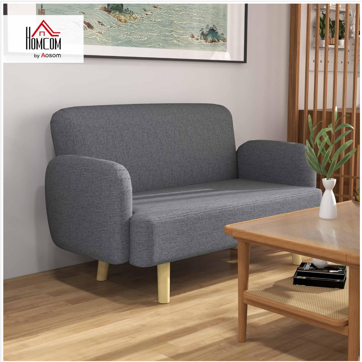
Image: The HOMCOM loveseat provides comfortable seating for two.