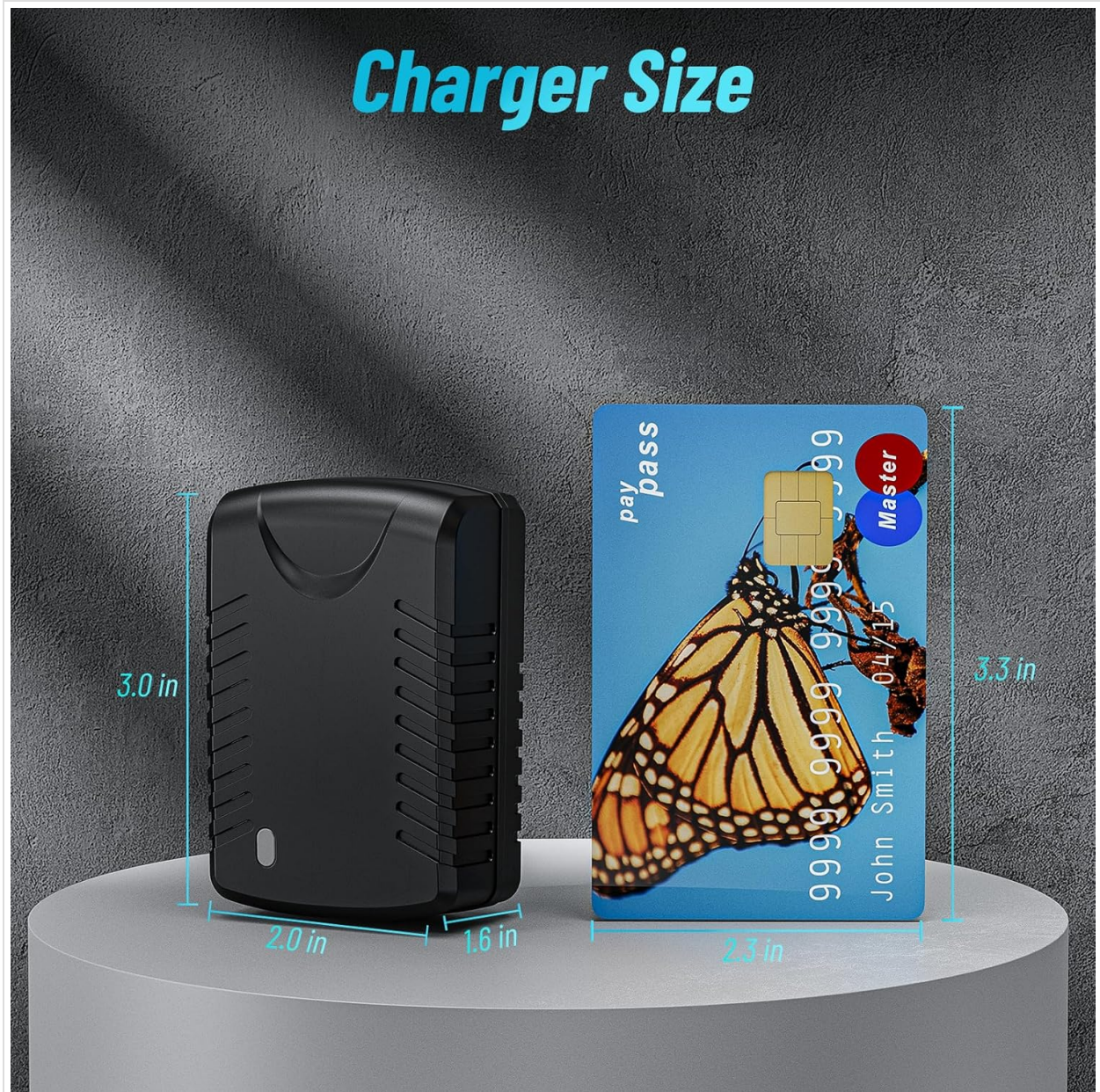
Figure 8.2: The compact size of the charger, measuring approximately 3.0 x 2.0 x 1.6 inches.