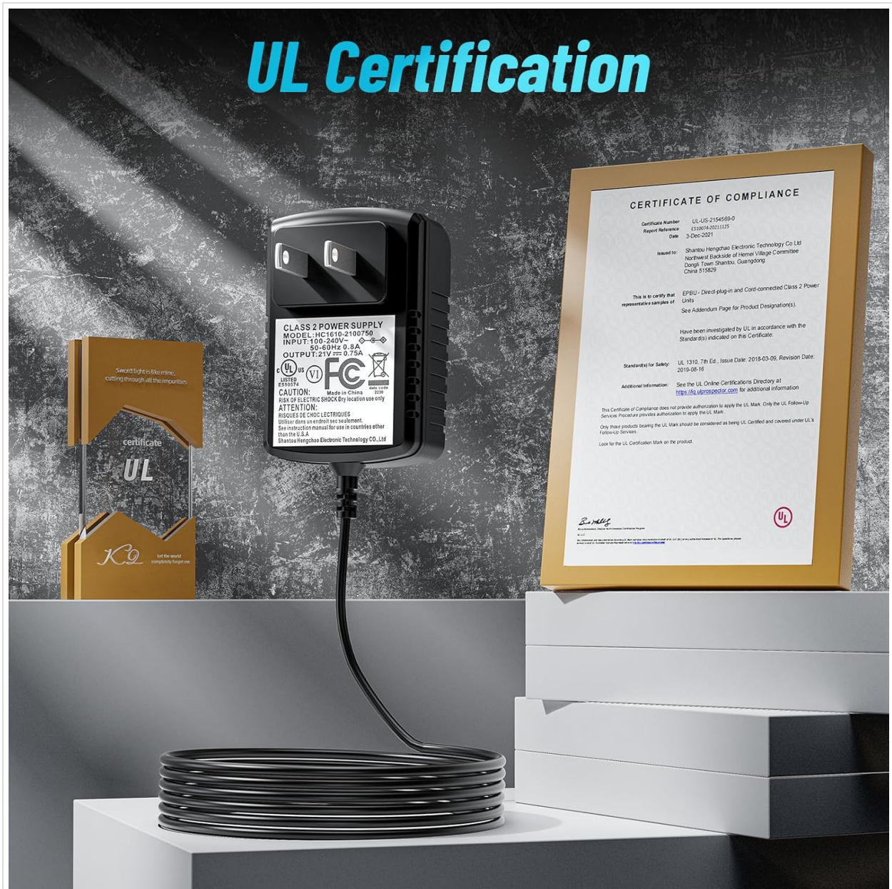
Figure 4.2: The battery charger is UL certified, ensuring compliance with safety standards.