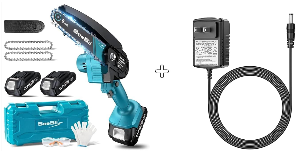
Figure 3.1: Complete package contents of the Seesii Mini Chainsaw and charger. Includes the chainsaw, two batteries, charger, spare chains, guide bar, wrench, safety gear, oil bottle, and storage case.