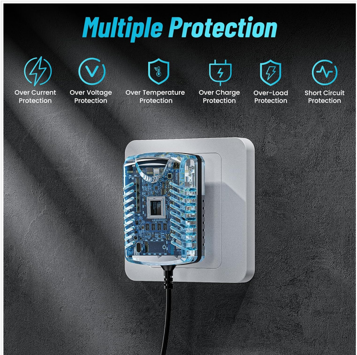
Figure 4.1: The Seesii battery charger features multiple protection mechanisms including over current, over voltage, over temperature, over charge, over-load, and short circuit protection.