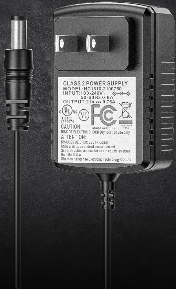
Figure 8.1: Detailed product parameters for the 21V battery charger.