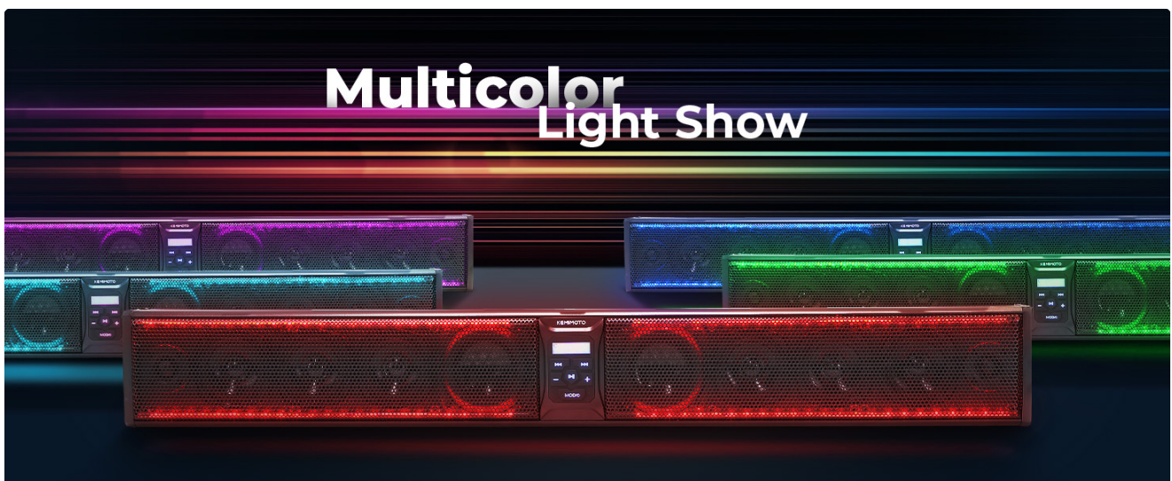
Image: The sound bar displaying a vibrant multicolor light show, illustrating the RGB capabilities.