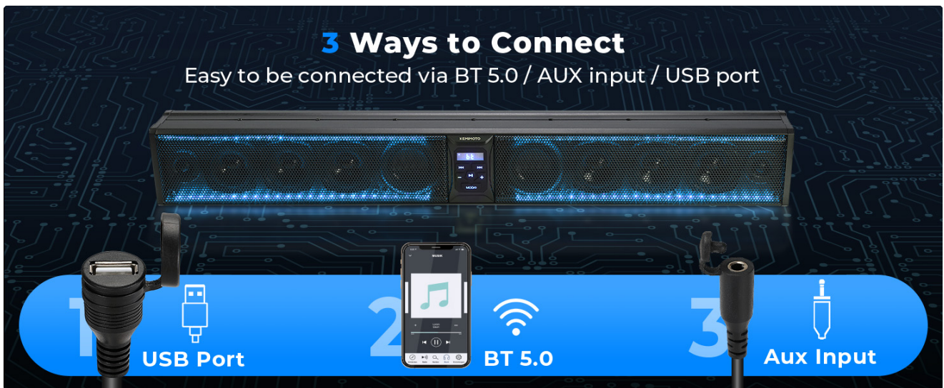
Image: Illustration of the three connection methods: USB port, Bluetooth 5.0, and Aux Input.