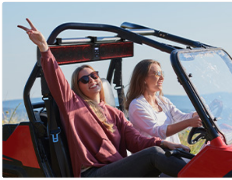
Image: The sound bar securely mounted on a UTV roll cage, demonstrating proper placement.