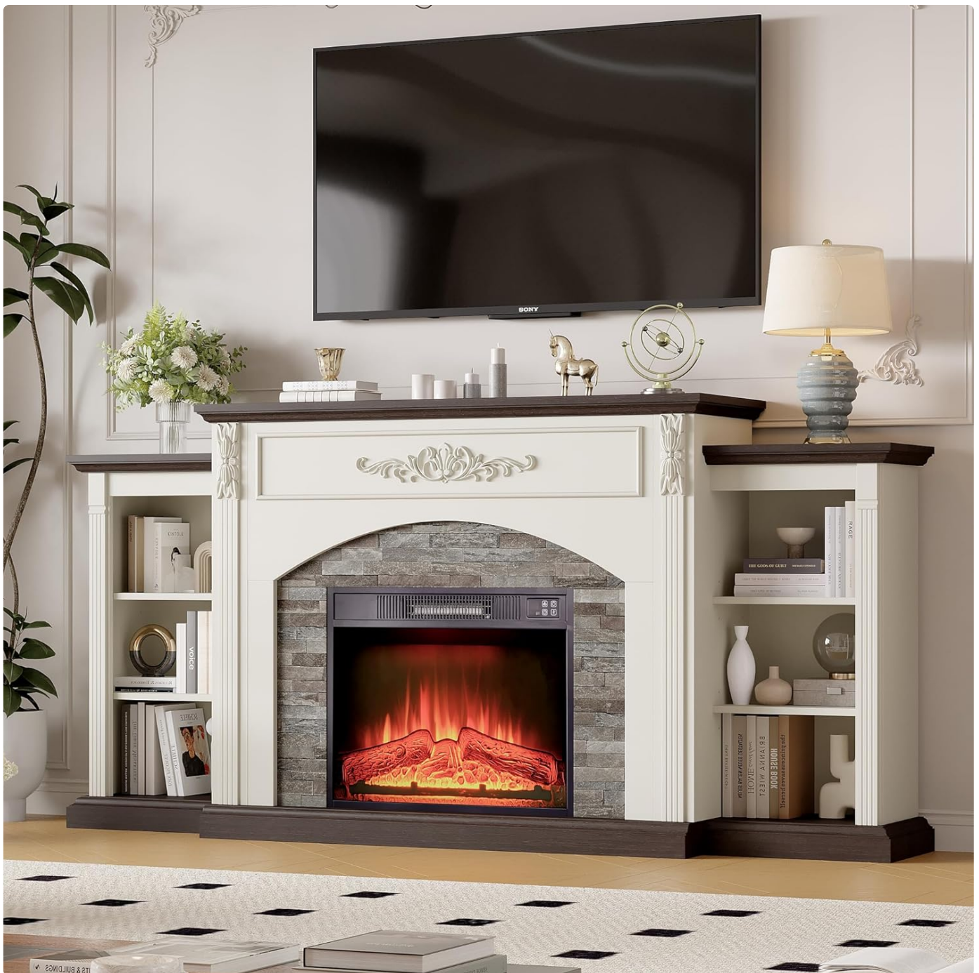
Figure 1.1: The BOSHIO 72" Electric Fireplace with Mantel, featuring an antique white and brown finish, designed to accommodate TVs up to 80 inches.