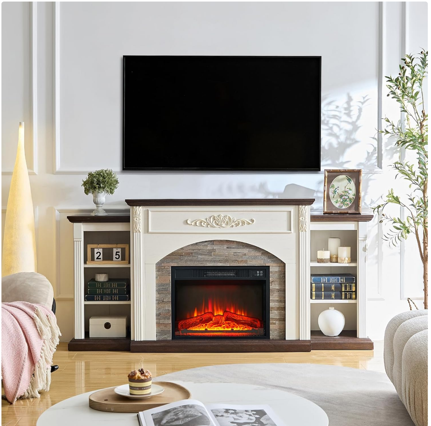
Figure 5.3: The fireplace mantel serving as an entertainment center, with a television mounted above and storage shelves on either side.