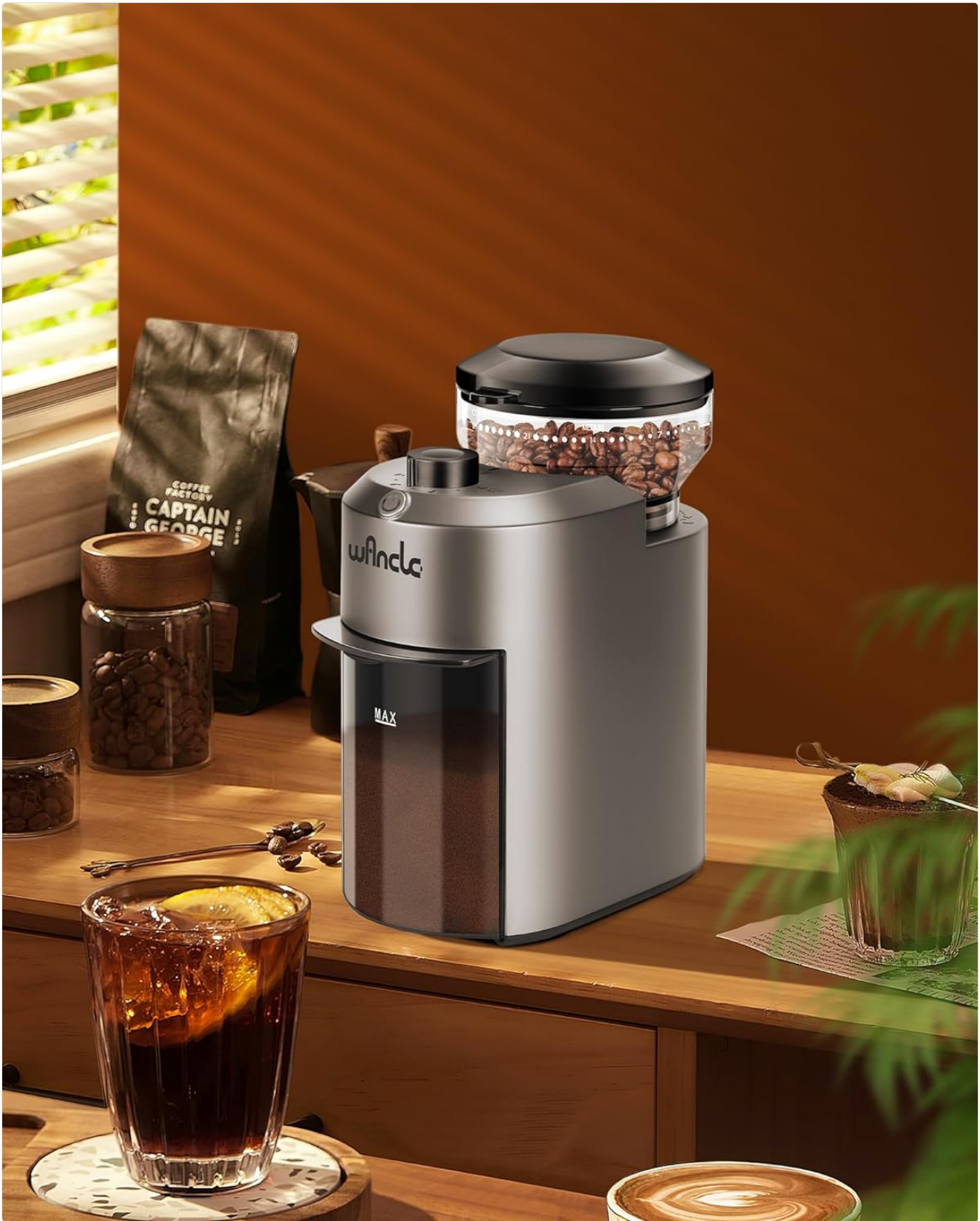
Image: The Wancle coffee grinder with its compact dimensions (190mm height, 90mm width, 162mm depth) highlighted.