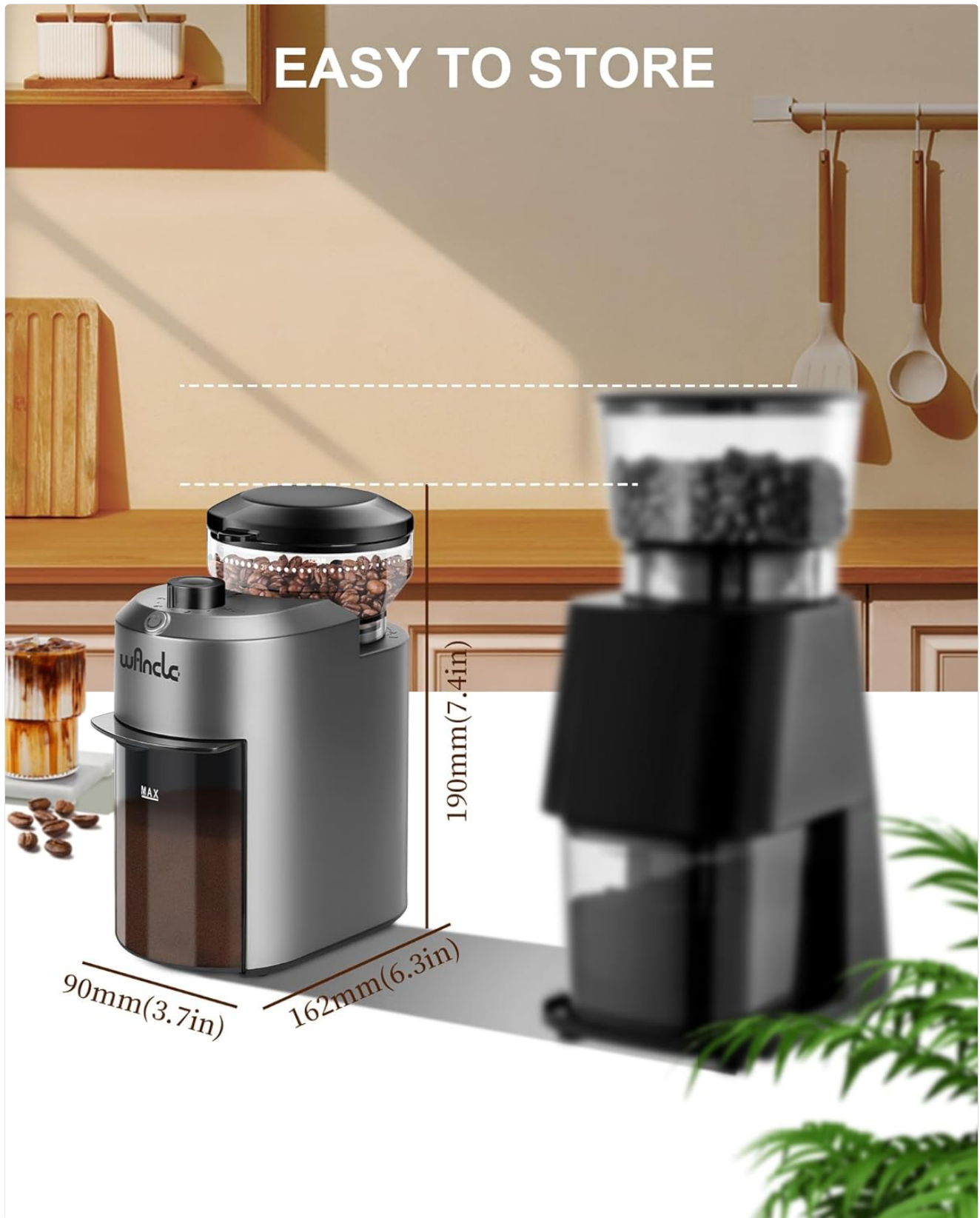
Image: The Wancle coffee grinder in a kitchen setting, with icons indicating low noise and overheat protection during operation.