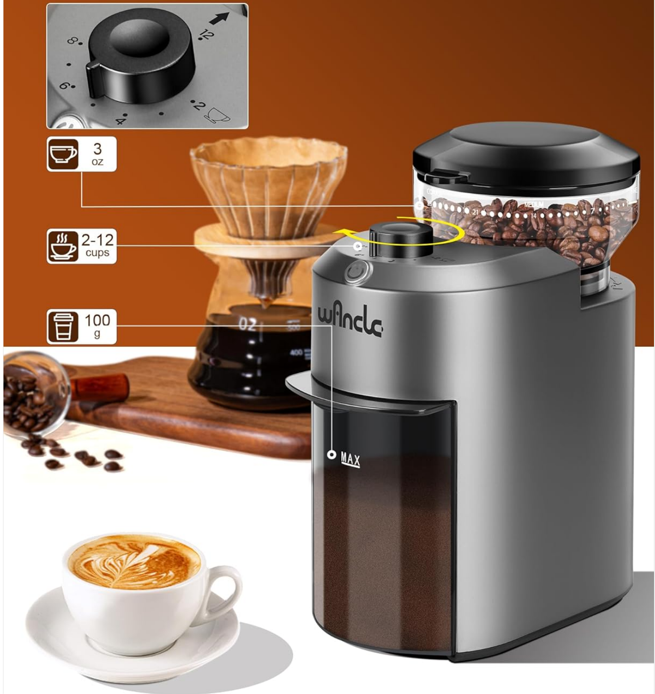
Image: The Wancle coffee grinder with an inset showing the cup selection dial, indicating settings for 2 to 12 cups.