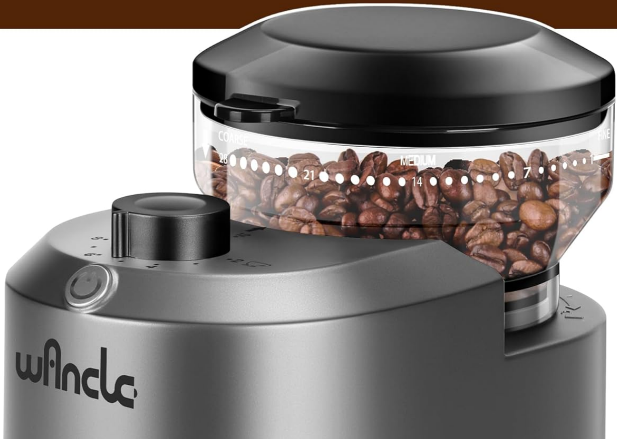
Image: Visual representation of the 28 precise grind settings, from coarse to fine, suitable for various brewing methods.