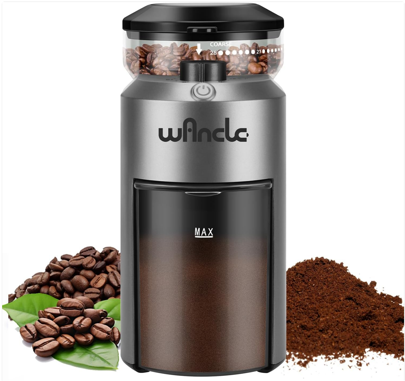
Image: The Wancle Electric Burr Coffee Grinder in grey, shown with whole coffee beans and ground coffee.