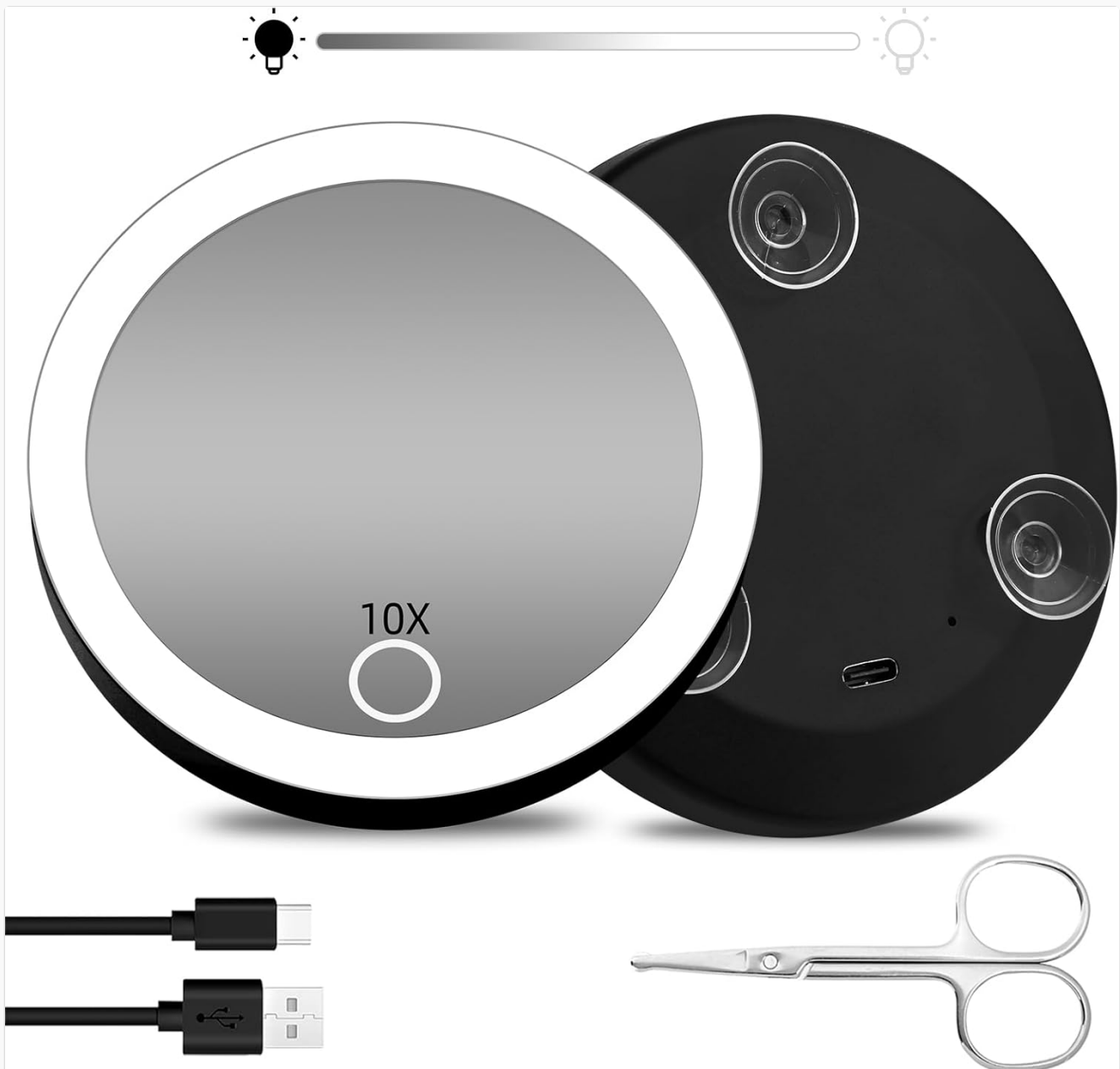
Image: Contents of the Suupvaor 10x Magnifying Mirror package, including the mirror, charging cable, and scissors.