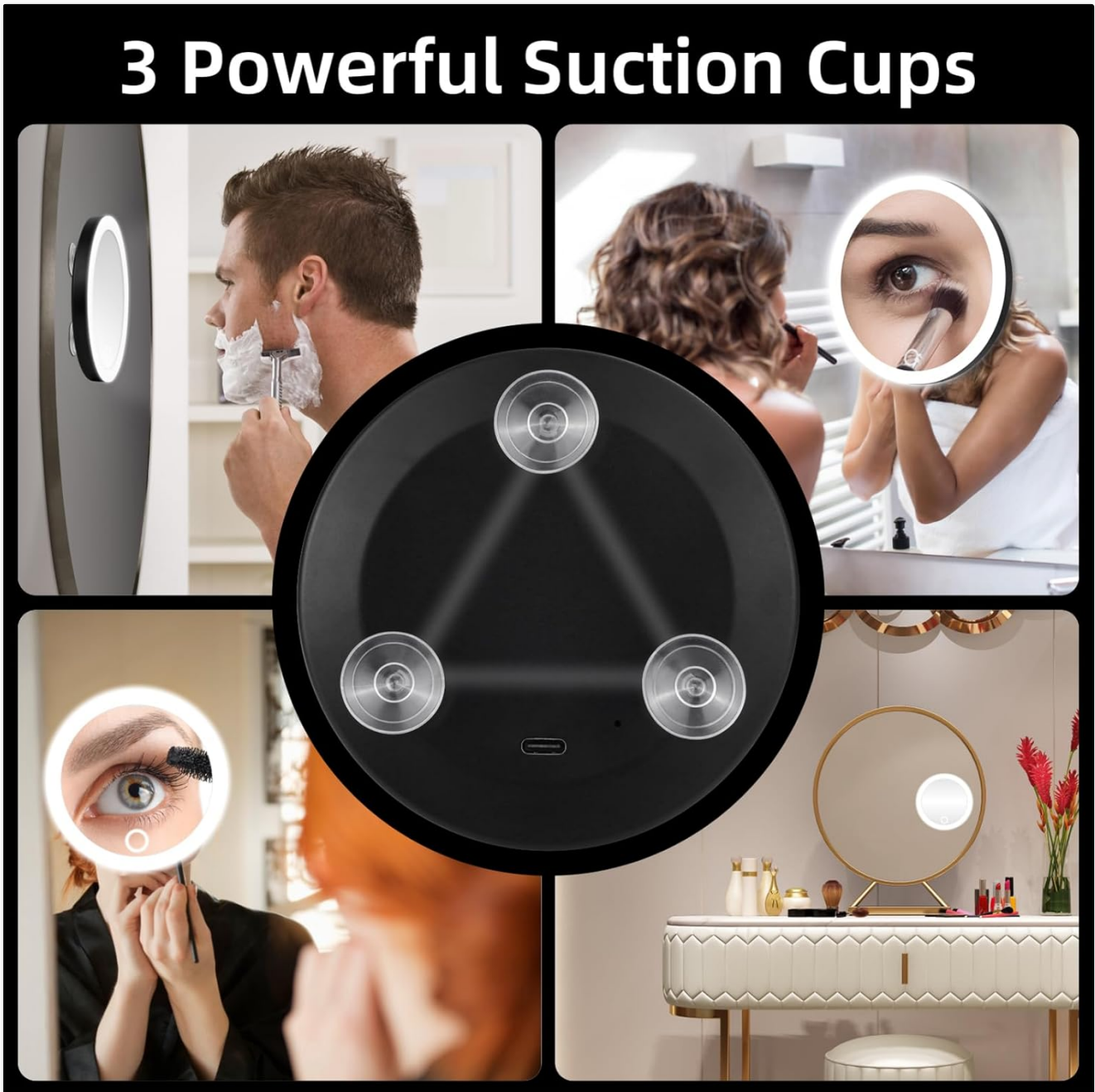
Image: The mirror's suction cups and examples of its use in various settings.