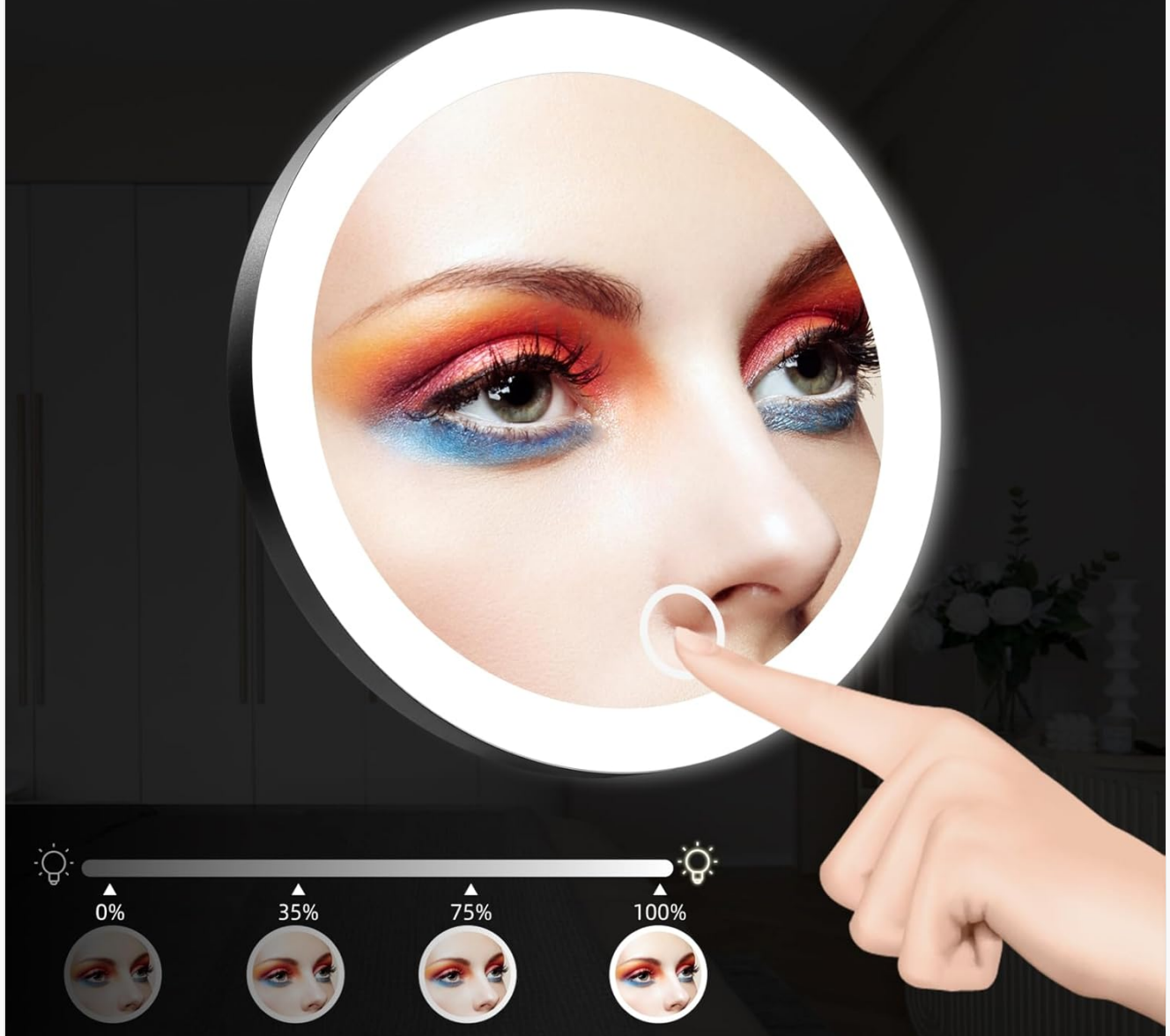
Image: Visual guide for adjusting the mirror's brightness.