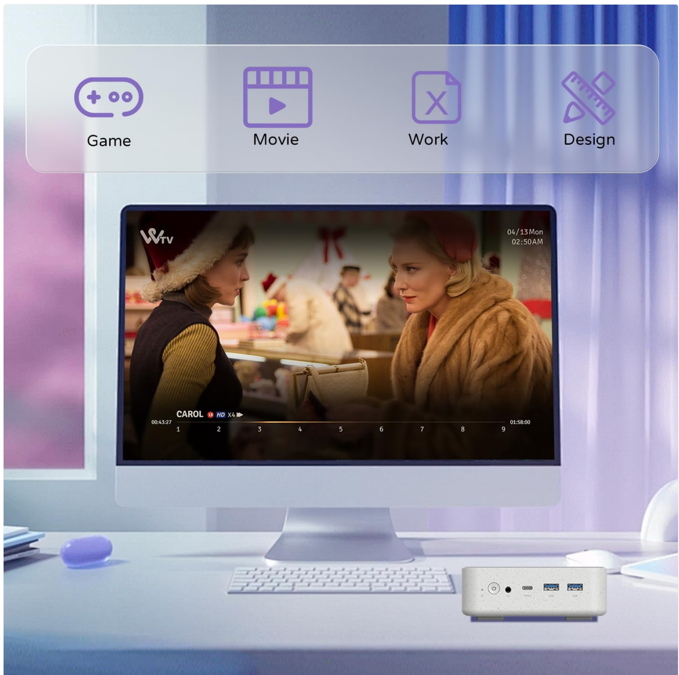
The Mini PC in a typical desktop setup, illustrating its capability for various tasks.