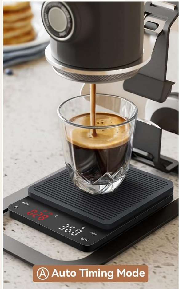
Image: The scale displaying both manual and automatic timing modes during espresso preparation and pour-over brewing.