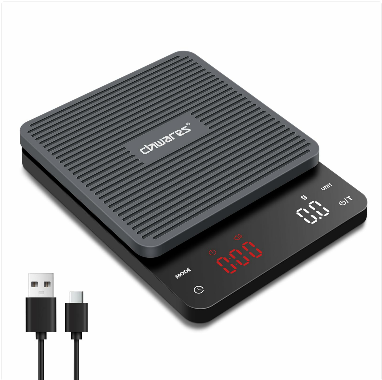
Image: The CHWARES Digital Coffee Scale, showcasing its sleek design and LED display.