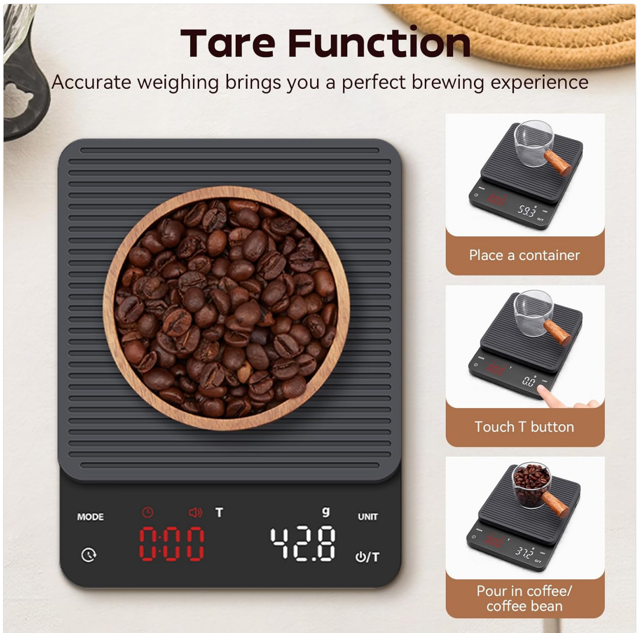
Image: A step-by-step illustration of using the tare function to zero out the weight of a container before adding coffee beans.

Accurate weighing brings you a perfect brewing experience