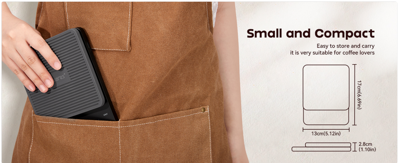
Image: The compact dimensions of the scale are highlighted, emphasizing its portability and ease of storage.