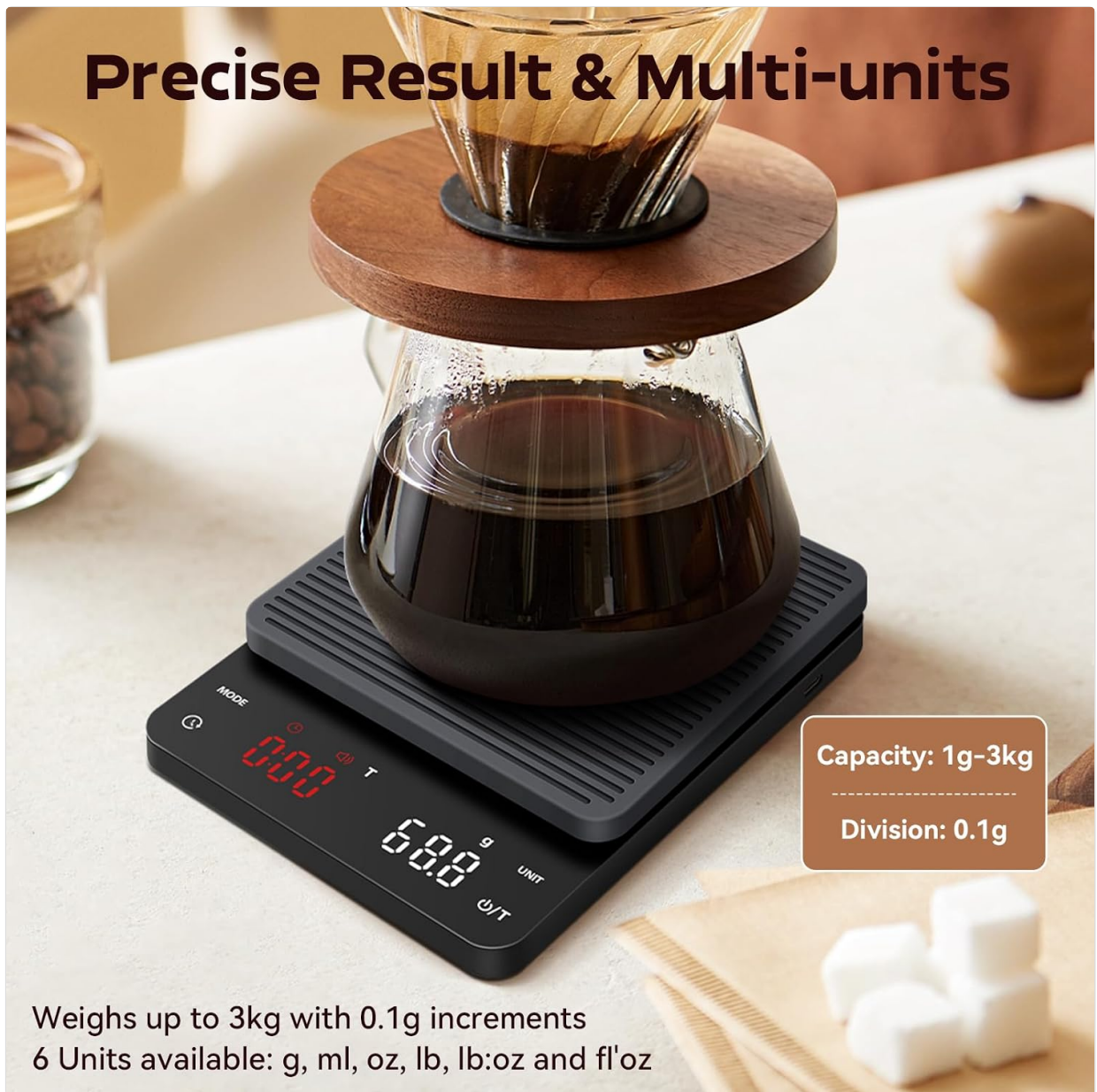
Image: The scale displaying weight in grams, highlighting its precise measurement and multi-unit capability.