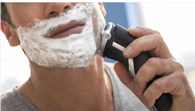
Image: A man performing a wet shave with the PHILIPS Series 3000 Electric Shaver, with shaving foam visible on his face.