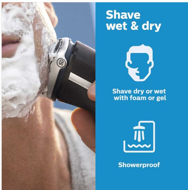
Image: Graphic illustrating the shaver's wet and dry capabilities, showing icons for dry/wet shaving with foam/gel and showerproof use. A man is shown shaving with foam.