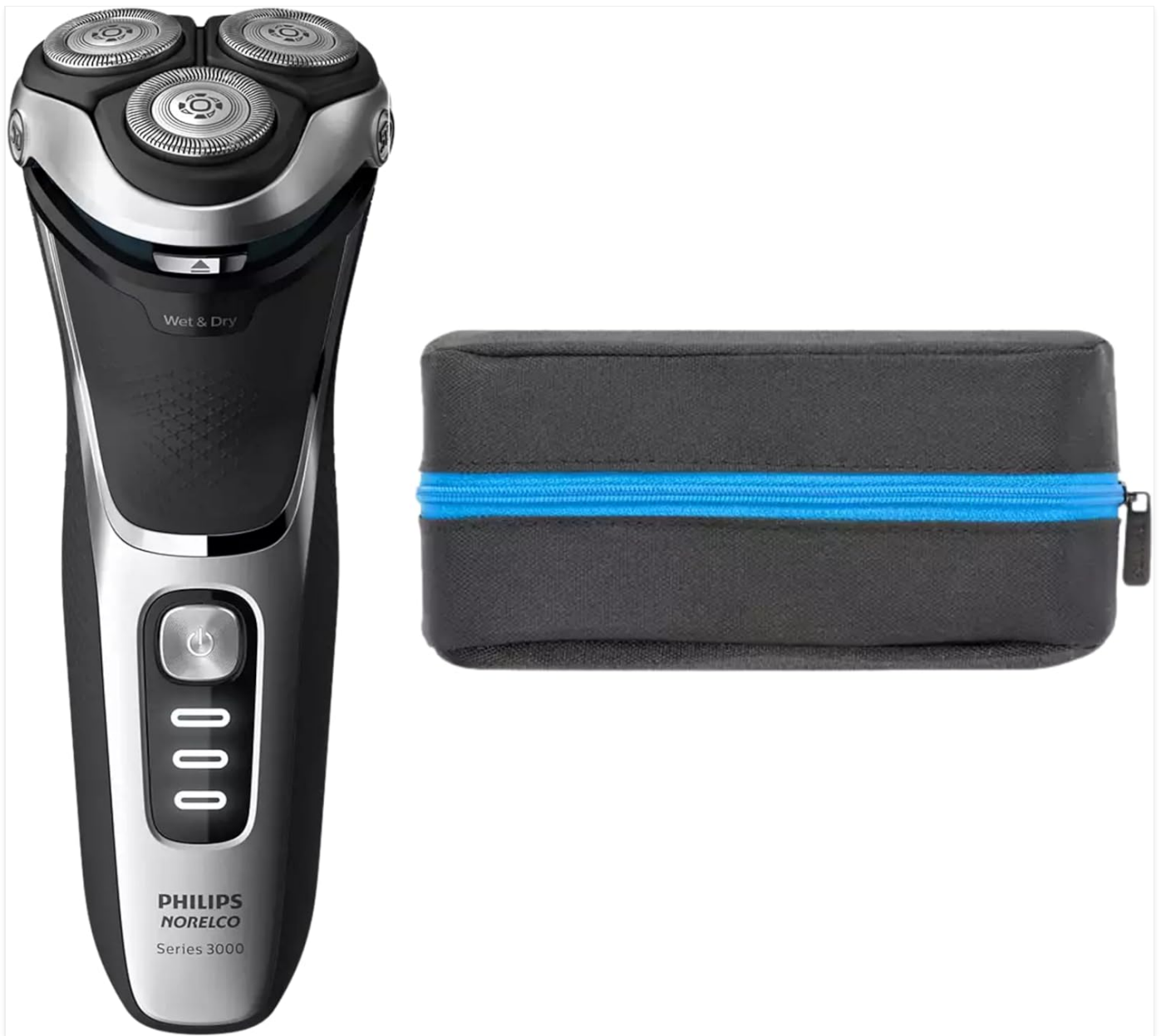
Image: The PHILIPS Series 3000 Electric Shaver shown alongside its included travel case. The shaver is black and silver with three rotary shaving heads and a power button with battery indicators. The travel case is grey with a blue zipper.