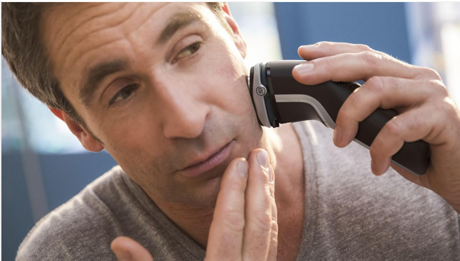
Image: A man performing a dry shave with the PHILIPS Series 3000 Electric Shaver, demonstrating proper handling.