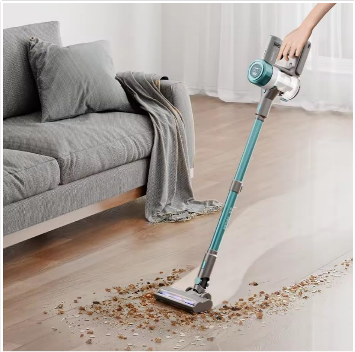
Figure 3.1: The vacuum assembled in stick mode, ready for use on floors.