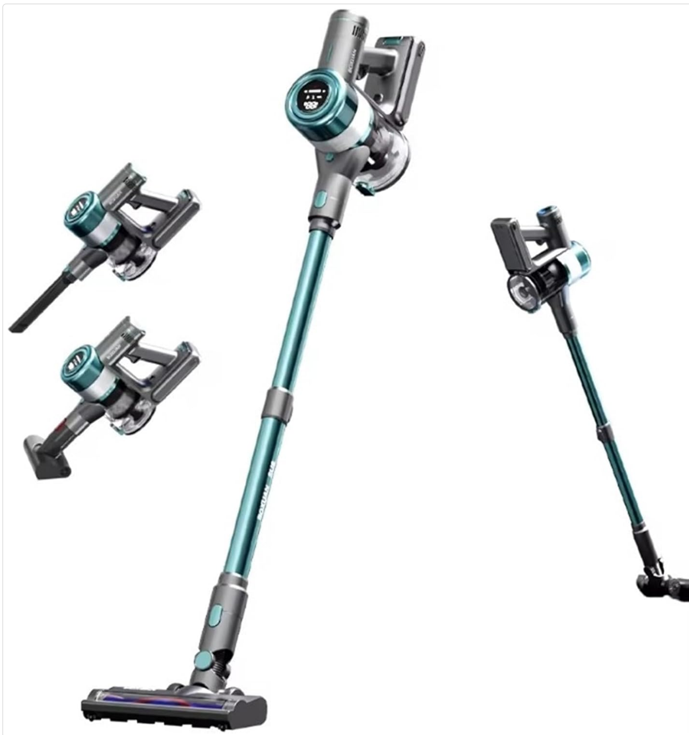
Figure 2.1: Main unit, extension wand, floor brush, and handheld configurations.