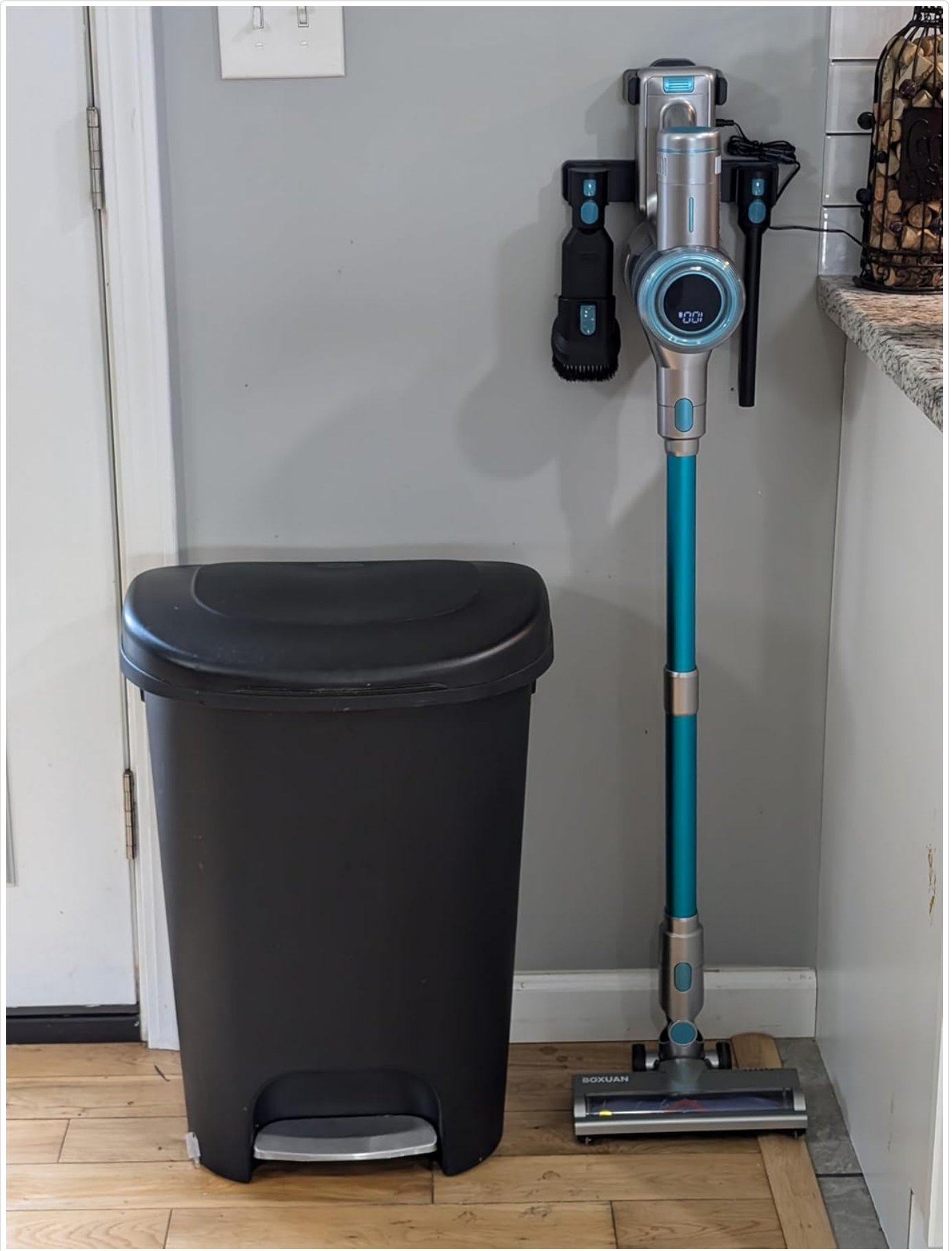
Figure 4.1: The vacuum cleaner stored and charging on its wall-mounted holder.