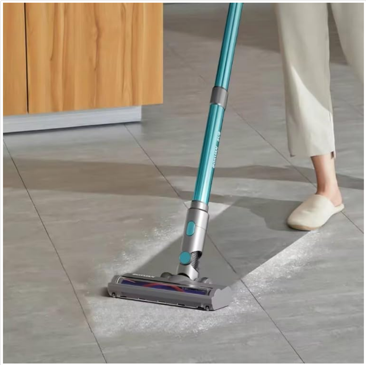
Figure 5.3: The vacuum effectively cleans debris from tiled surfaces.