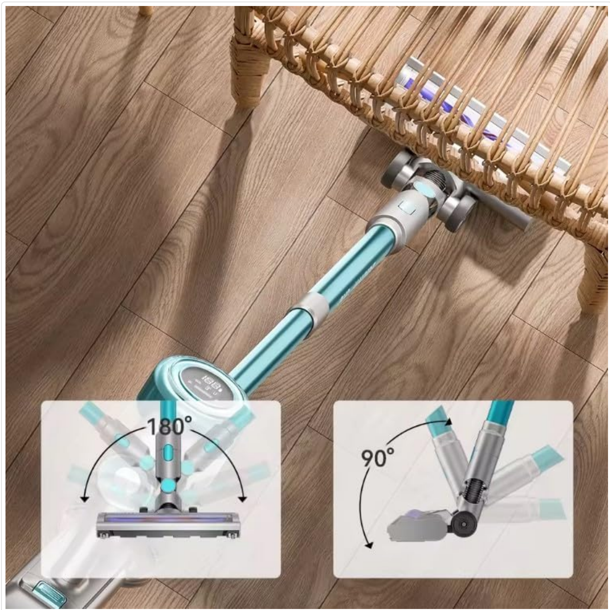
Figure 5.2: The flexible floor brush allows for easy maneuverability, including 180° swivel and 90° tilt to clean under low furniture.