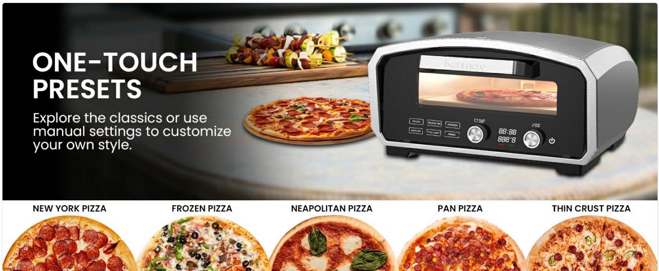
NEW YORK PIZZA

Explore the classics or use manual settings to customize your own style.