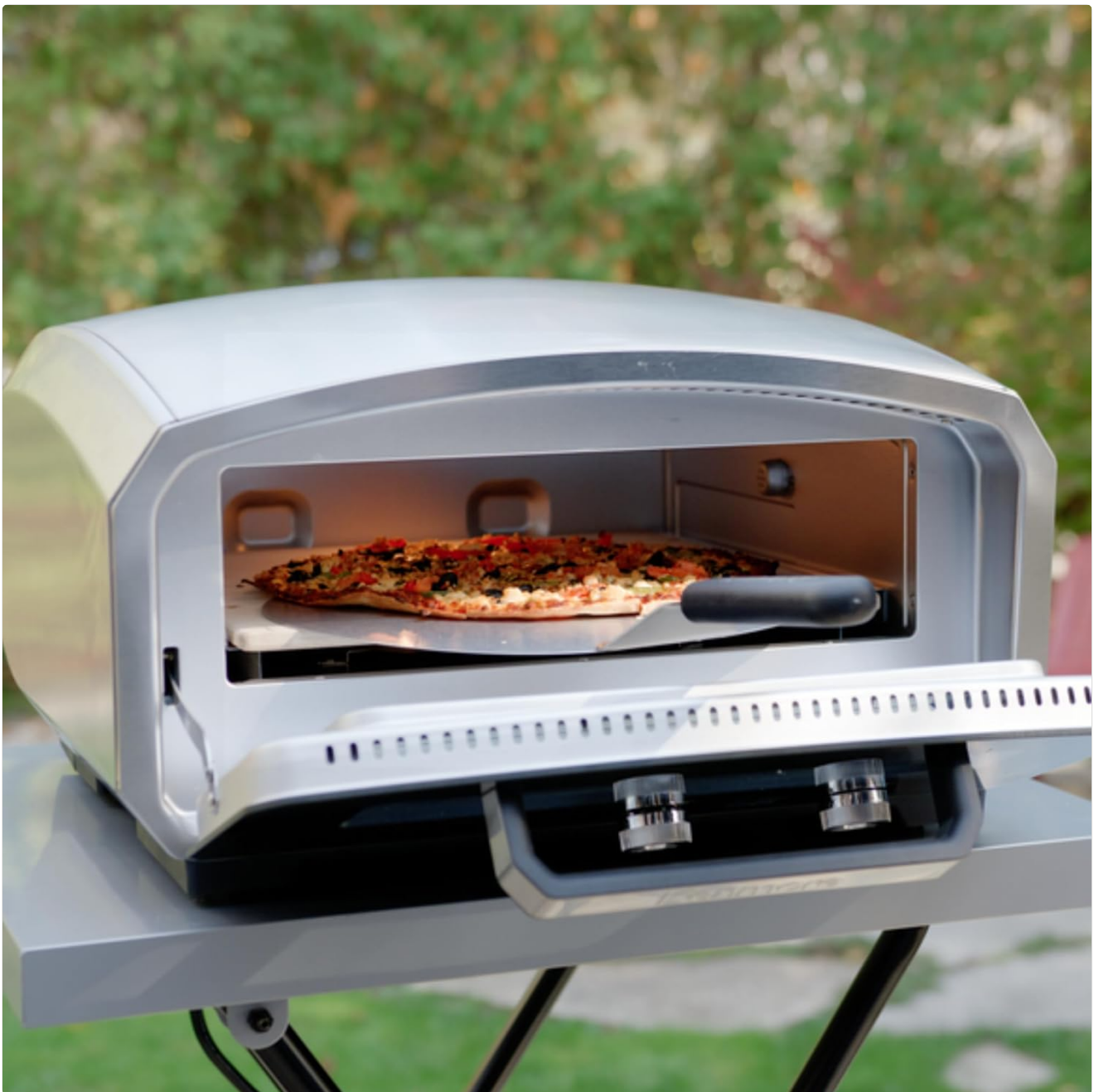
Image: The Kenmore pizza oven with its front door open, revealing a pizza baking on the stone inside. The oven is positioned outdoors on a stand, highlighting its versatility.