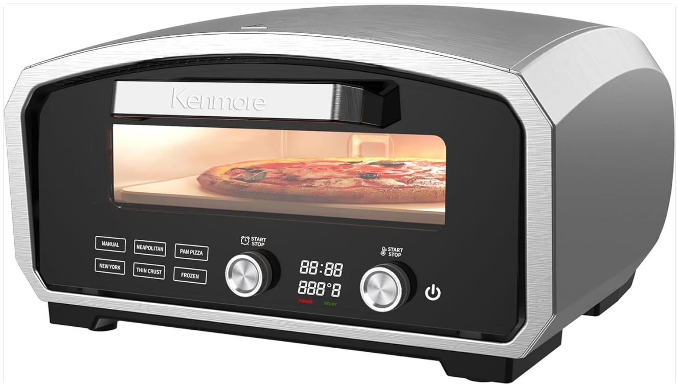
Image: The Kenmore pizza oven, a sleek silver and black appliance, is shown on a kitchen countertop with a pizza baking inside, illustrating its compact design and readiness for use.