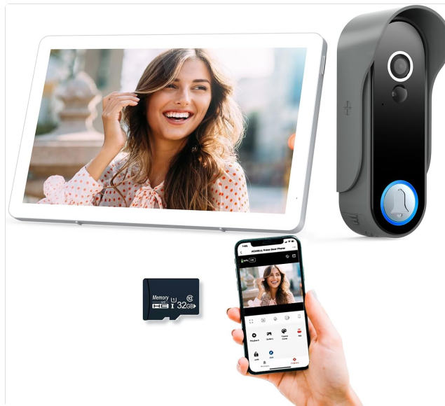
Image 2.1: Main components of the SIMBAILAI Wireless Video Doorbell system.