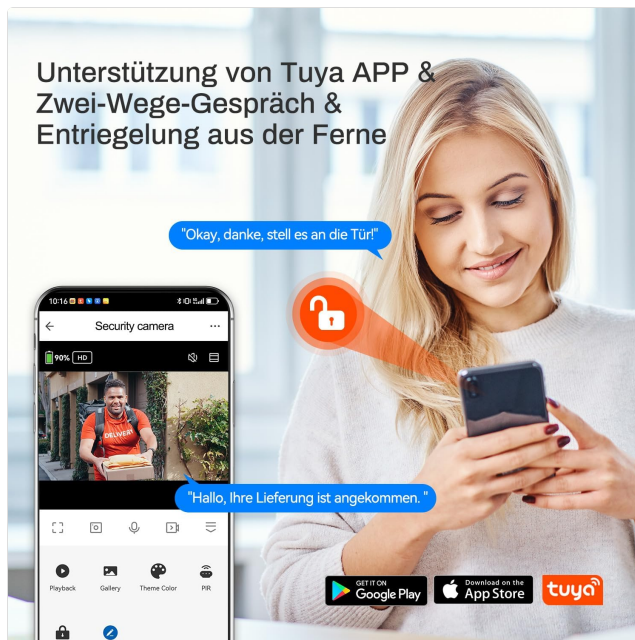
Image 3.3: Tuya Smart app interface for two-way talk and remote unlocking.