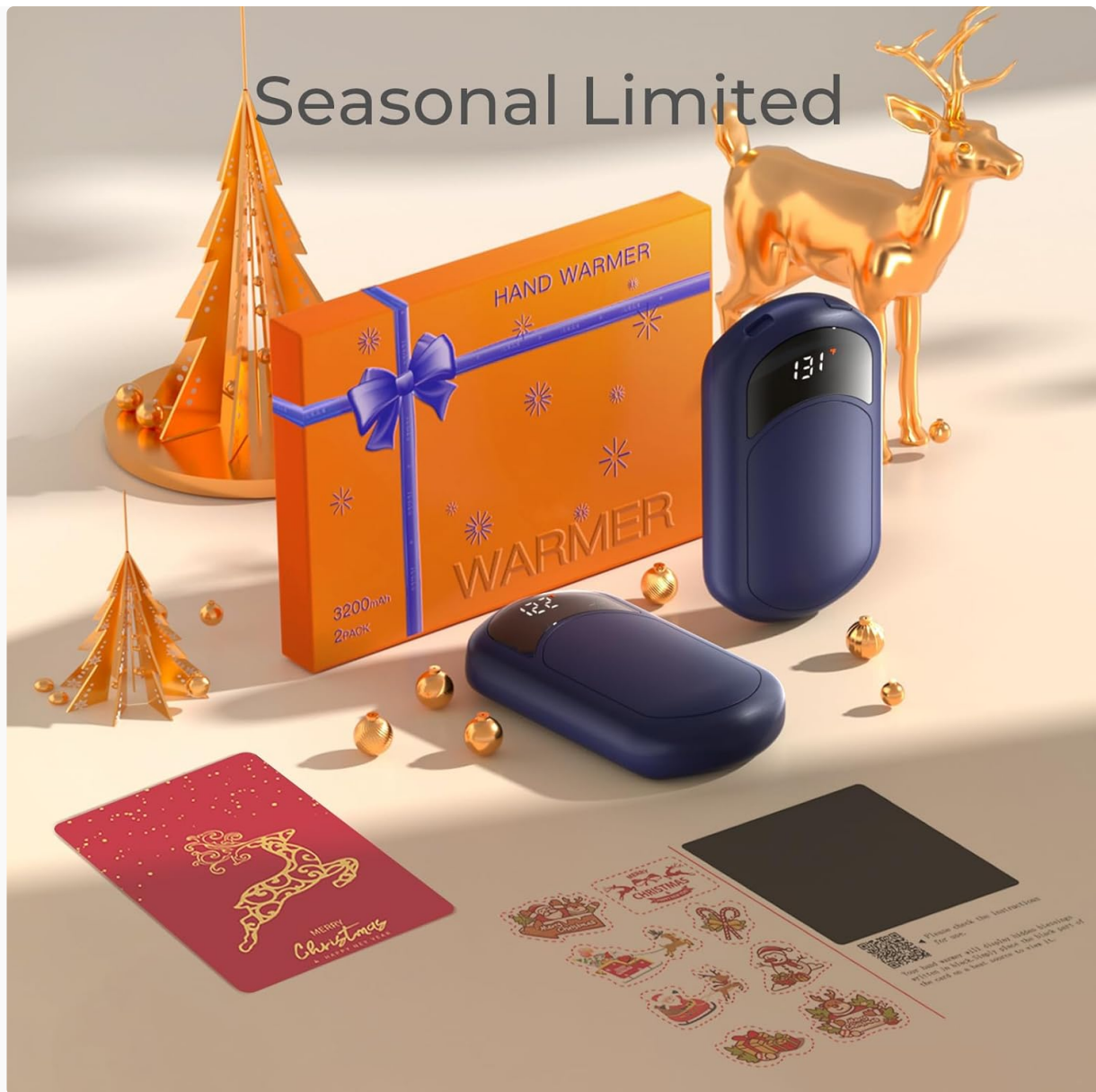
Figure 2.1: Contents of the Hotdot Hand Warmers package, including two devices, a charging cable, and the user manual.