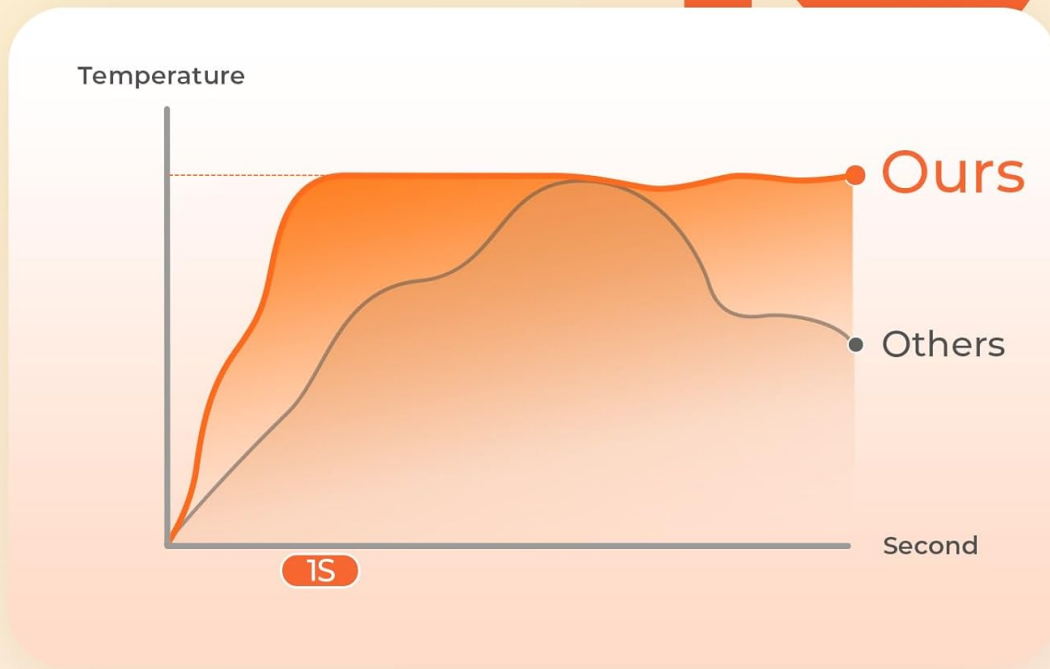
Figure 5.2: A graph comparing the rapid heating time of the Hotdot hand warmer (1 second) to other devices.